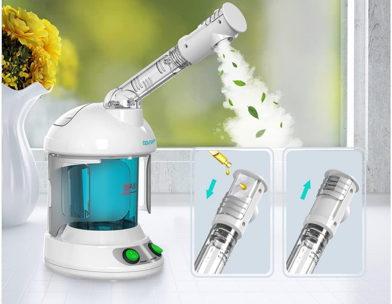
Image: An illustration demonstrating the simple process of adding essential oils to the designated aromatherapy cotton pad within the steamer's nozzle.

Place a few drops of your favorite essential oil on the aromatherapy cotton pad. You will have the great apparatus of aromatherapy.