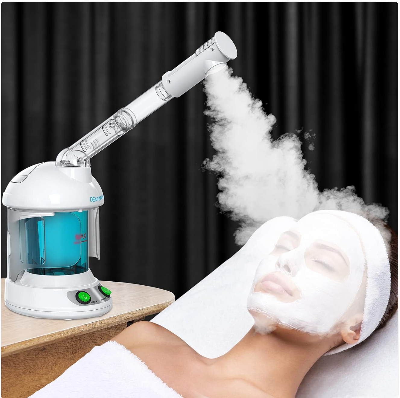
Image: The DENFANY Nano Ionic Facial Steamer in operation, providing steam to a person's face for a relaxing and beneficial skincare treatment.