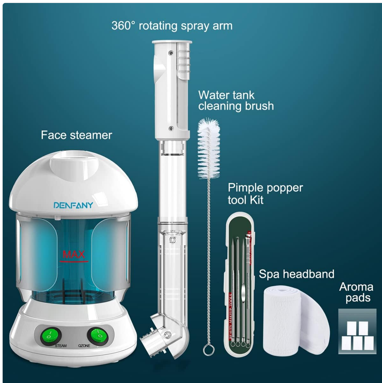
Image: A detailed diagram showcasing the extendable and 360-degree rotatable capabilities of the steamer's arm, along with its dimensions.