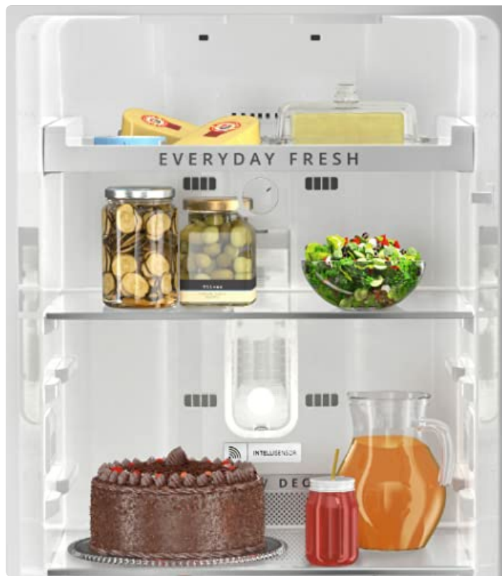
Image 4.3: Fresh food compartment detail. This image shows the 'Everyday Fresh' and 'Farm Fresh' zones, designed for optimal storage of various food items, and the Intellisensor.