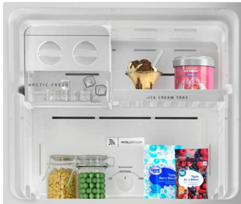
Image 4.2: Freezer compartment detail. This image highlights the 'Arctic Fresh' zone, the ice cream tray, and the Intellisensor for precise temperature management.

Select the desired mode using the control panel on the refrigerator door.