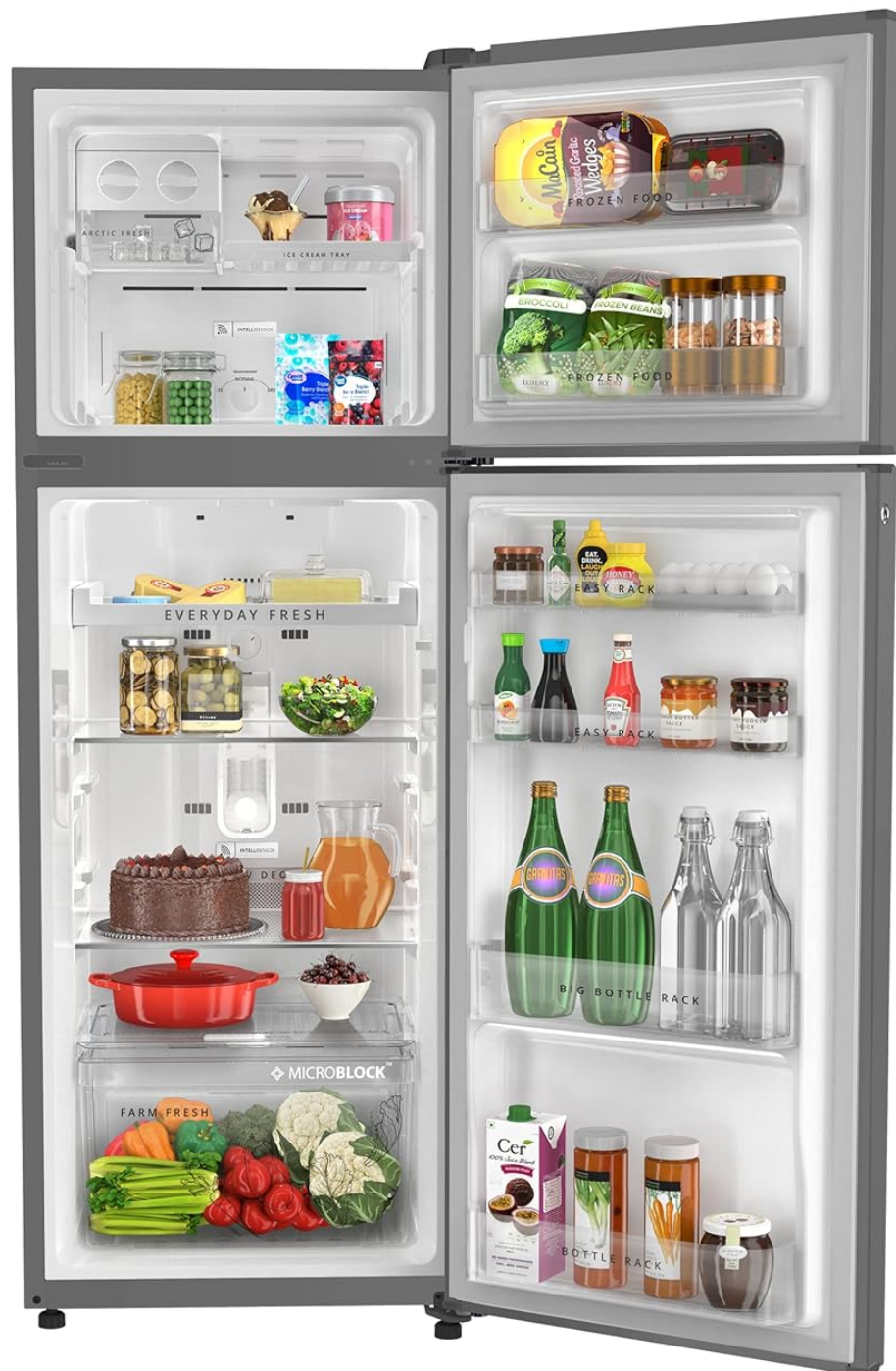
Image 4.1: Interior layout with food items. This image illustrates the spacious design of both the freezer and fresh food compartments, including shelves and door bins.