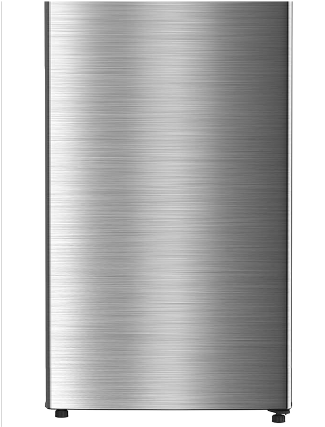
Image 1.1: Front view of the Whirlpool 340 L INTELLIFRESH INV CNV 355 2S Refrigerator. This image displays the sleek German Steel exterior and the control panel located on the upper door.