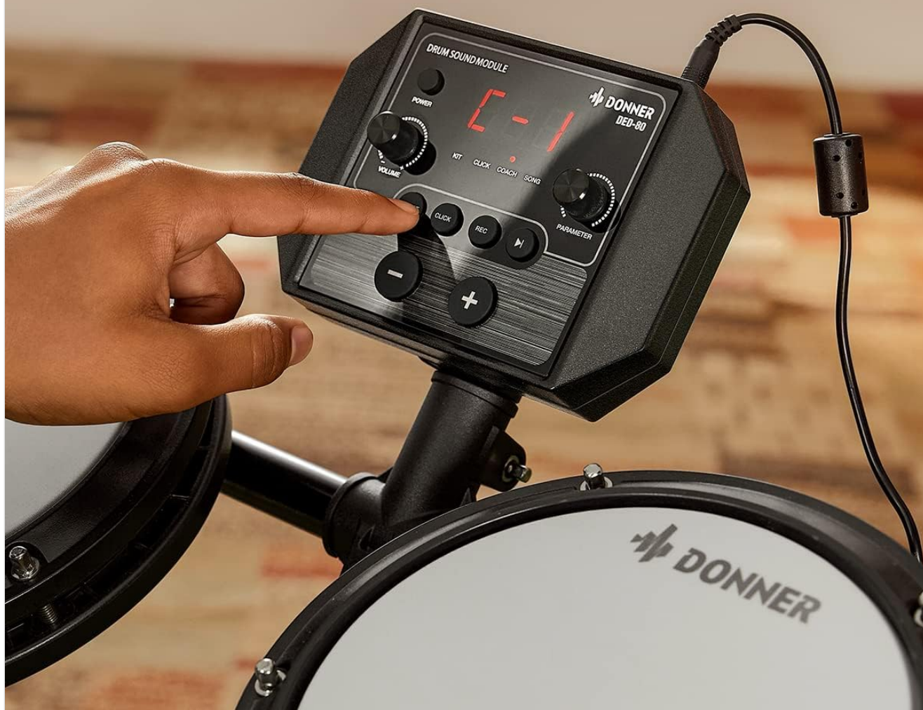
Figure 4: The DED-80 drum sound module provides access to 180 sounds, 15 drum kits, and 30 demo songs.