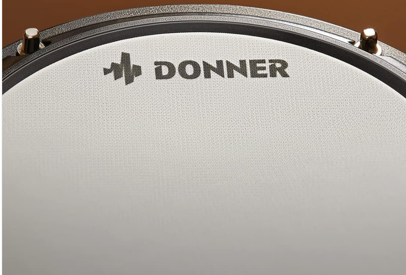
Figure 6: Double-layer mesh heads provide authentic playing feel and high sensitivity for dynamic drumming.