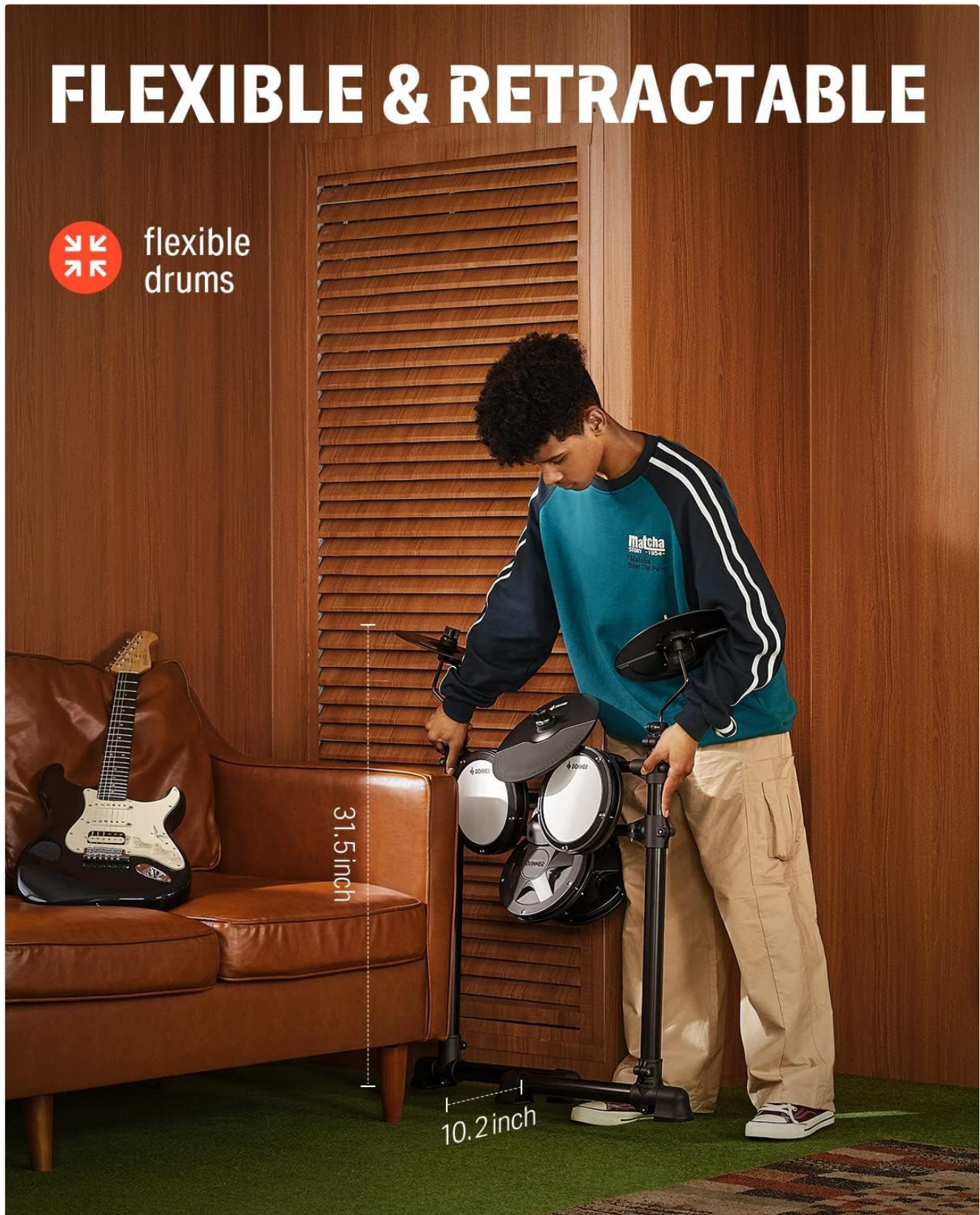
Figure 3: The DED-80 features a flexible and retractable design for easy storage and portability.