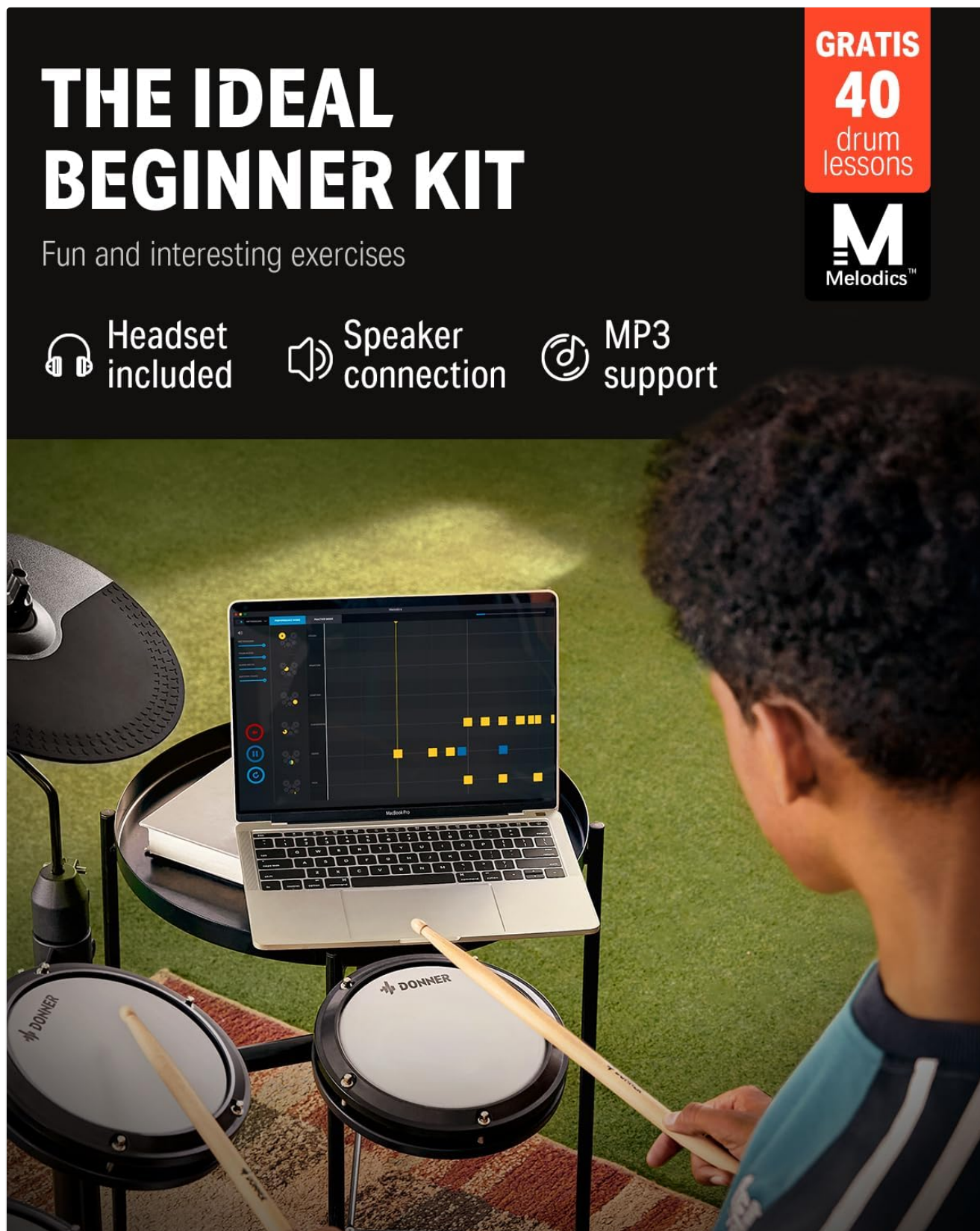
Figure 2: The DED-80 kit is designed for easy assembly, making it ideal for beginners.