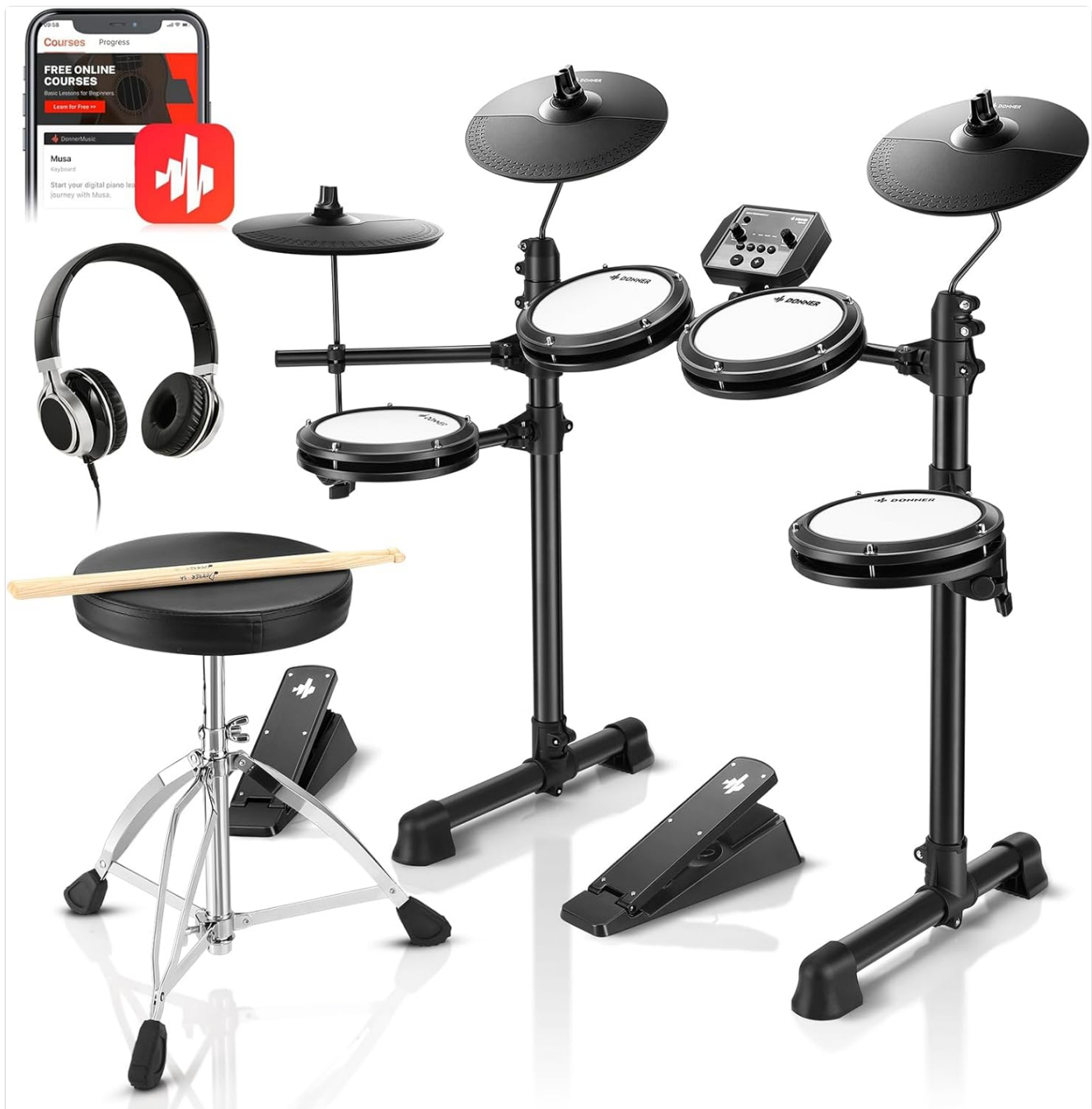
Figure 1: Complete Donner DED-80 Electronic Drum Set including pads, cymbals, module, pedals, throne, headphones, and sticks.