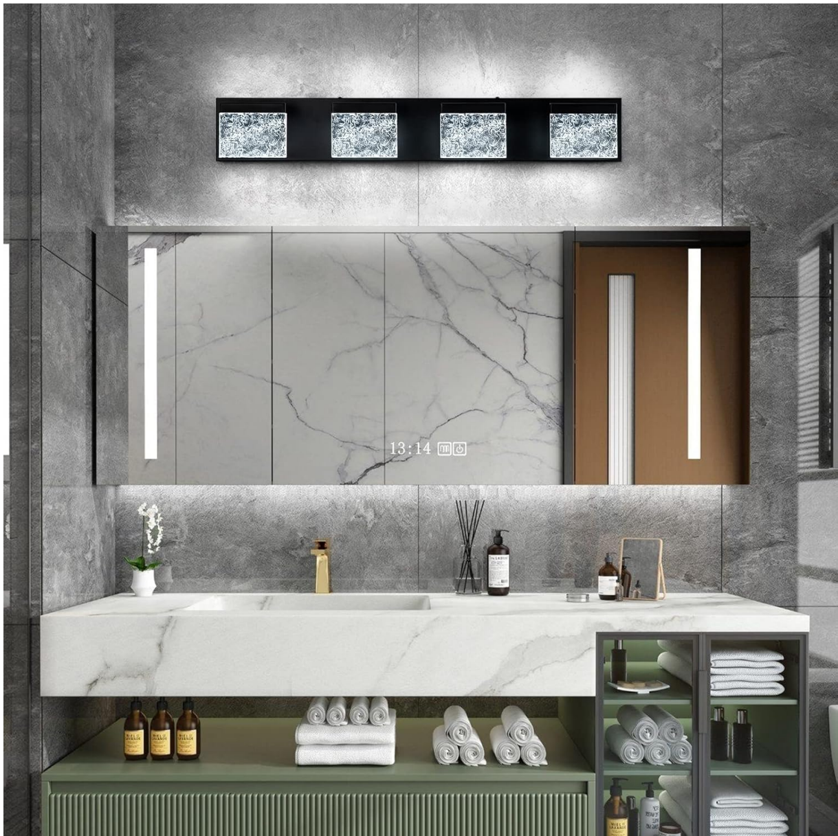
Image: The EDISLIVE vanity light fixture installed above a mirror in a modern bathroom setting.