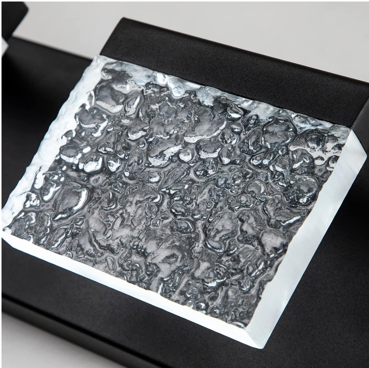
Image: A close-up view of the textured glass shade, highlighting its design and material.