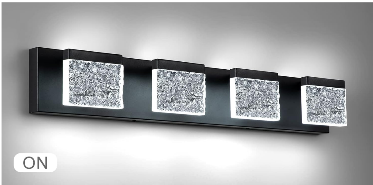
Image: The vanity light fixture shown in both the 'OFF' and 'ON' states, demonstrating its illumination.