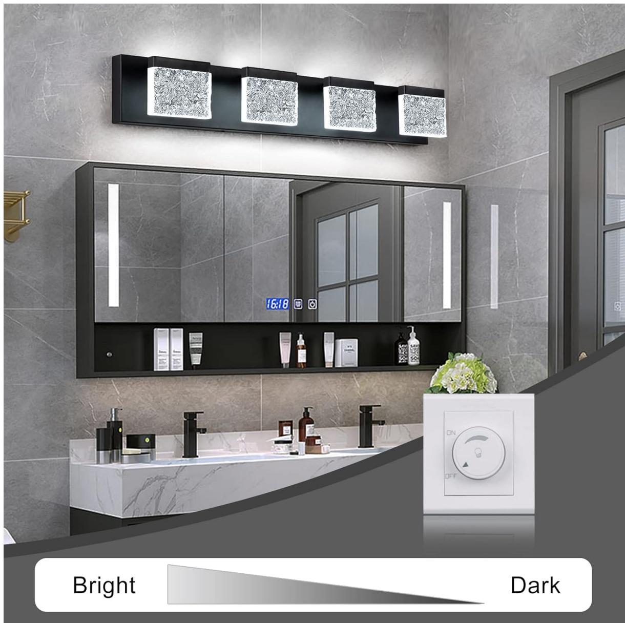
Image: The vanity light fixture installed in a bathroom, with an illustration of an external dimmer switch to control brightness from bright to dark.