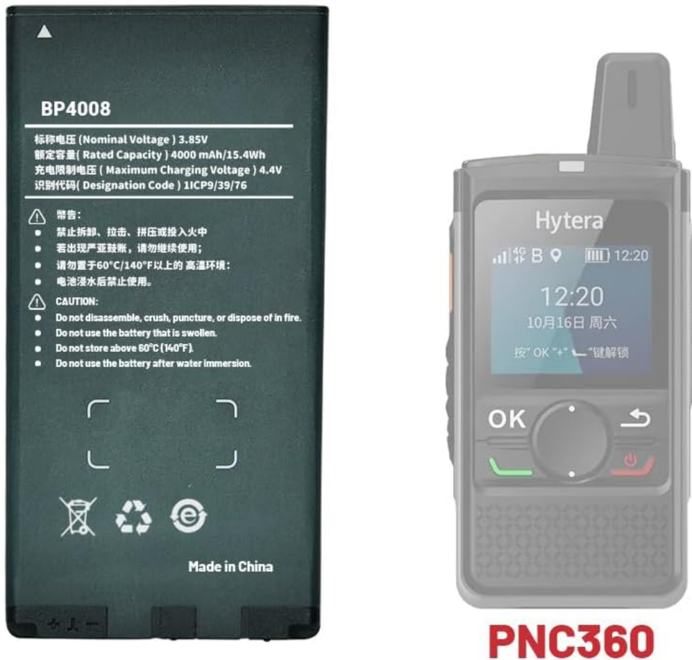
Image 2.2: BP4008 Battery compatible with Hytera PNC360 Walkie Talkie.

The battery is manufactured using ultrasonic sealing technology and features an impact-resistant design with dual protection PCM for short circuit prevention.