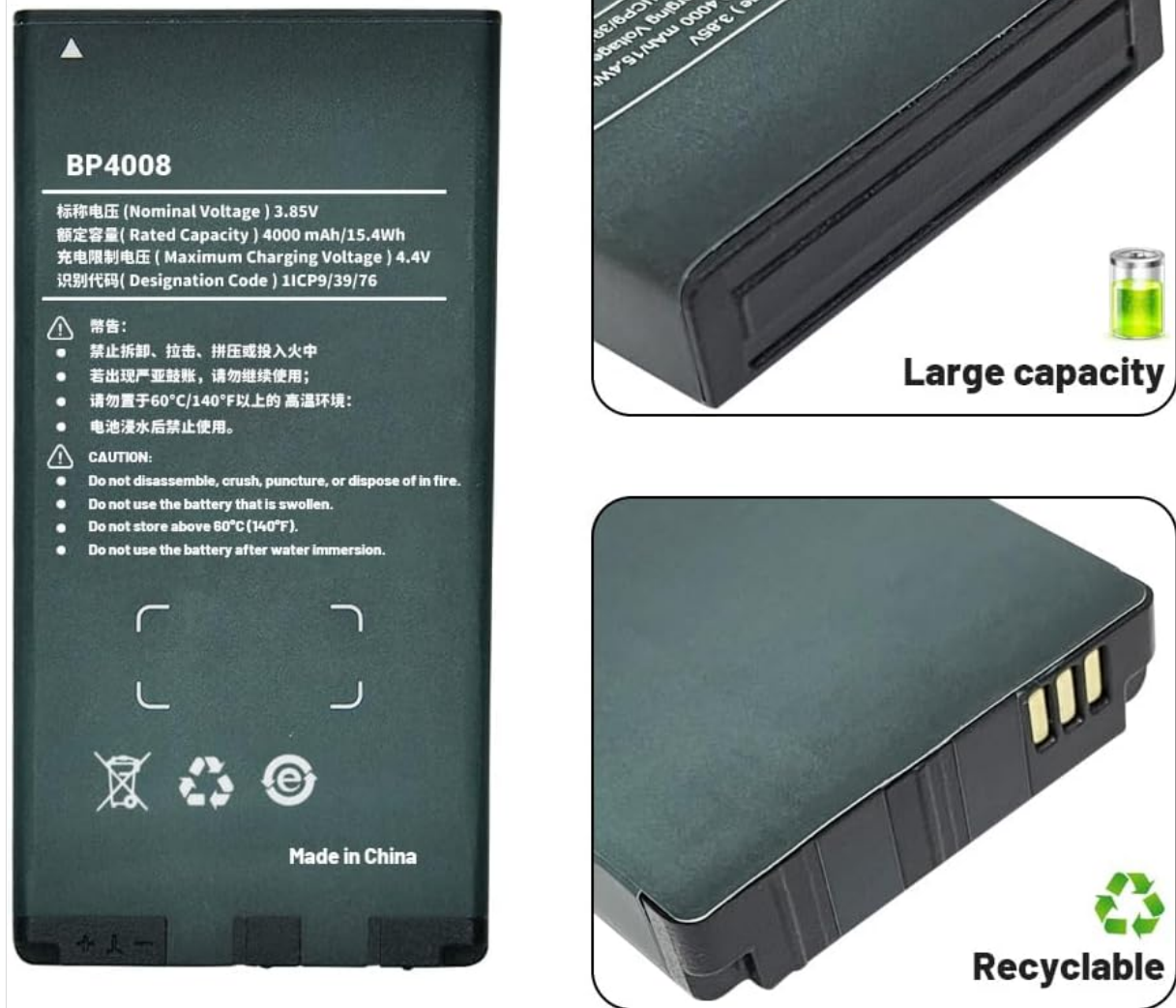
Image 6.1: BP4008 Battery features, including large capacity and recyclability.