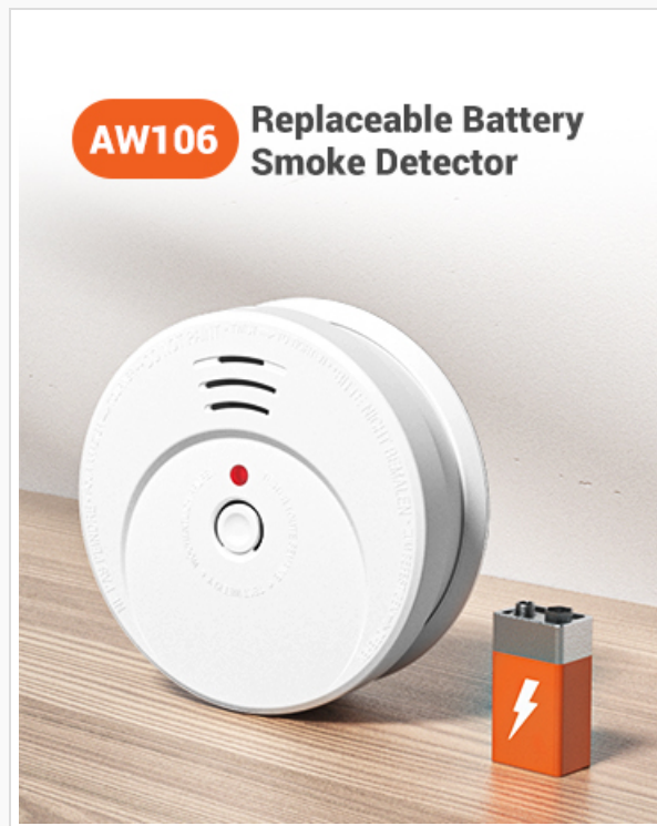
Image 7.1: The Jemay AW106 smoke detector with its replaceable 9V battery.