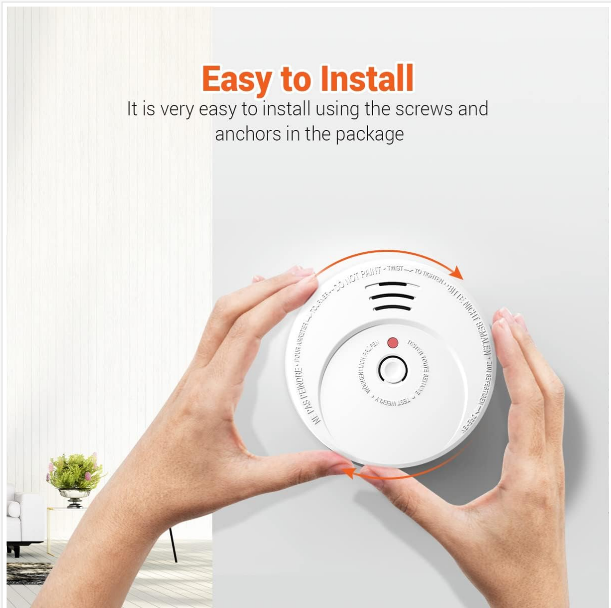
Image 5.1: Illustrates the process of installing the smoke detector.