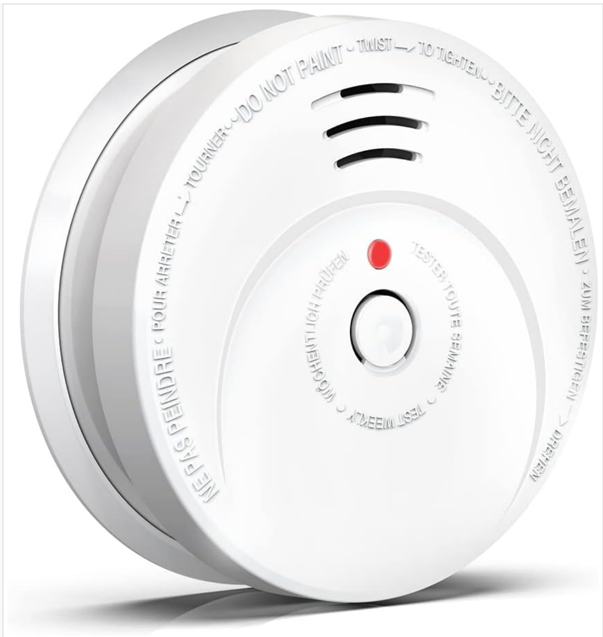
Image 1.1: Front view of the Jemay AW106 Photoelectric Smoke Detector.