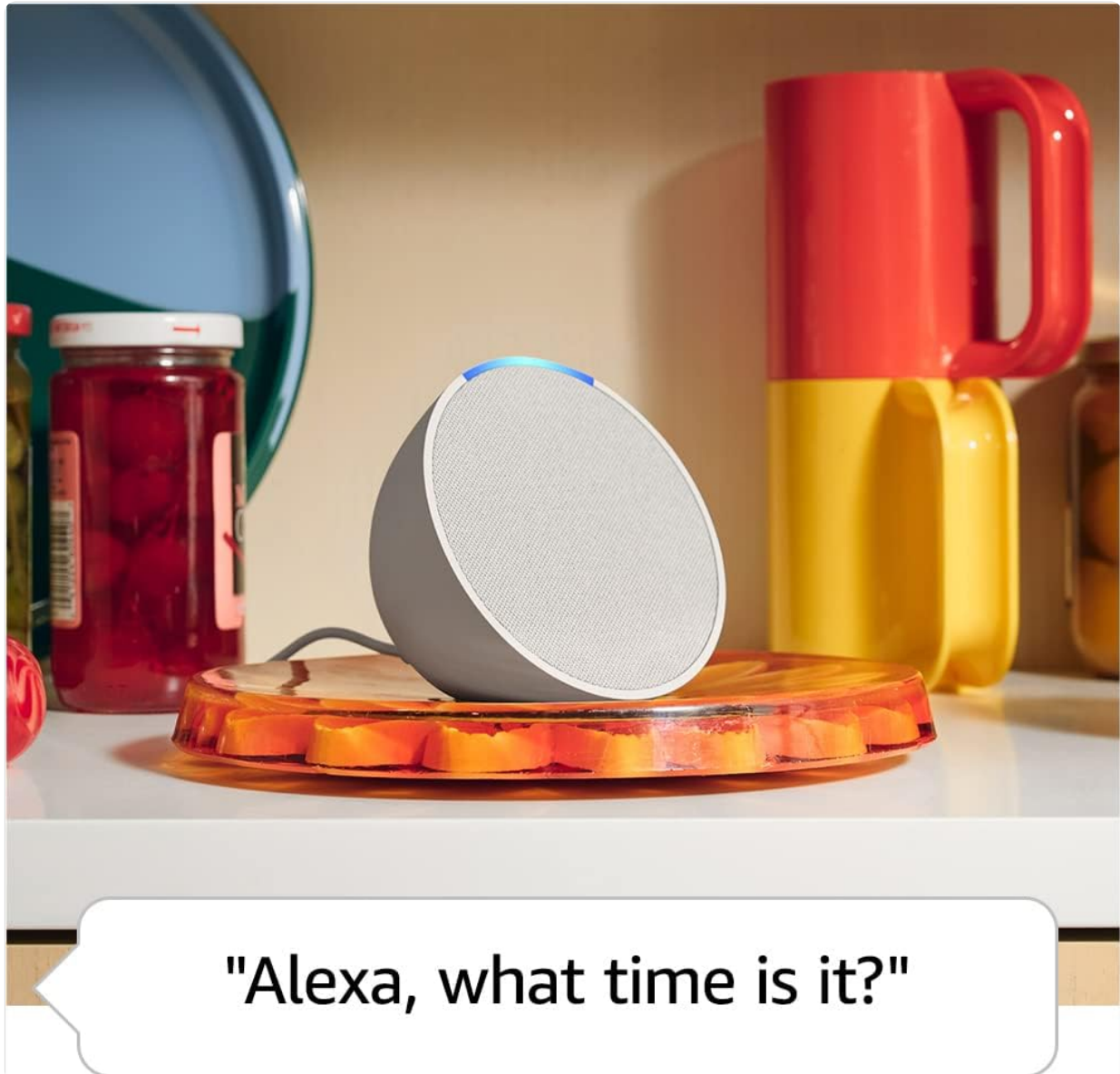
Image: An Amazon Echo Pop, light gray, situated on a kitchen shelf next to various kitchen items. A speech bubble overlay reads, "Alexa, what time is it?", demonstrating a common voice command.