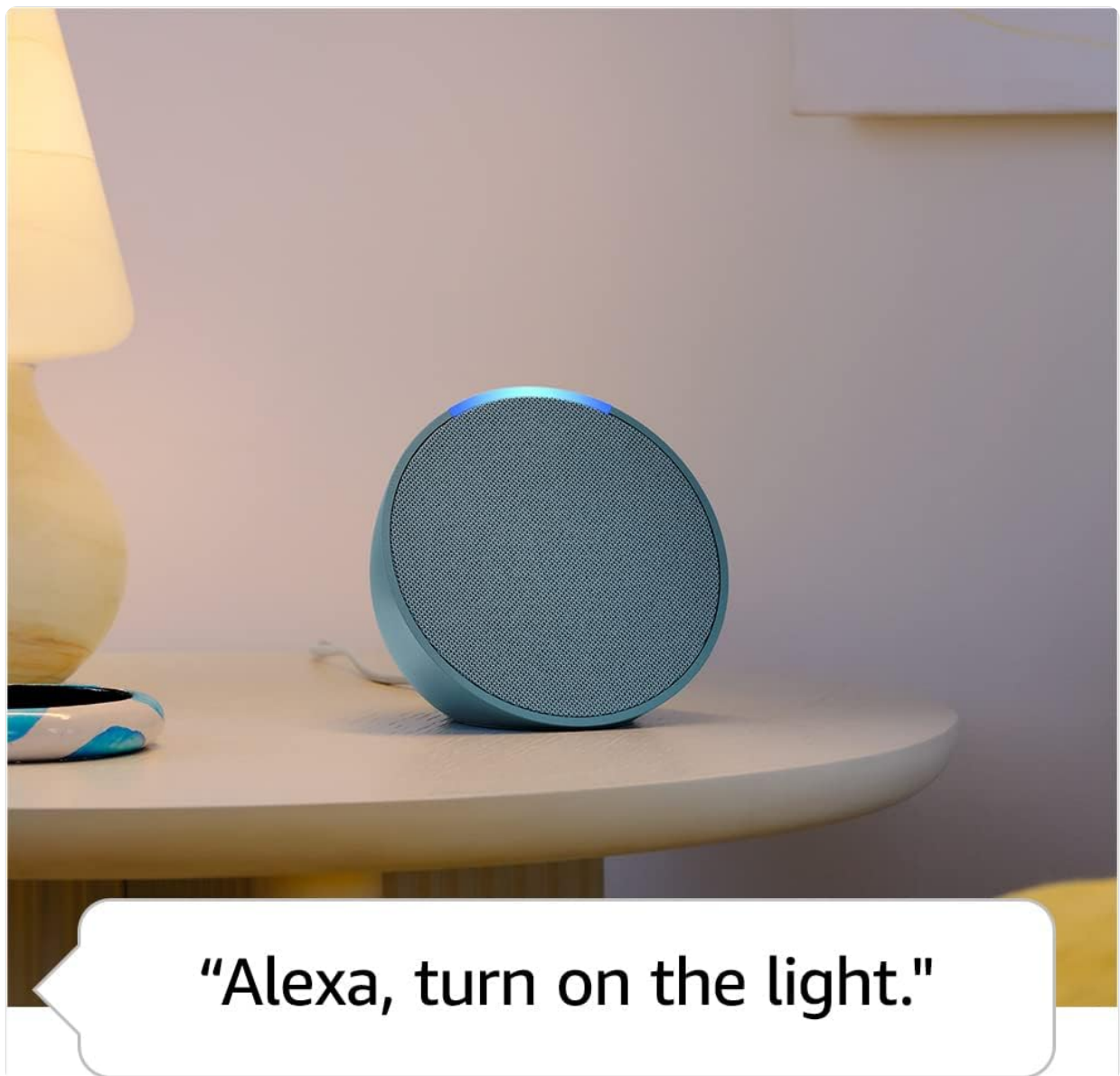
Image: An Amazon Echo Pop, teal, resting on a bedside table next to a lamp. A speech bubble overlay displays, "Alexa, turn on the light.", demonstrating its smart home control function.