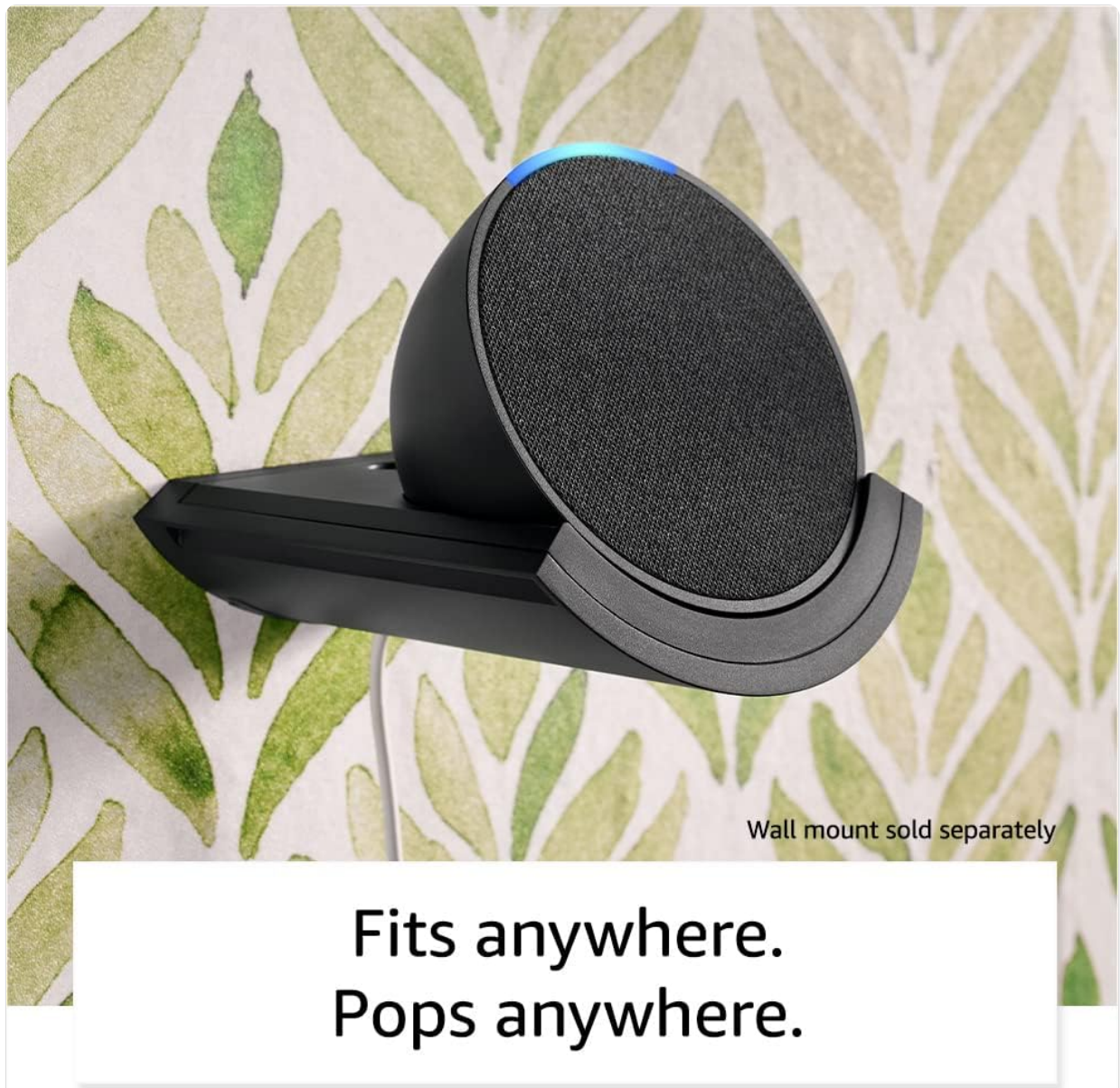
Image: An Amazon Echo Pop device, dark gray, mounted on a wall bracket. This illustrates the device's compact design and versatility for placement in various locations.

For optimal performance, place your Echo Pop in a central location within your room, away from obstructions.