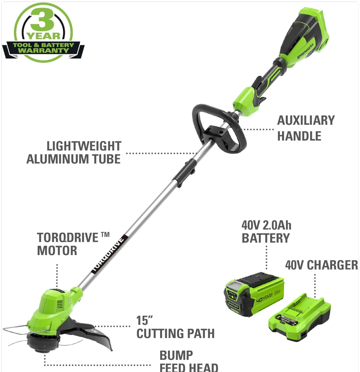
Figure 3.1: Product Components Overview