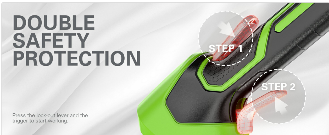
Figure 5.1: Double Safety Protection

To start the trimmer, first press the safety lock-out button located on the handle. While holding the safety button, squeeze the variable speed trigger. The trimmer will begin operating. Release the safety button once the trimmer is running, but continue to hold the trigger to maintain power.