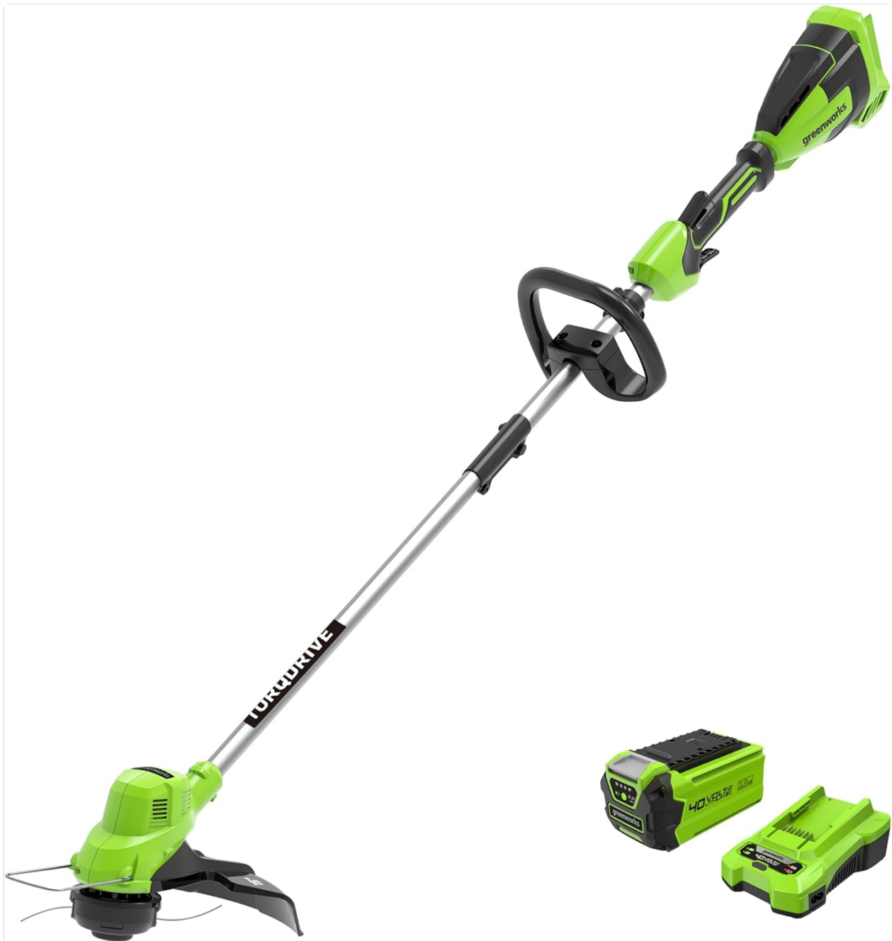
Figure 1.1: Greenworks 40V 15" Cordless String Trimmer