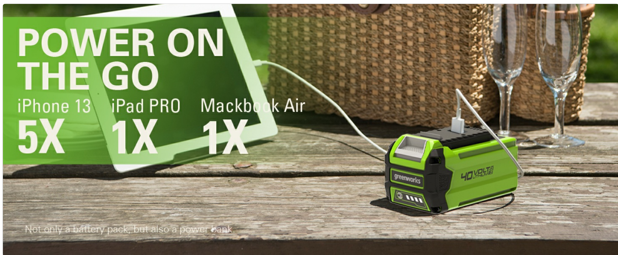
Figure 4.1: Greenworks 40V Battery