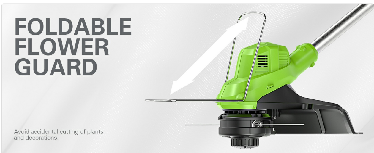
Figure 5.5: Foldable Flower Guard

The trimmer is equipped with a foldable flower guard. This guard can be extended to help prevent accidental cutting of plants, flowers, and other delicate landscaping features.