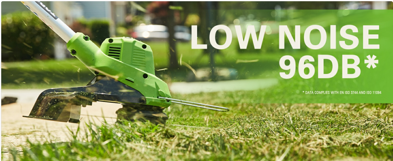
Figure 5.6: Low Noise Operation

The Greenworks 40V trimmer is designed for quiet operation, producing approximately 96dB. This allows for a more comfortable user experience compared to traditional gas-powered trimmers.