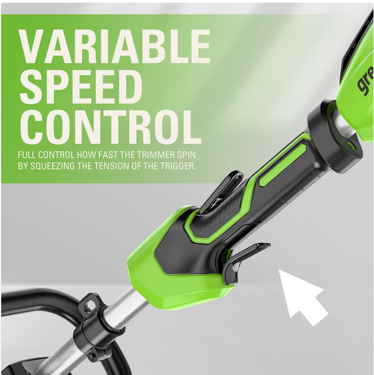
Figure 5.3: Variable Speed Trigger

FULL CONTROL HOW FAST THE TRIMMER SPIN BY SQUEEZING THE TENSION OF THE TRIGGER.