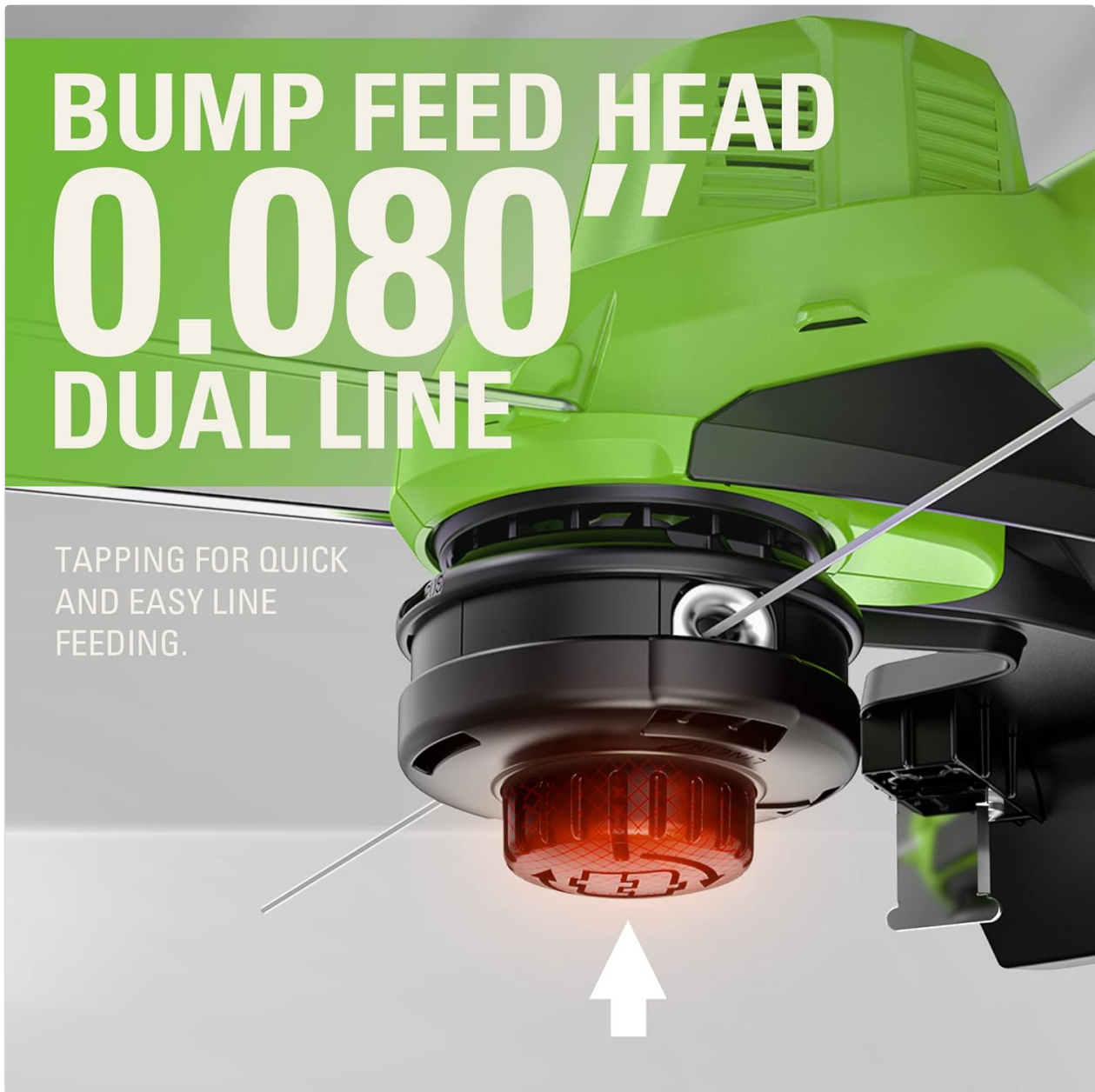
Figure 5.2: Bump Feed Head