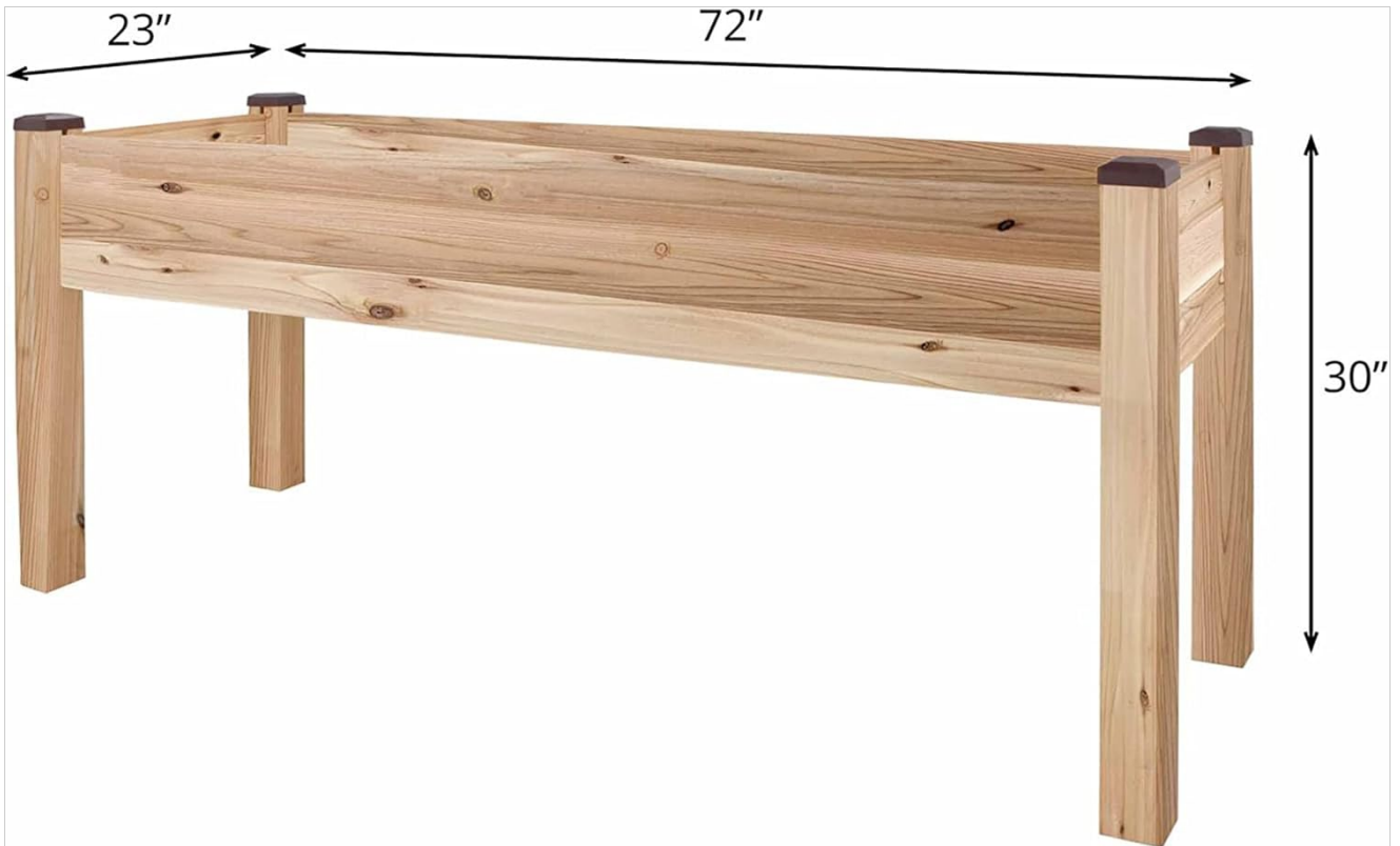
Image: The CedarCraft Elevated Planter displaying its overall dimensions: 23 inches in depth, 72 inches in width, and 30 inches in height.

Elevated design, Dovetail construction, Integrated plastic baseboard system, Weather Resistant