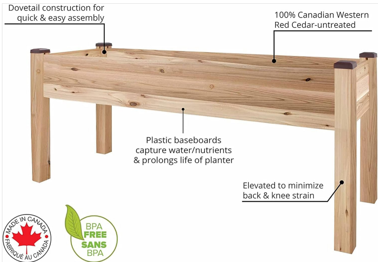
Image: Key features of the CedarCraft Elevated Planter, including dovetail joints for assembly, untreated Western Red Cedar, plastic baseboards for water retention, and its elevated design for ergonomic use.