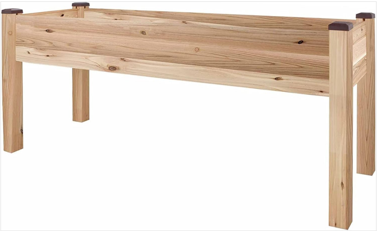
Image: A fully assembled CedarCraft Elevated Planter, showcasing its natural cedar wood finish and sturdy construction.