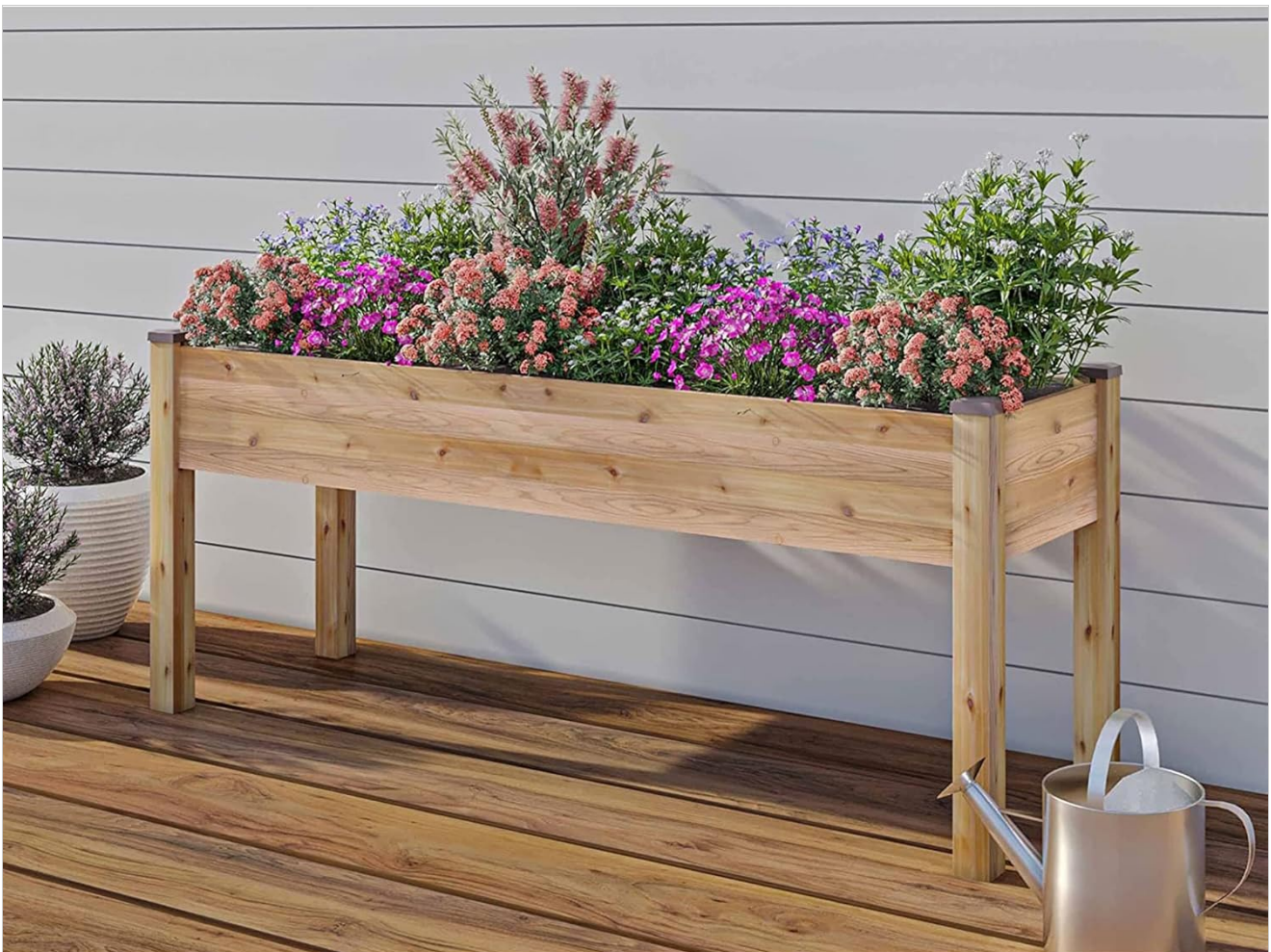
Image: The CedarCraft Elevated Planter in an outdoor setting, showcasing its use for growing a variety of colorful flowers on a patio or deck.