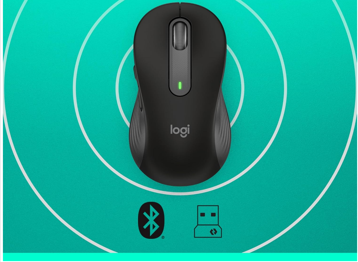
Image: The Logitech M650 mouse with symbols indicating its dual connectivity options: Bluetooth and Logi Bolt USB receiver.