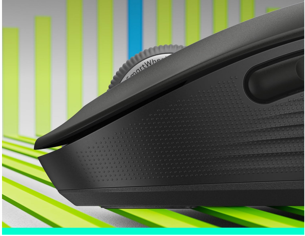
Image: A close-up view of the Logitech M650 mouse, highlighting the SmartWheel designed for both precise and fast scrolling.