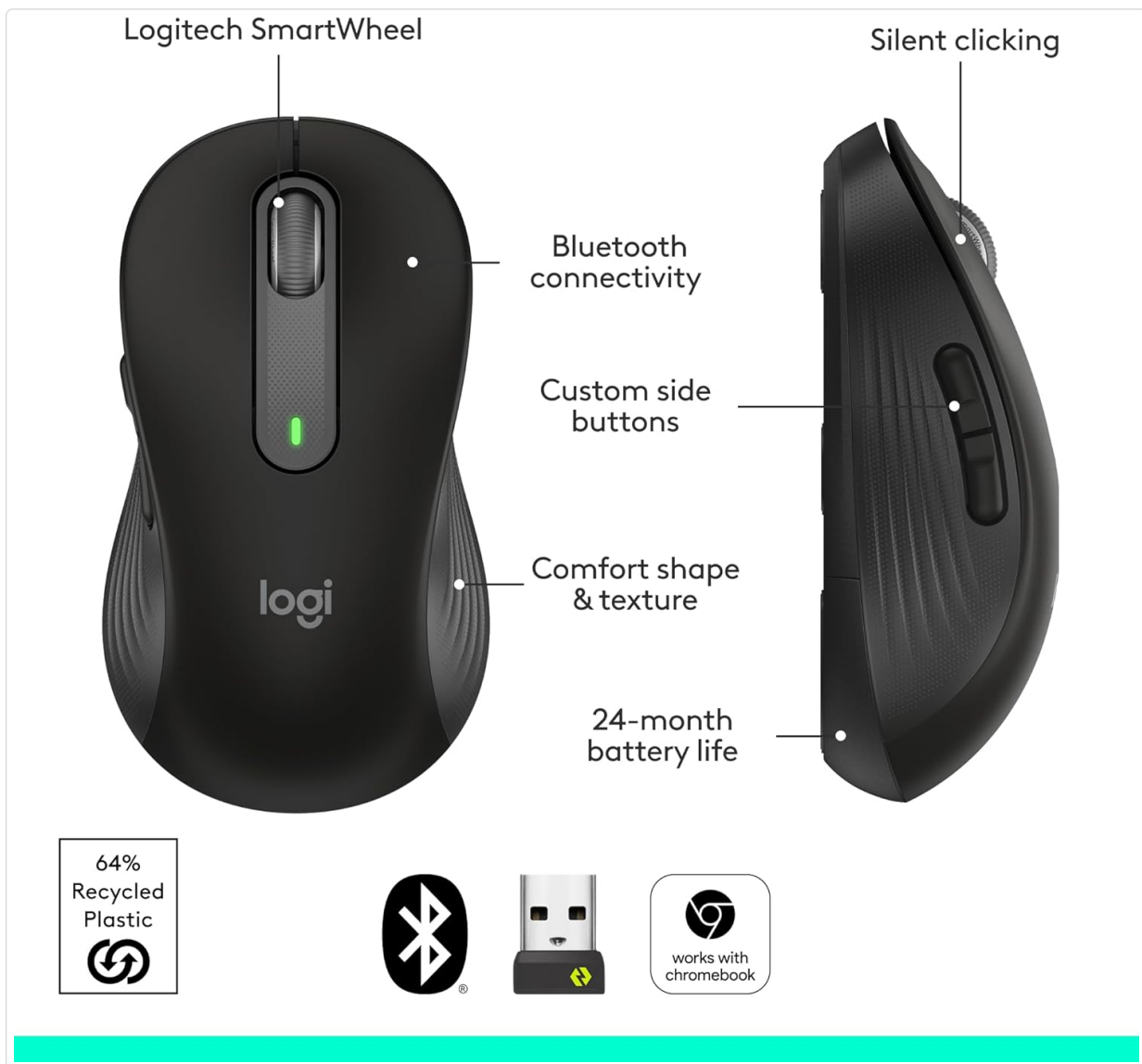
Image: Diagram of the Logitech M650 mouse highlighting its key features and components, including the battery compartment.