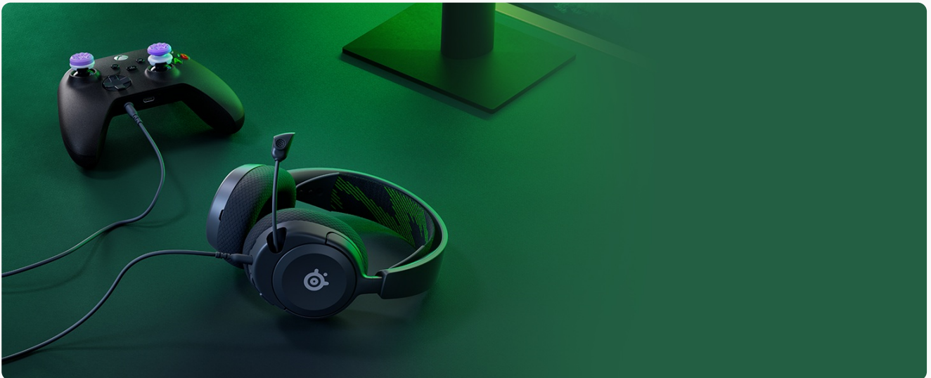
Image: The Arctis Nova 1X headset highlighting its "Almighty Audio" capabilities for a rich sound experience.