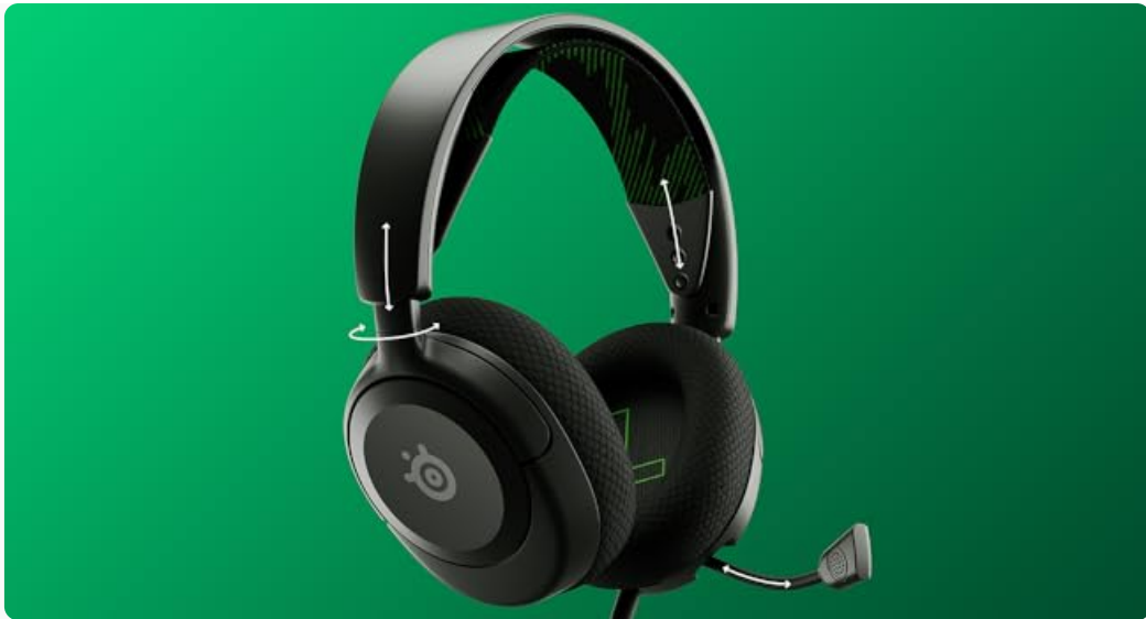
Image: The Arctis Nova 1X headset demonstrating its height-adjustable earcups for a personalized and comfortable fit.