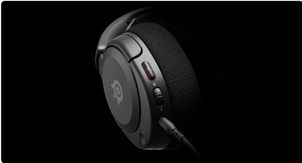
Image: Close-up view of the left earcup of the Arctis Nova 1X, highlighting the volume wheel and microphone mute button for easy access during gameplay.

Your browser does not support the video tag.