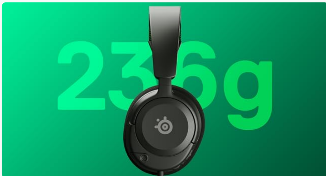
Image: The Arctis Nova 1X headset highlighting its ultra-lightweight and slim profile, designed for comfort.