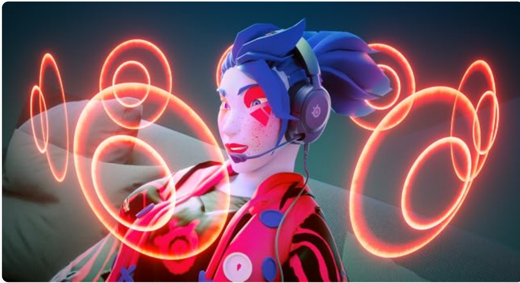
Image: Visual representation of 360° Spatial Audio, showing sound waves surrounding a gamer wearing the Arctis Nova 1X headset.