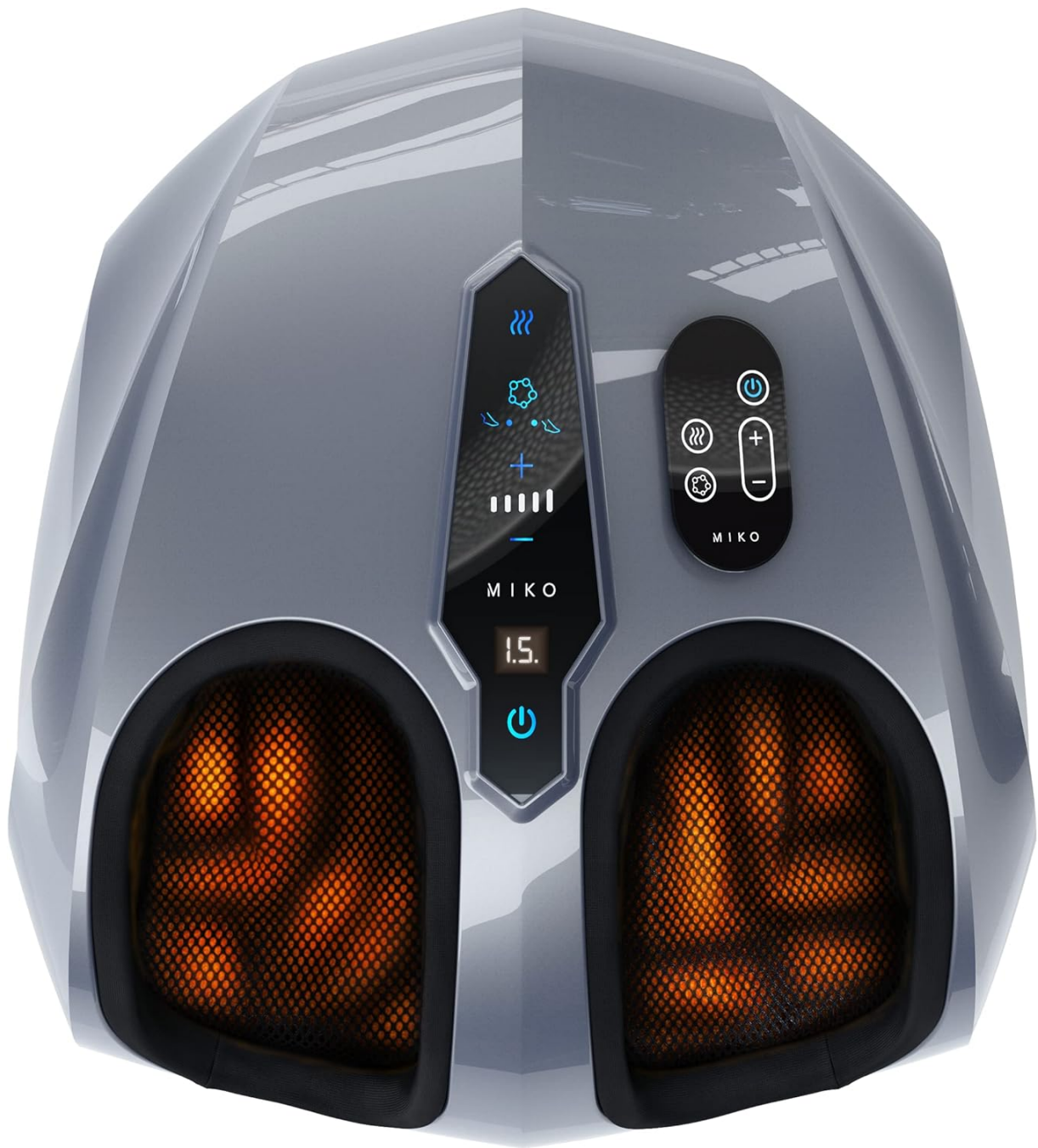
Figure 1: MIKO Foot Massager Machine (Model MMF-01C-2)