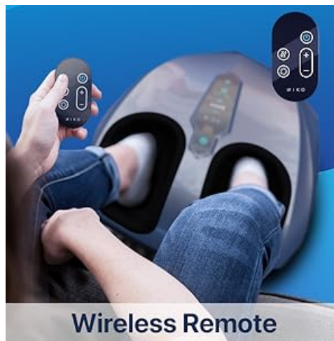
Figure 6: Wireless Remote Control