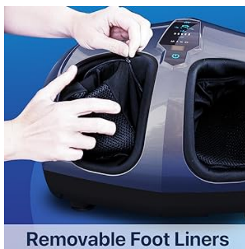
Figure 7: Removable Foot Liners