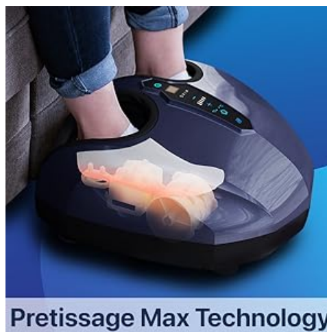
Figure 5: Petrissage Max Technology