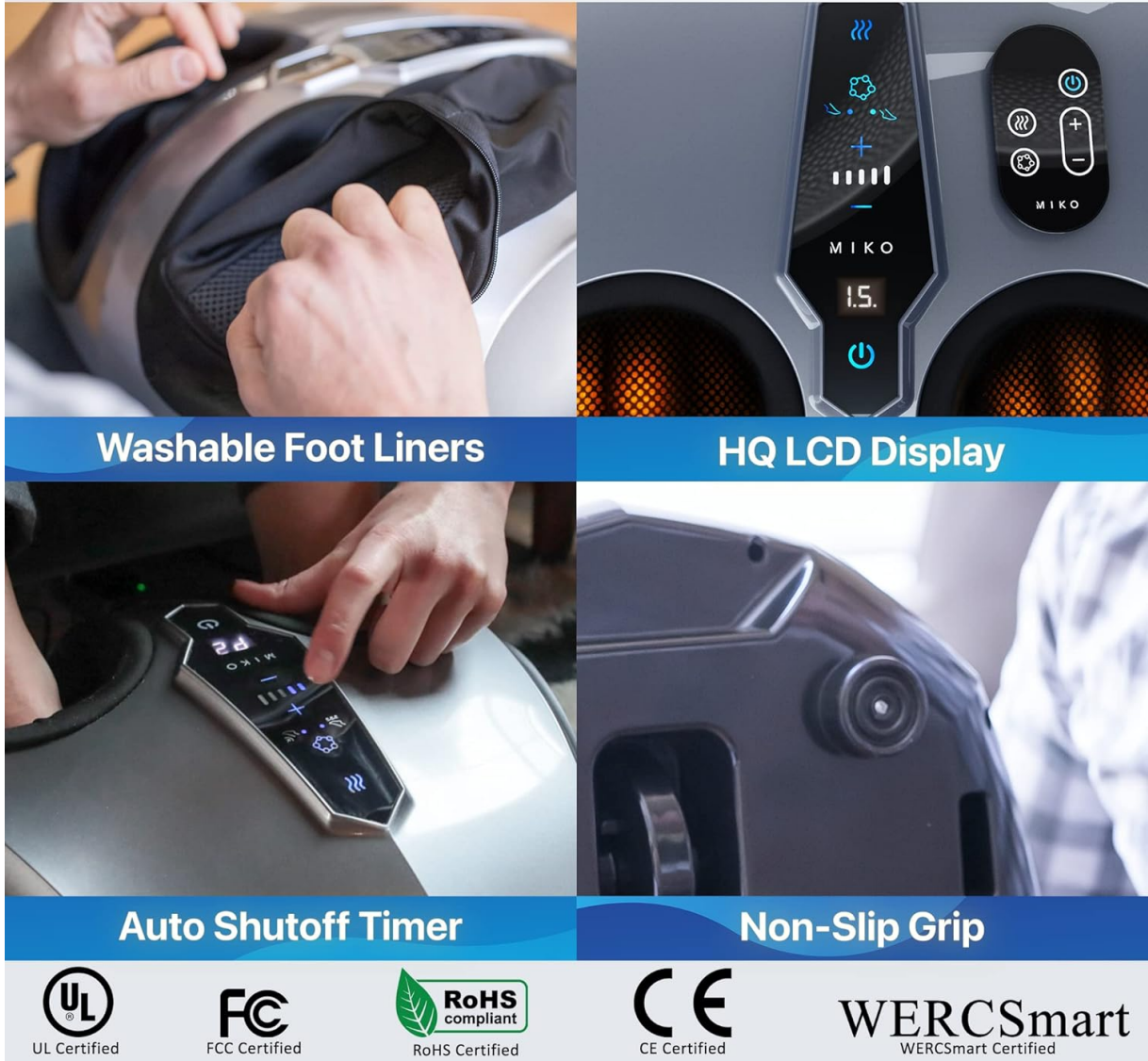
Figure 3: Quality Features (Washable Liners, LCD, Non-Slip)