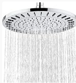
Figure 3: Visual Guide for Shower Head Installation

Your browser does not support the video tag.