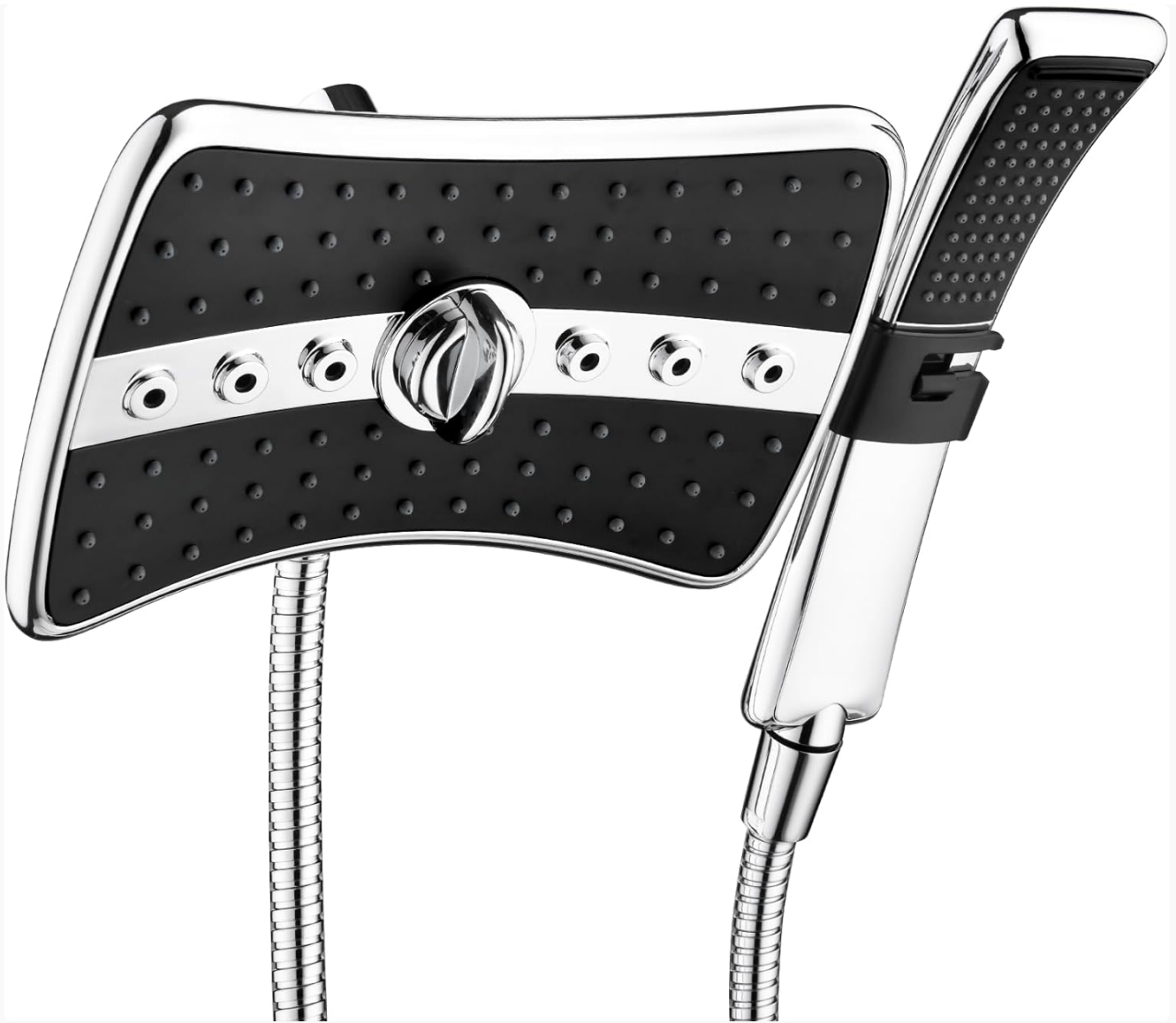
Figure 1: BRIGHT SHOWERS Dual Shower Head Combo