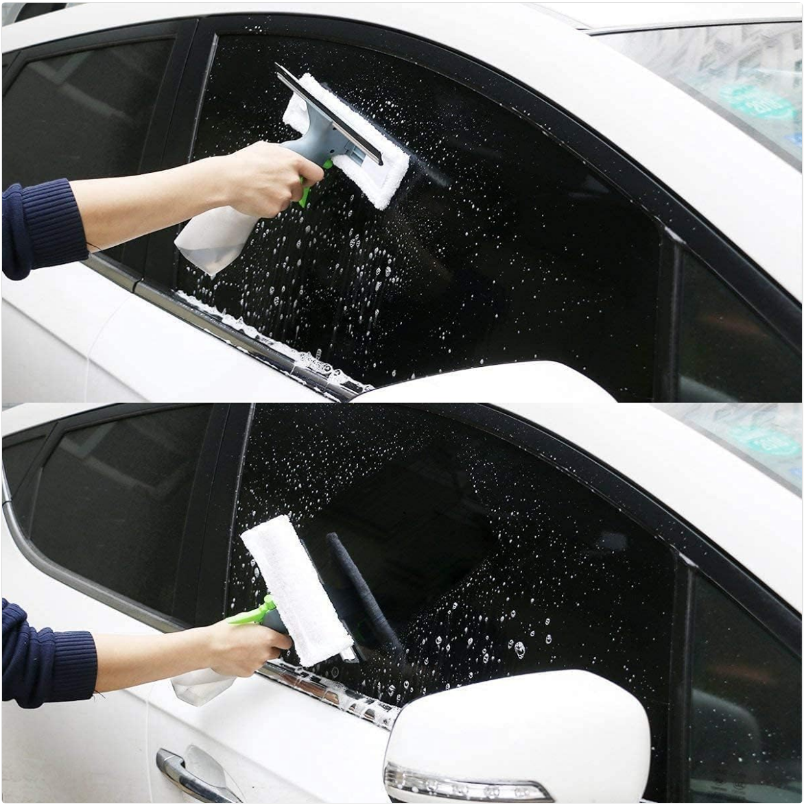
Image: The Hozzwho 3-in-1 Window Cleaner Squeegee in action, scrubbing a car window with its microfiber pad to remove dirt.