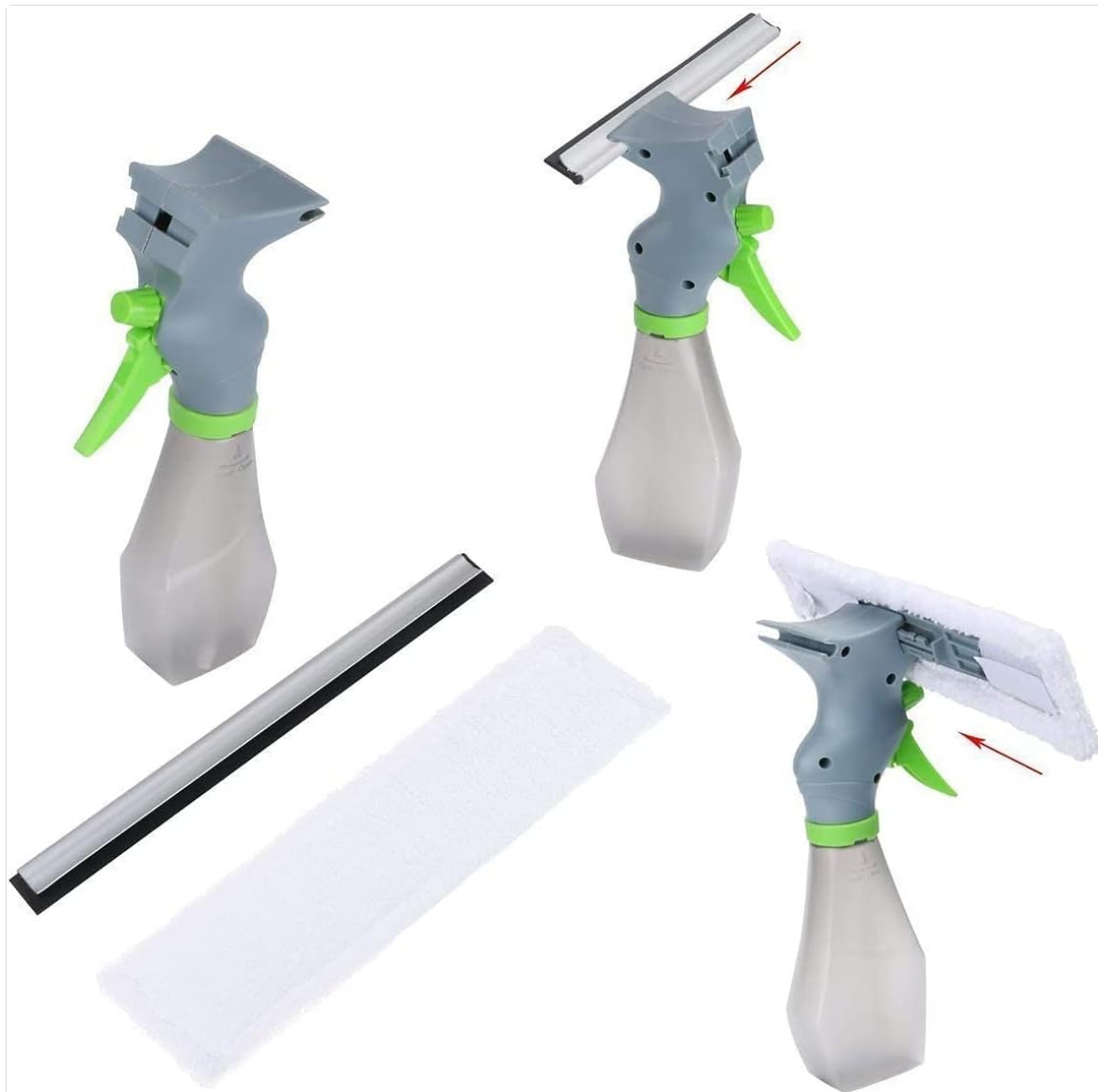
Image: Visual guide for assembling the Hozzwhoo 3-in-1 Window Cleaner Squeegee, demonstrating the attachment of the microfiber pad and the filling of the spray bottle.