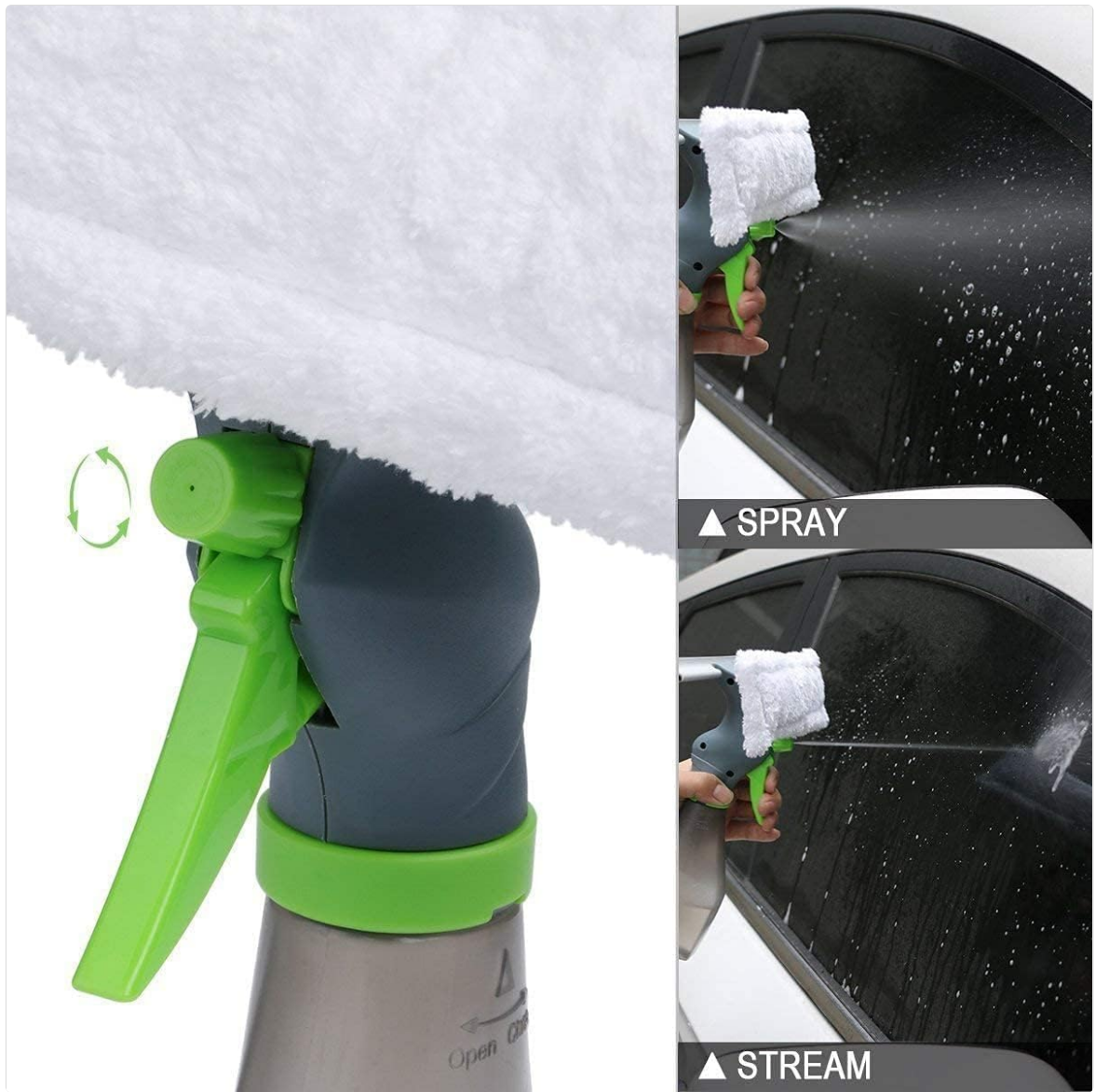
Image: A hand holding the Hozzwhoo 3-in-1 Window Cleaner Squeegee, demonstrating the spray function on a window.