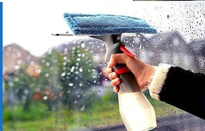
Image: A visual step-by-step guide illustrating the three functions: spray, clean with the microfiber, and scrape dry with the squeegee.

After cleaning the glass, scrape the Water stains on the glass, The glass will bright as new. The scrap strip is made from natural rubber material with excellent watertight , resilient, and very good wiper effect