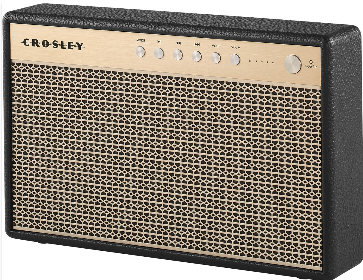
Figure 1: Front view of the Crosley Montero speaker, showing the speaker grille and control panel.