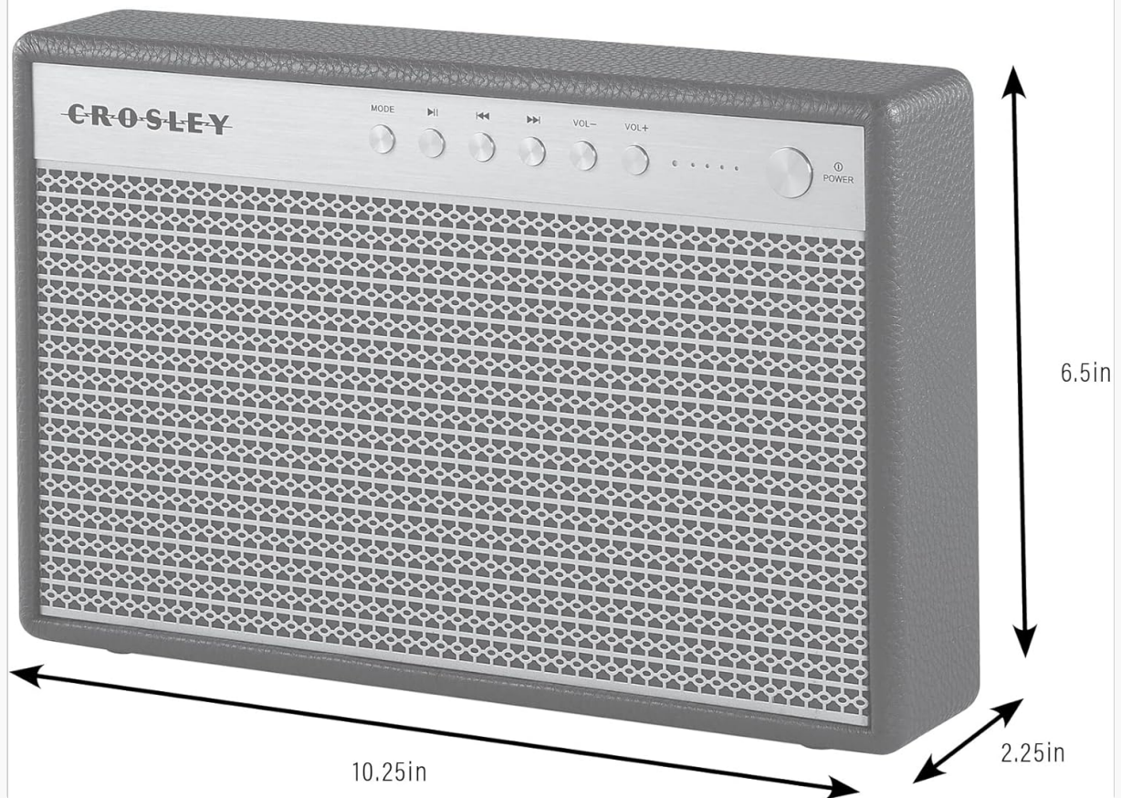
Figure 3: Overall dimensions of the Crosley Montero speaker: 10.25" W x 6.5" H x 2.25" D.

OVERALL DIMENSIONS: 10.25" W x 6.5" H x 2.25" D