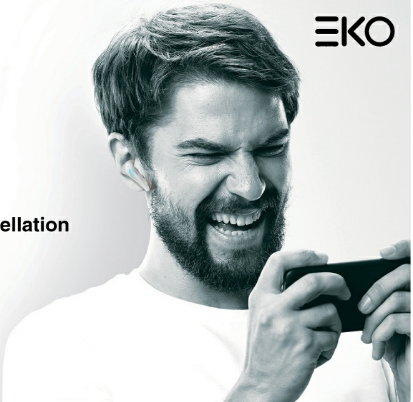
Image: A visual explanation of Active Noise Cancellation (ANC) for clear call performance and Environmental Noise Cancellation (ENC) for clear voice communication during gaming.

Through the dual microphone array, the game players can have more free voice communication