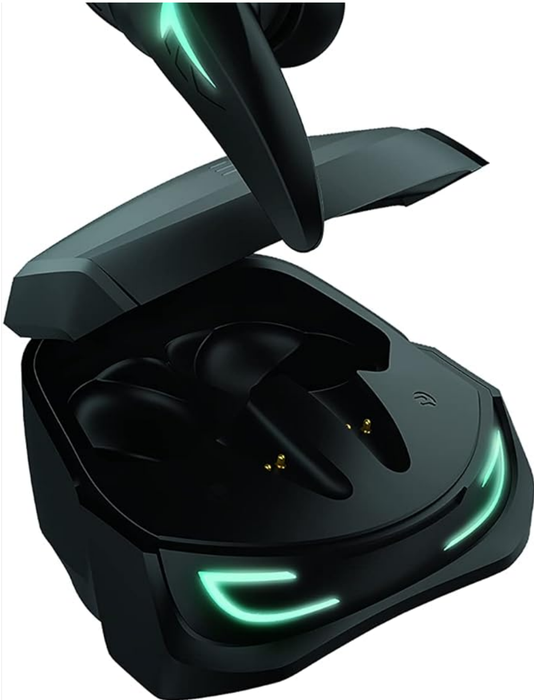
Image: EKO Wireless In-Ear Earbuds, showcasing both earbuds and their charging case. The earbuds feature a sleek black design with illuminated accents.