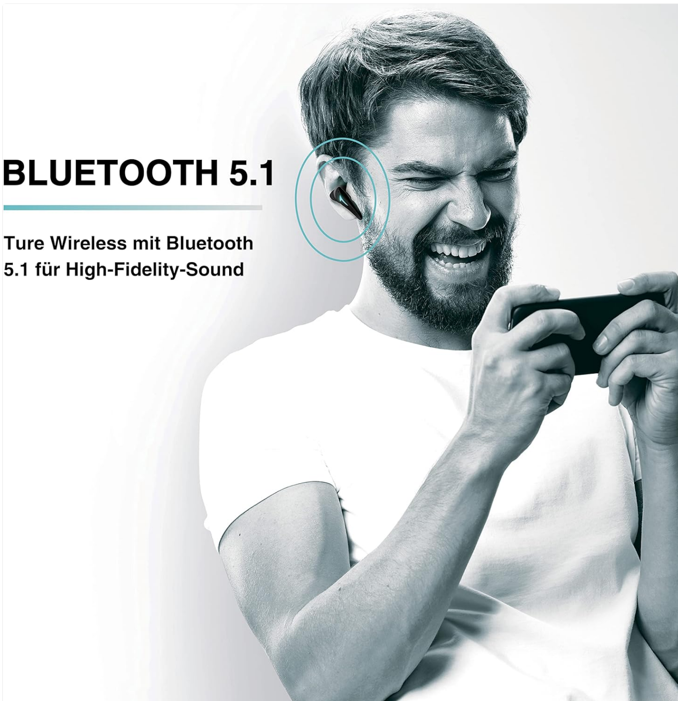
Image: A person smiling while wearing the EKO earbuds and holding a smartphone, illustrating seamless Bluetooth 5.1 connectivity for high-fidelity sound.

Ture Wireless mit Bluetooth 5.1 für High-Fidelity-Sound