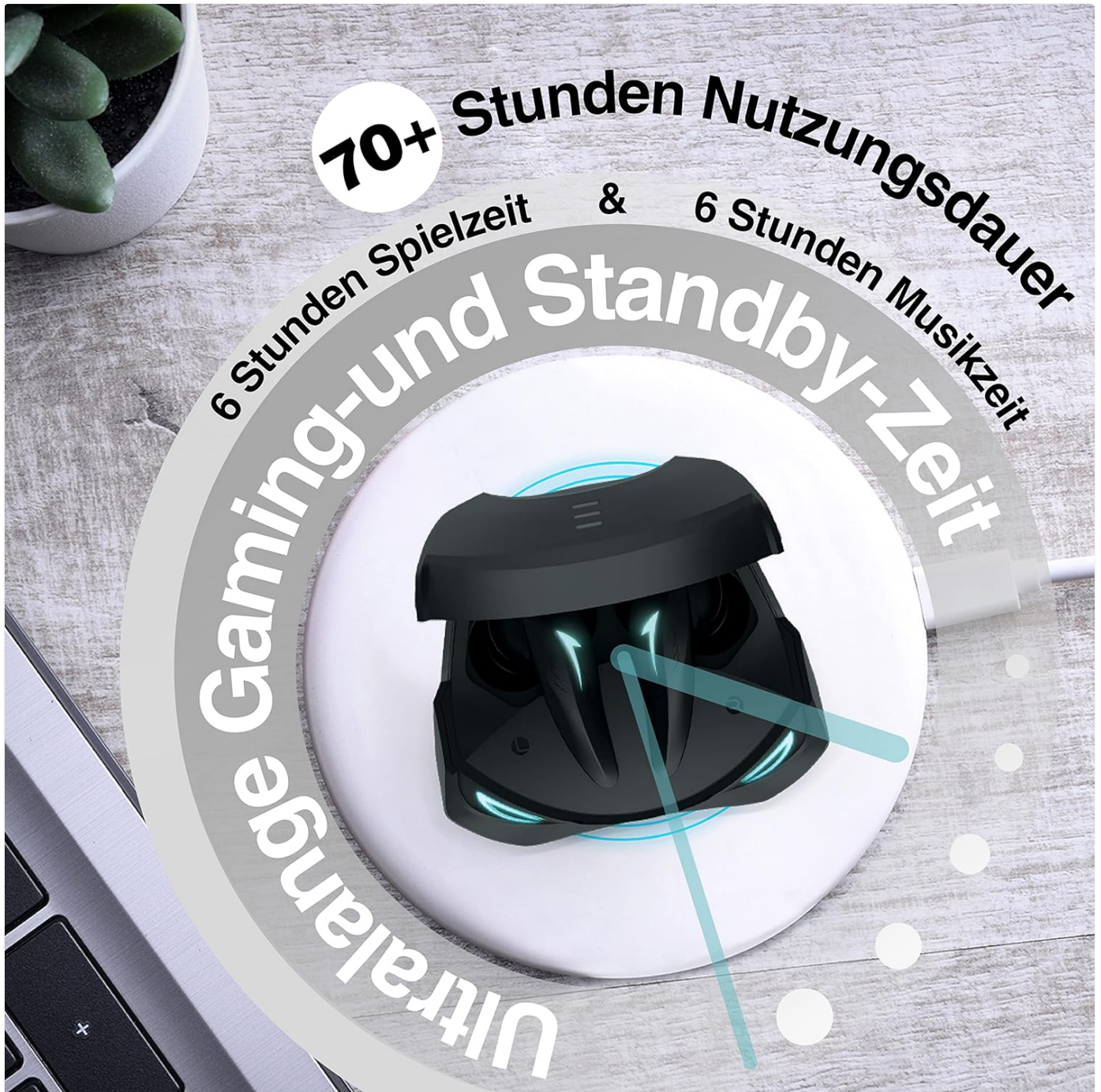
Image: The EKO charging case placed on a wireless charging pad, illustrating its wireless charging capability. The image also highlights the long battery life of 70+ hours with the case.

earbuds will charge automatically when placed inside the case.