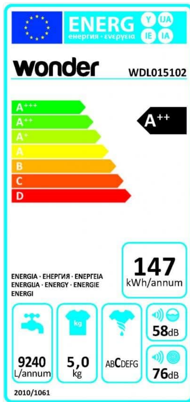
Figure 3.4: The previous energy efficiency label (A++ rating) for the SVAN Wonder washing machine, showing 147 kWh/annum and 9240 L/annum water consumption.