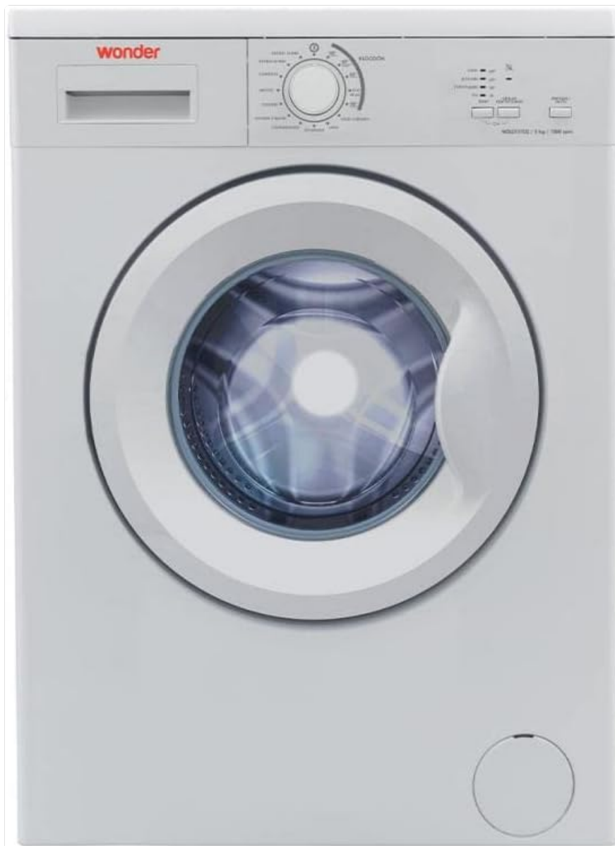
Figure 3.1: Front view of the SVAN Wonder 5kg Washing Machine, showing the control panel, detergent drawer, and transparent door.