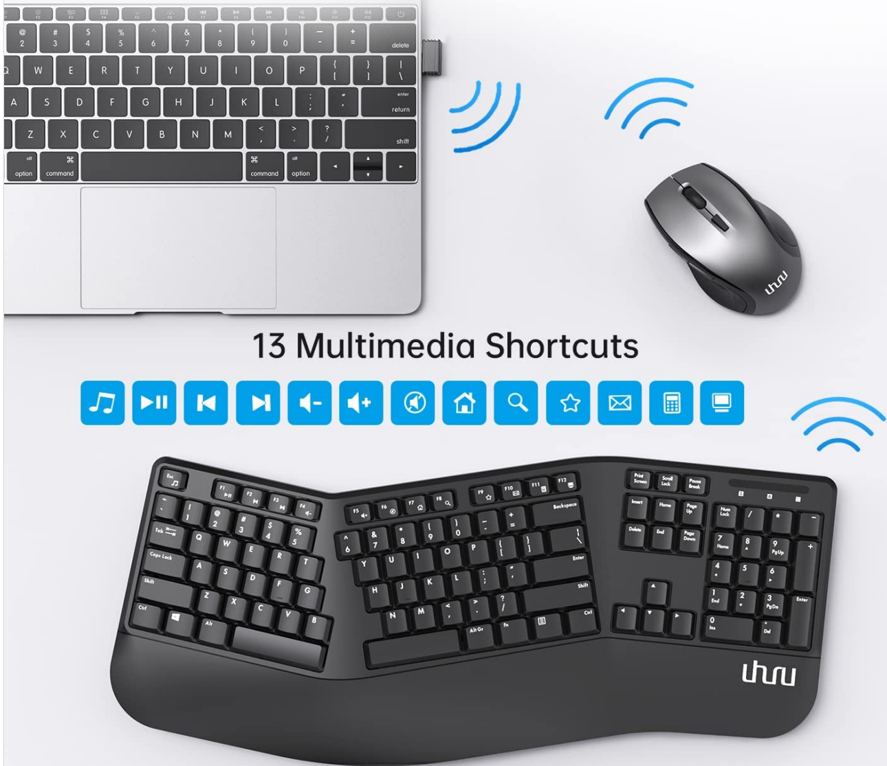
Image: The ergonomic keyboard displaying its multimedia shortcut keys and illustrating the reliable 2.4G wireless connection to a laptop.