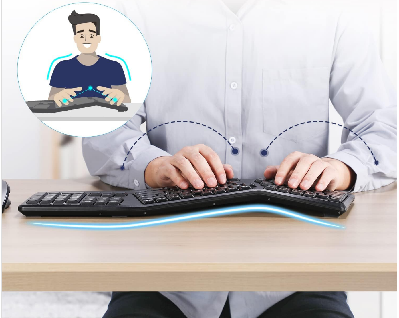
Image: A side view of a user typing on the ergonomic keyboard, demonstrating the natural wrist and forearm alignment that reduces muscle strain.

Reduces Muscle Strain on Your Wrists and Forearms