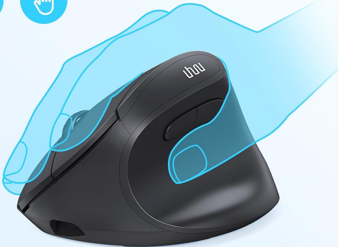
Image: The ergonomic mouse highlighting its adjustable DPI settings (800, 1200, 1600) and its comfortable design for hand placement.