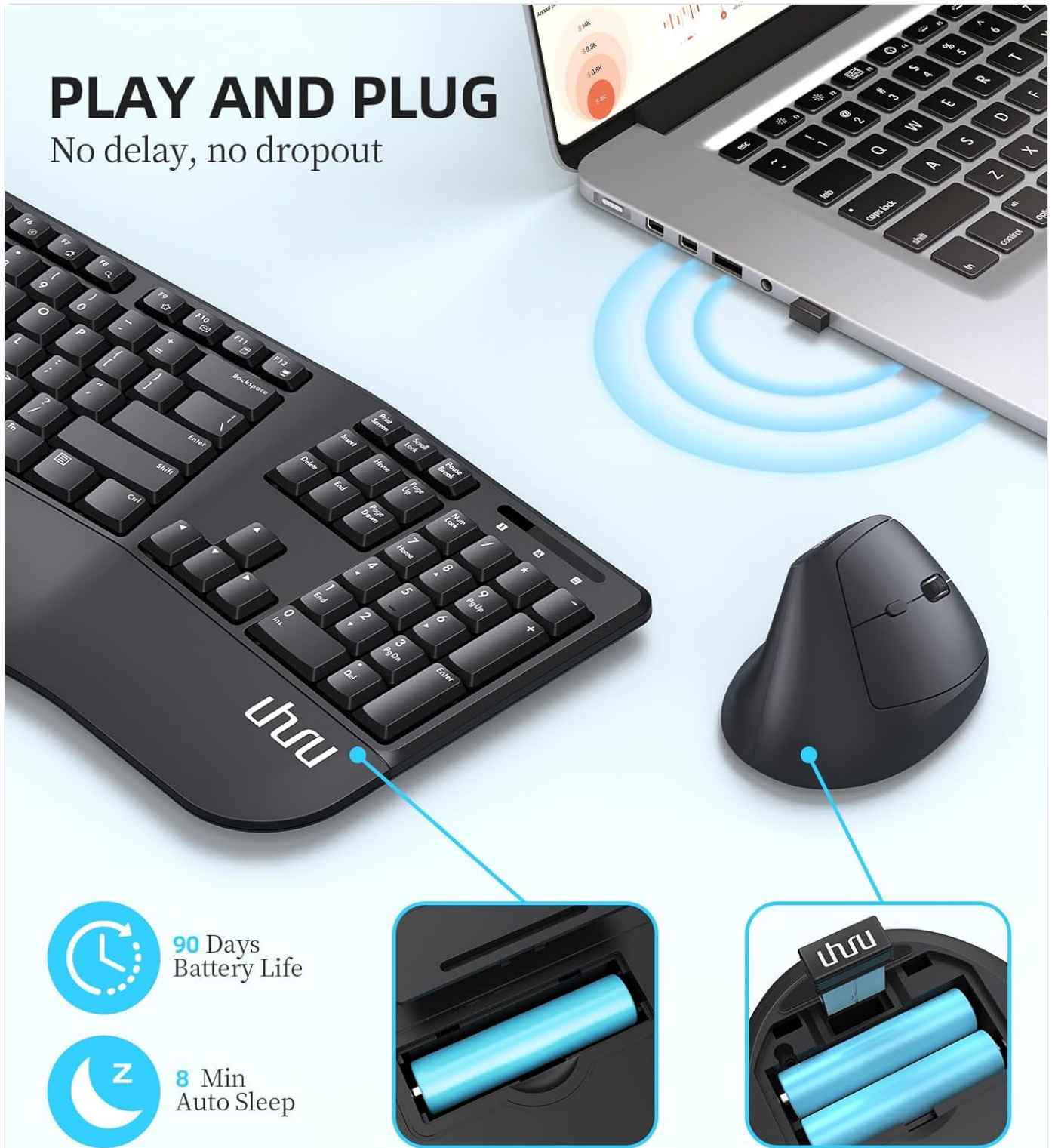
Image: Illustrations showing the battery compartments for both the keyboard (AA batteries) and the mouse (AAA batteries), along with the location of the 2-in-1 USB Nano receiver.