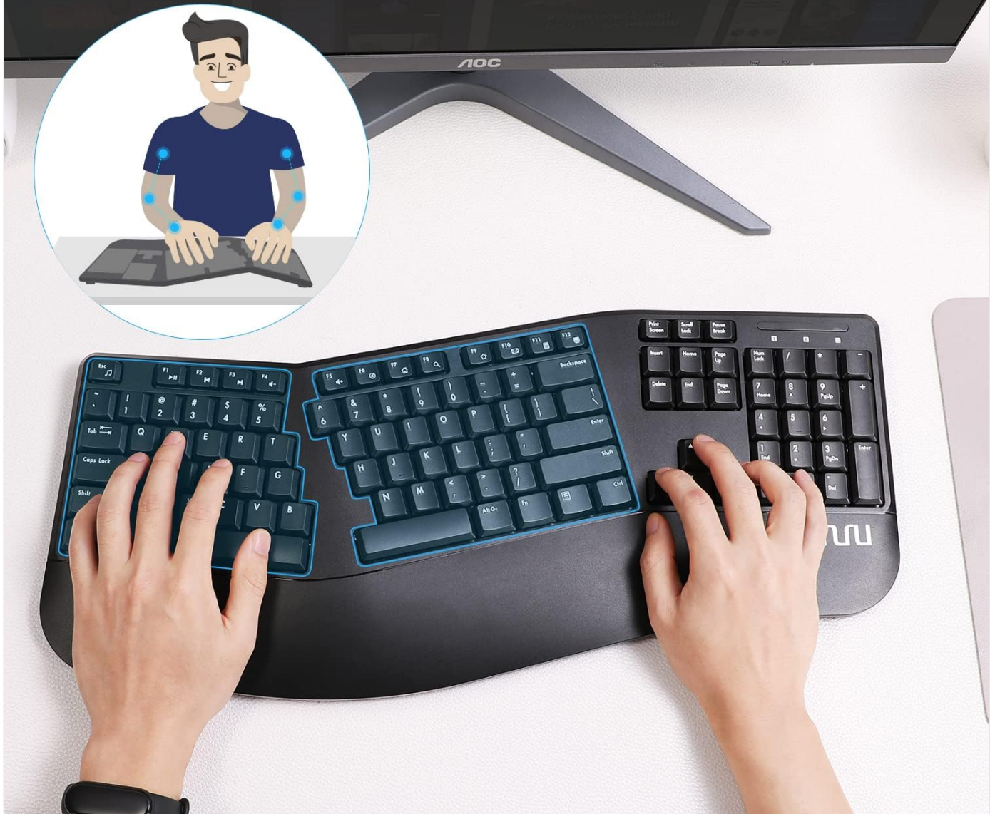
Image: A user's hands positioned on the split ergonomic keyboard, illustrating how the design promotes a natural and comfortable typing experience by allowing wrists to remain straight.

Promotes a natural and comfortable typing experience