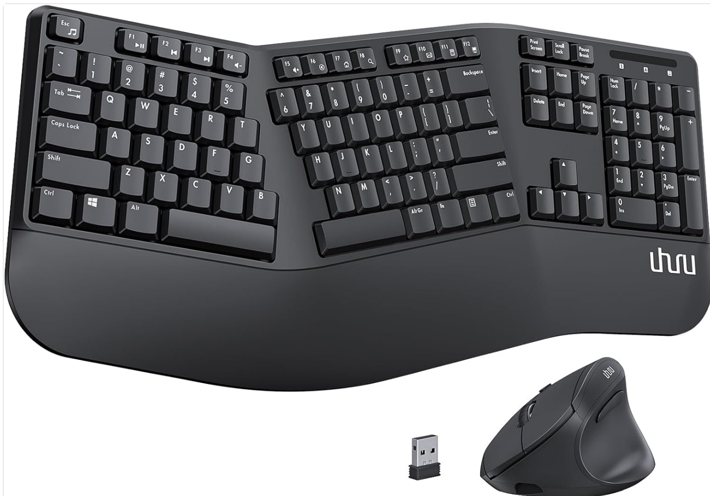
Image: The UHURU UEKM-20 Ergonomic Wireless Keyboard and Mouse Combo, featuring the split keyboard design, integrated palm rest, and the ergonomic vertical mouse, alongside the 2.4G USB receiver.

Thank you for choosing the UHURU UEKM-20 Ergonomic Wireless Keyboard and Mouse Combo. This product is designed to provide a natural and comfortable typing and navigation experience, reducing strain and fatigue during extended use. Its advanced ergonomic features promote a healthier posture for your wrists and forearms.