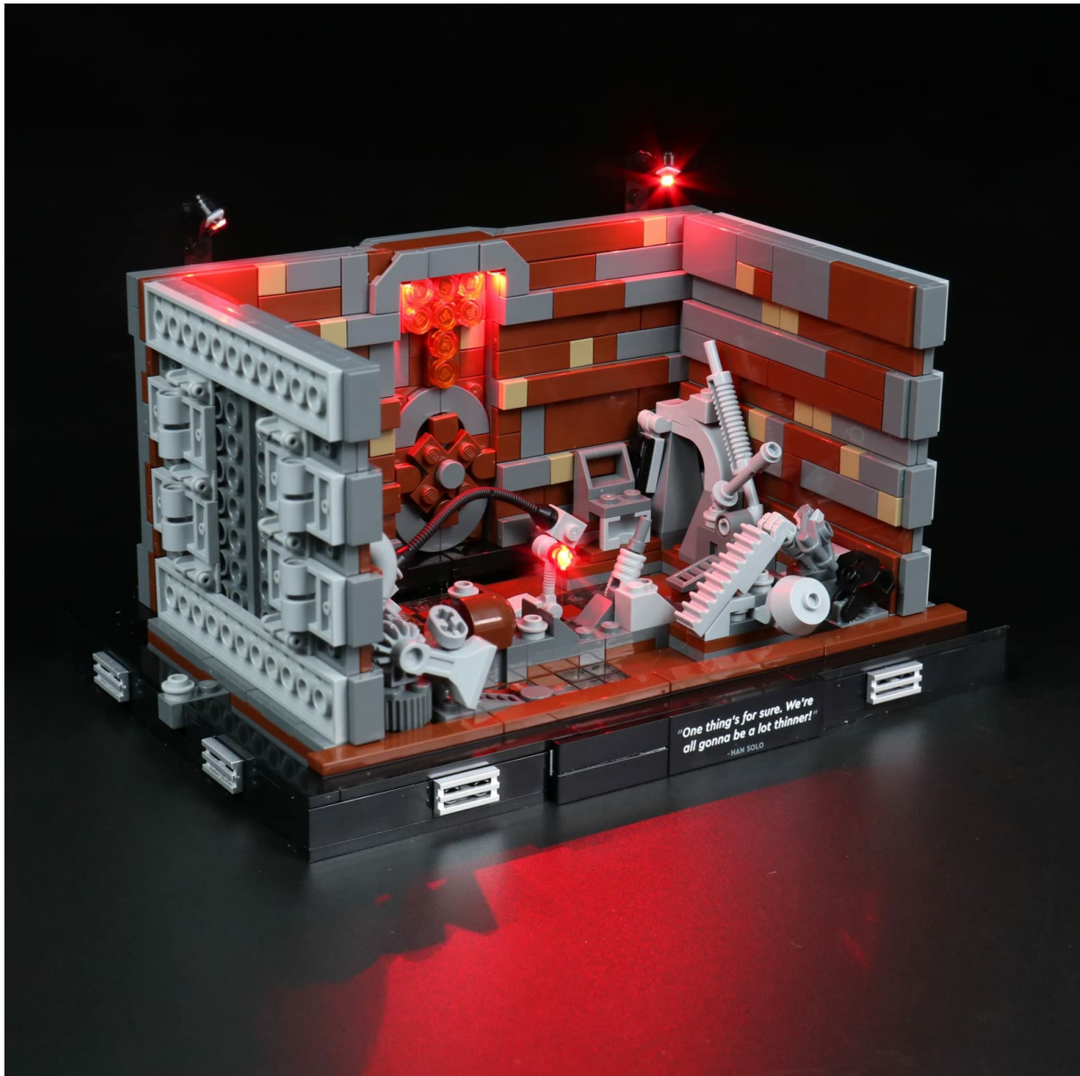
Image: The BrickBling LED Light Kit installed on the Lego Death Star Trash Compactor model, showcasing the red lights illuminating the intricate details of the scene.

For detailed visual instructions, please refer to the online manual accessible via the QR code or link provided in your package.