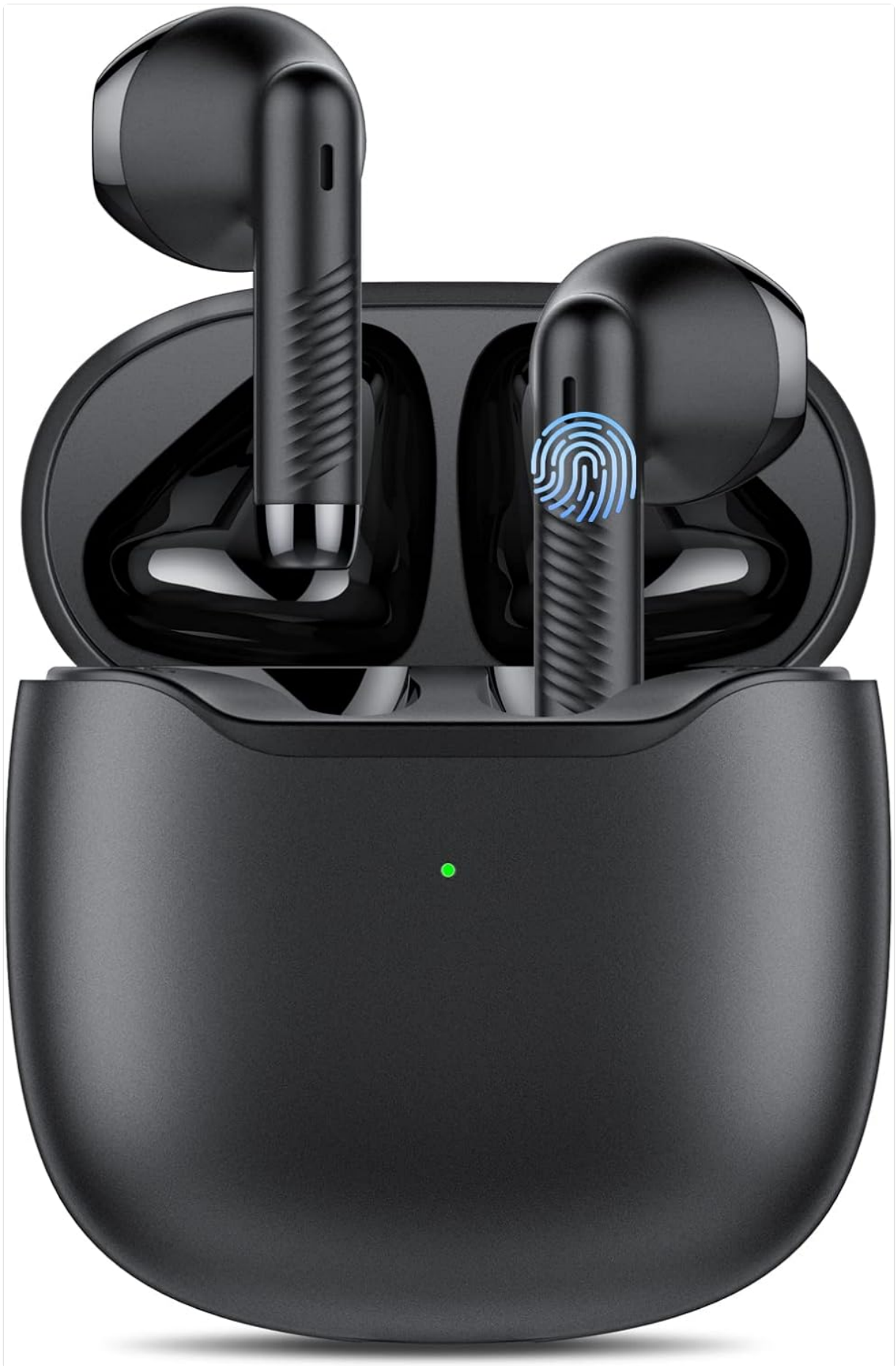
Figure 1: FAMOO S22 Wireless Earbuds in their charging case.

This image displays the FAMOO S22 wireless earbuds securely placed within their compact charging case. The earbuds are black with a sleek design, and the case is also black, indicating a ready-to-use or charging state with a small green indicator light visible.