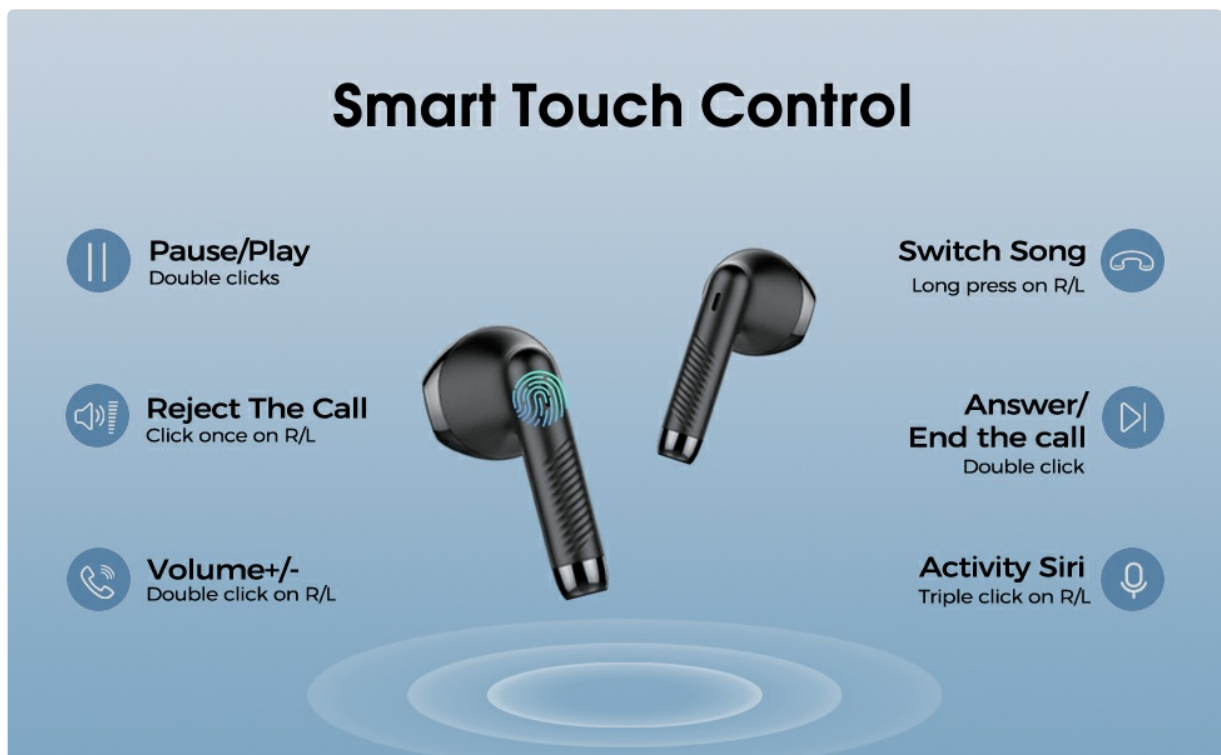
Figure 4: Overview of touch control functions.

This diagram illustrates the various touch control functions available on the earbuds. It shows how to perform actions such as Pause/Play (double clicks), Switch Song (long press on R/L earbud), Reject Call (click once on R/L), Answer/End Call (double click), Volume +/- (double click on R/L), and Activate Siri (triple click on R/L).