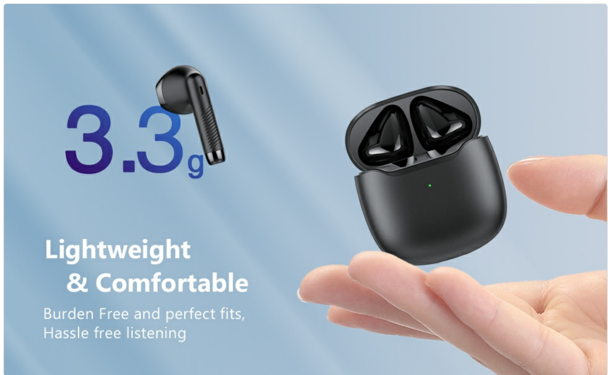
Figure 2: Illustrating the lightweight and comfortable design of the earbuds.

This image highlights the lightweight nature of the earbuds, showing a hand holding the small charging case with one earbud appearing to float above it, emphasizing its minimal weight of 3.3g. The text "Lightweight & Comfortable" reinforces this feature.