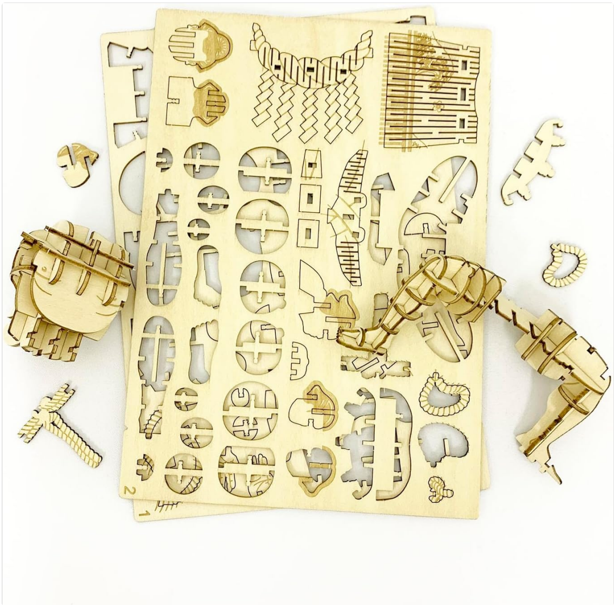
Image Description: This image shows two wooden sheets with numerous laser-cut puzzle pieces. Some pieces are still embedded, while others have been removed and partially assembled, demonstrating the interlocking nature of the components.