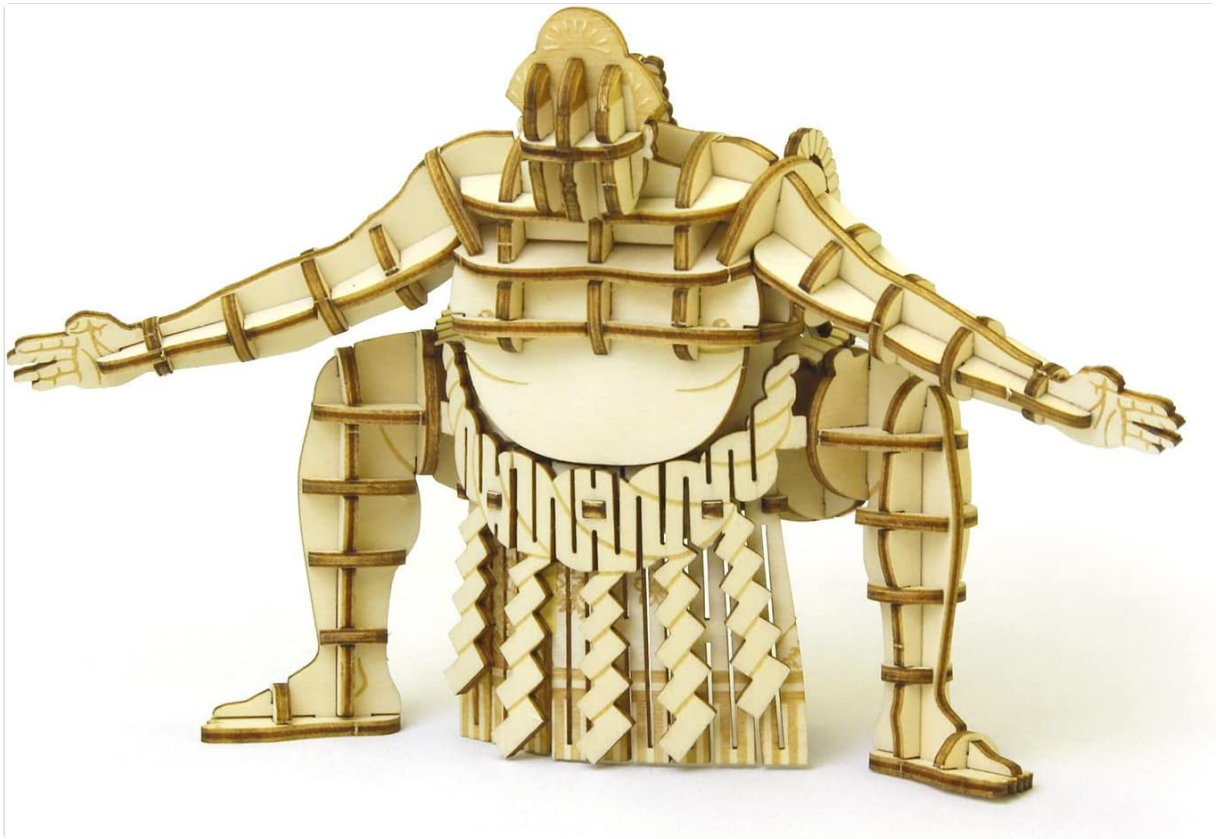
Image Description: A front view of the fully assembled wa-gu-mi Yokozuna Shiranui wooden 3D puzzle. The model depicts a sumo wrestler in a traditional stance, showcasing the intricate details and interlocking wooden construction.