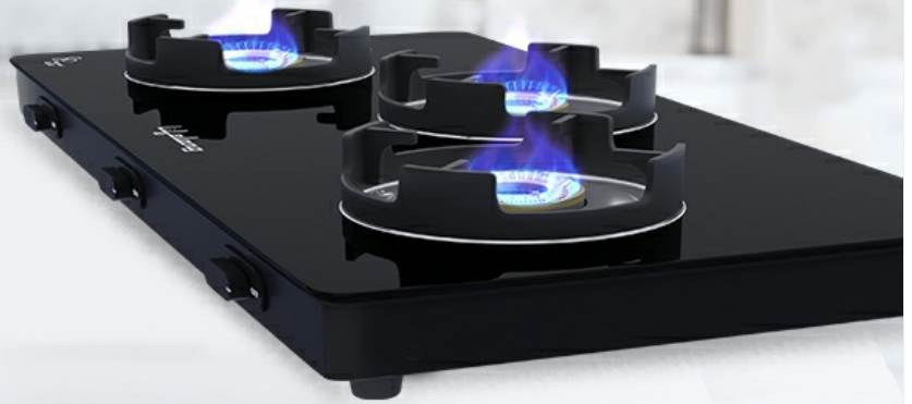
Image: Close-up view of the power-coated pan supports and the elegant control knob for smooth operation.