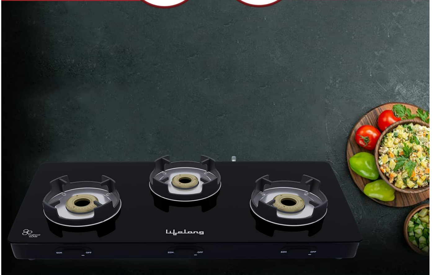
Image: Lifelong LLGS50 Acer 3 Burner Gas Stove, showcasing its sleek design and three burners.