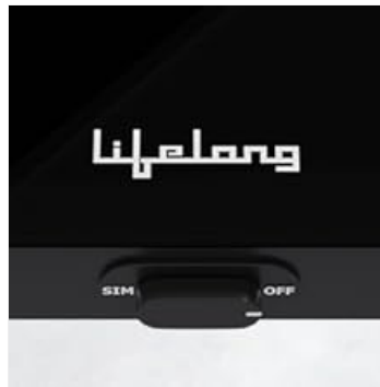
Image: A close-up of the control knob, showing 'SIM' (Simmer) and 'OFF' markings for flame control.