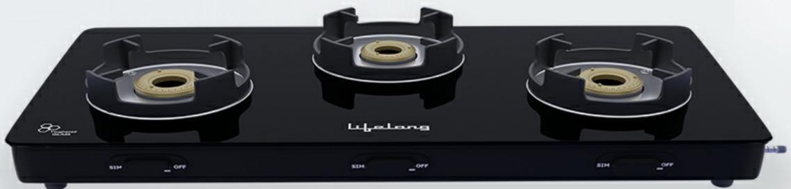
Image: Detailed view highlighting the sturdy rubber legs, toughened glass cooktop, and high-efficiency burners.

Designed to make cooking convenient, efficient and safe.