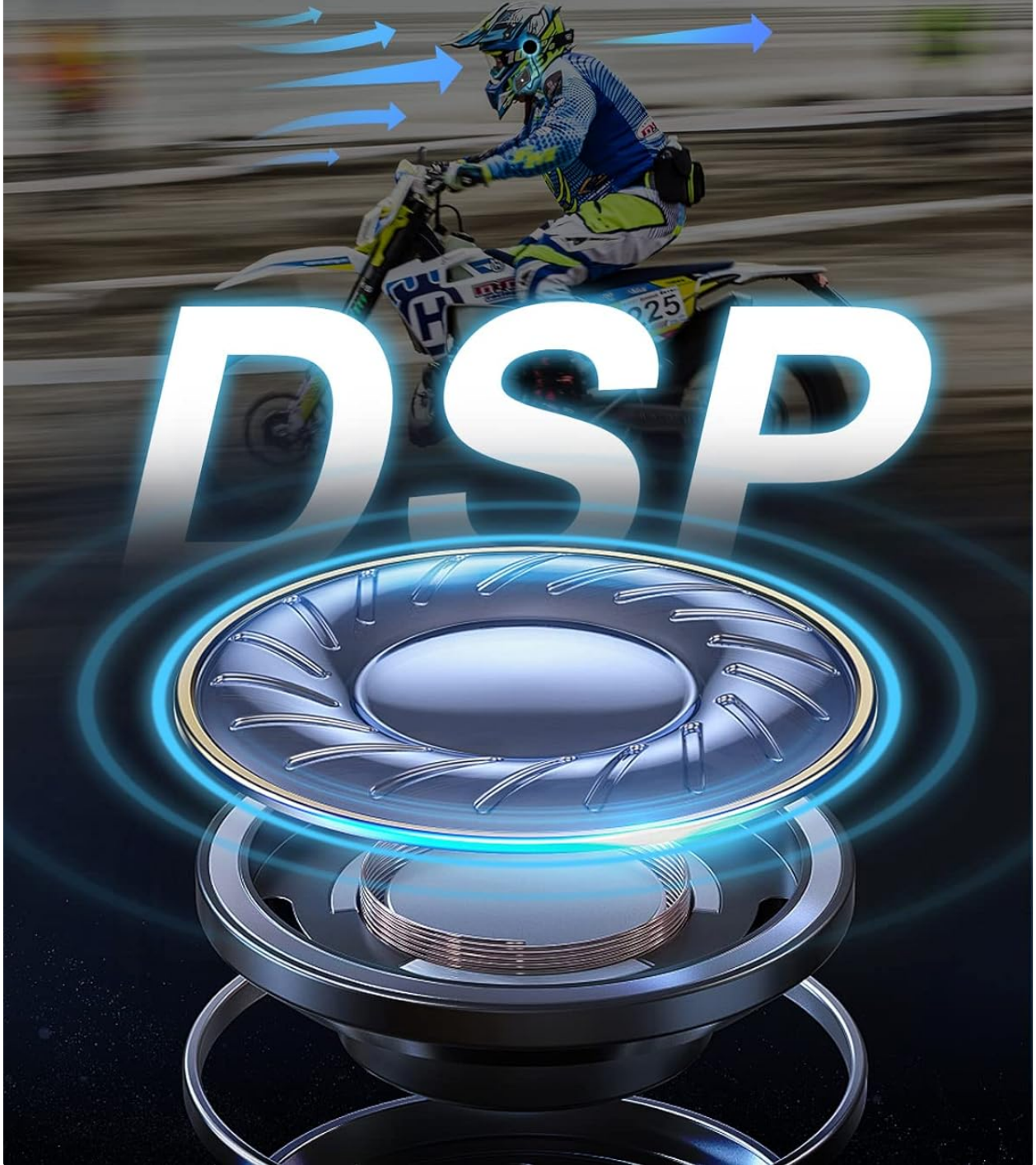
Image: A visual representation of the Moman H1 headset's HD speakers and DSP noise suppression technology, designed for clear audio.

H1 wireless motorcycle headsets include HD 40mm stereo speakers for excellent sound quality on music and calls.