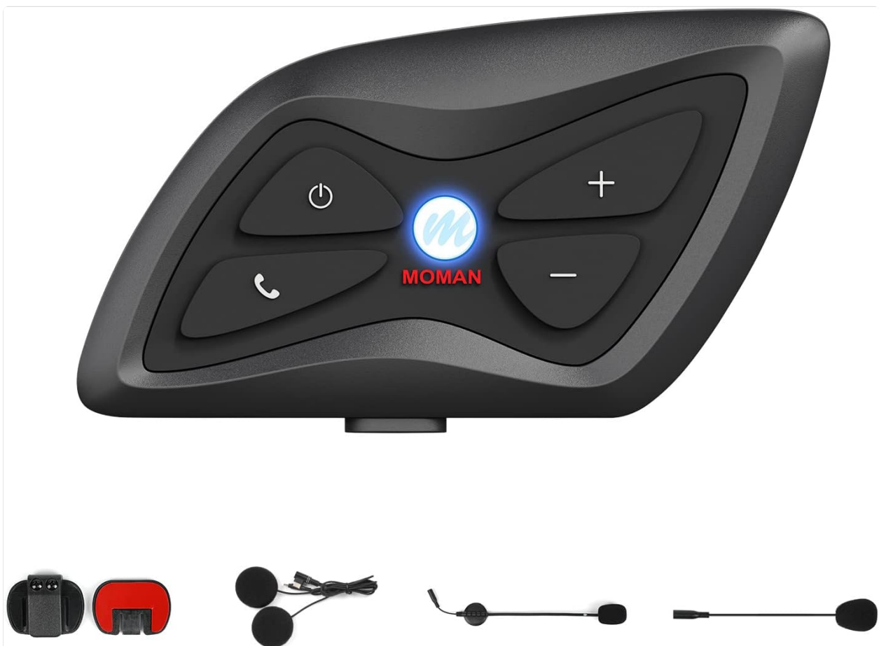
Image: The Moman H1 intercom unit displayed with its various components, including the mounting clip, speakers, and microphones, illustrating the parts involved in installation.