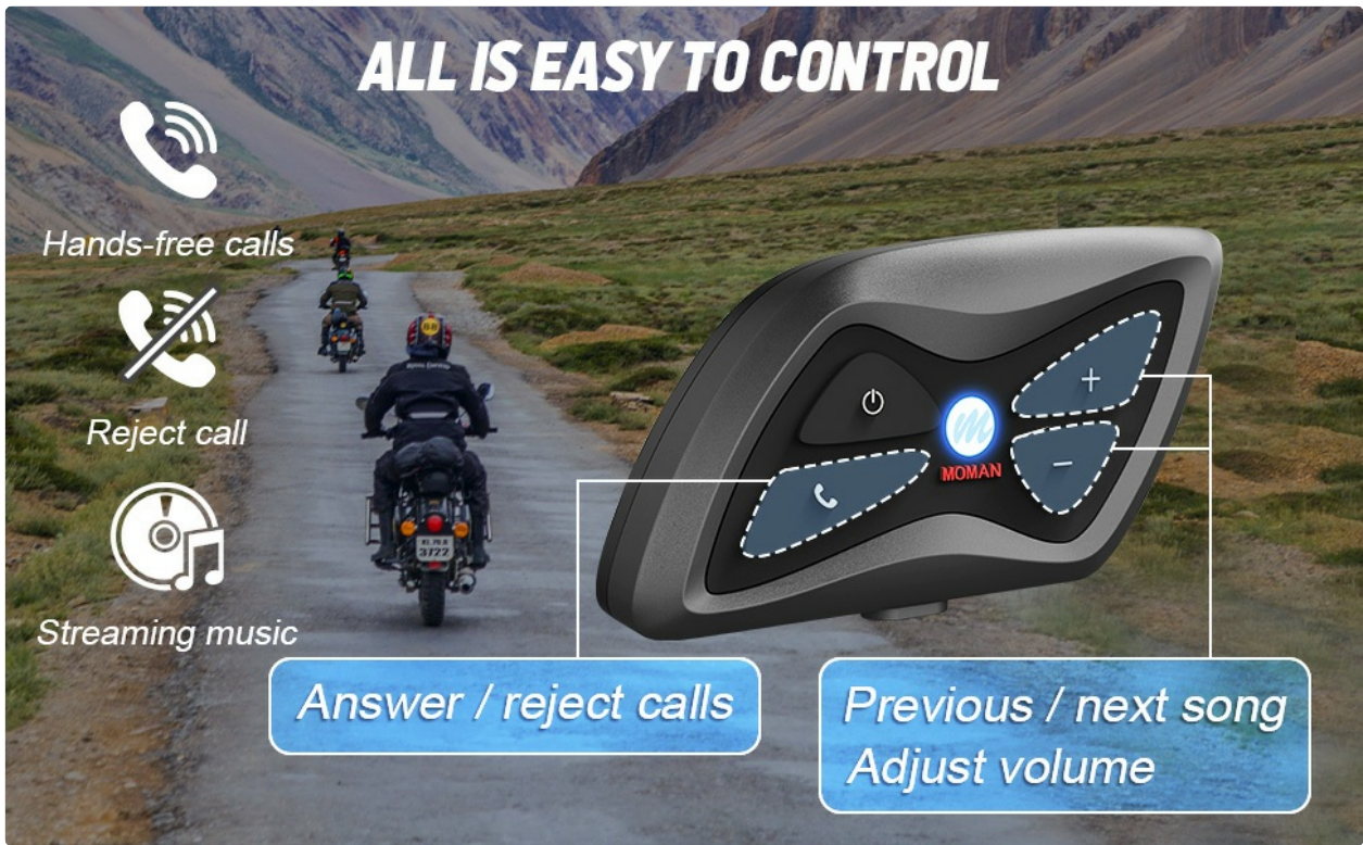
Image: The Moman H1 headset control panel, showing the power, phone, volume up, volume down, and Moman (center) buttons, with visual cues for call management and music control.