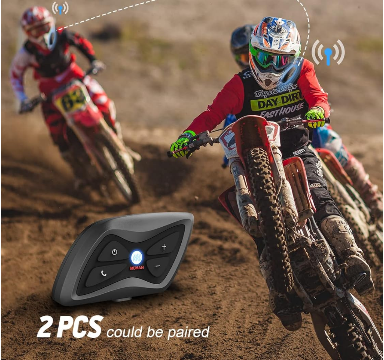
Image: The Moman H1 headset mounted on a helmet, illustrating its 1500-meter long-range intercom capability for communication between riders.