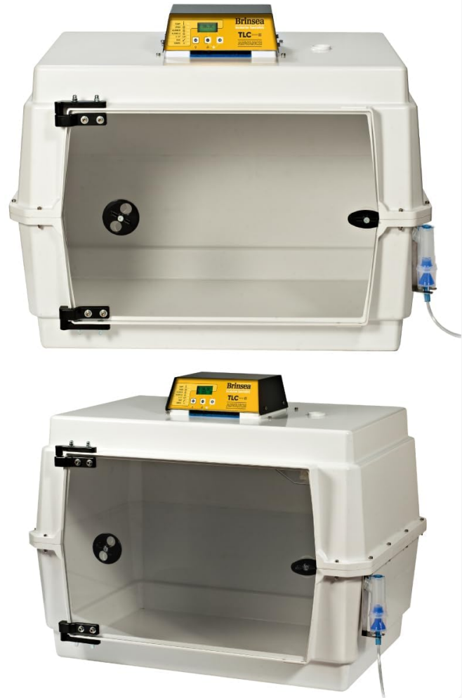
Figure 1: The Brinsea TLC-50 Advance Series II incubator in use, providing a safe environment for a hedgehog.