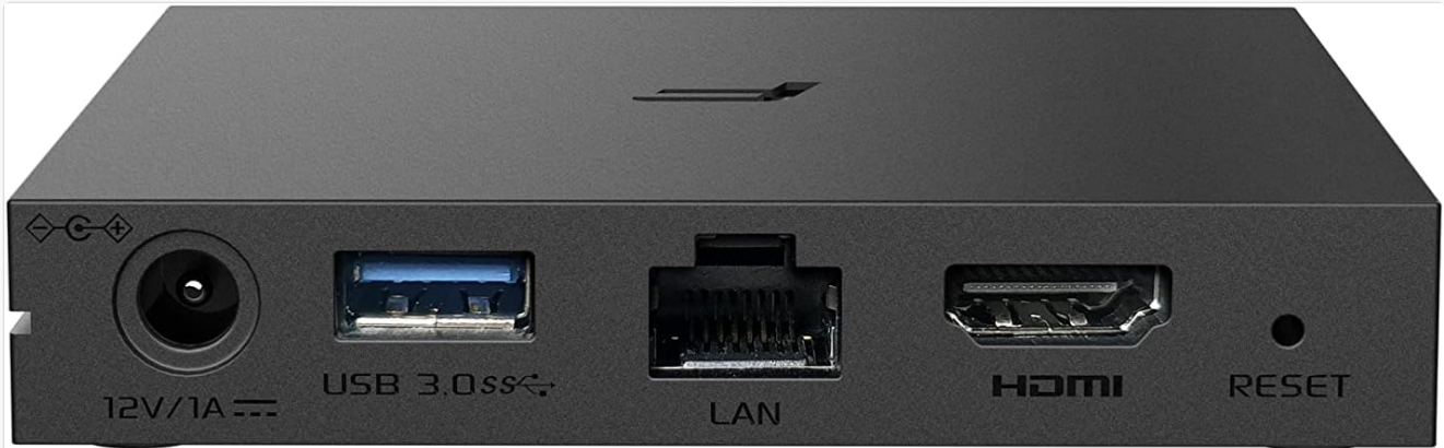
Figure 3.2: Rear panel of the Formuler Z10, illustrating the power input (12V/1A), USB 3.0 port, LAN port, HDMI output, and Reset button.

The Formuler Z10 features various ports for connectivity. Familiarize yourself with these ports before setup.