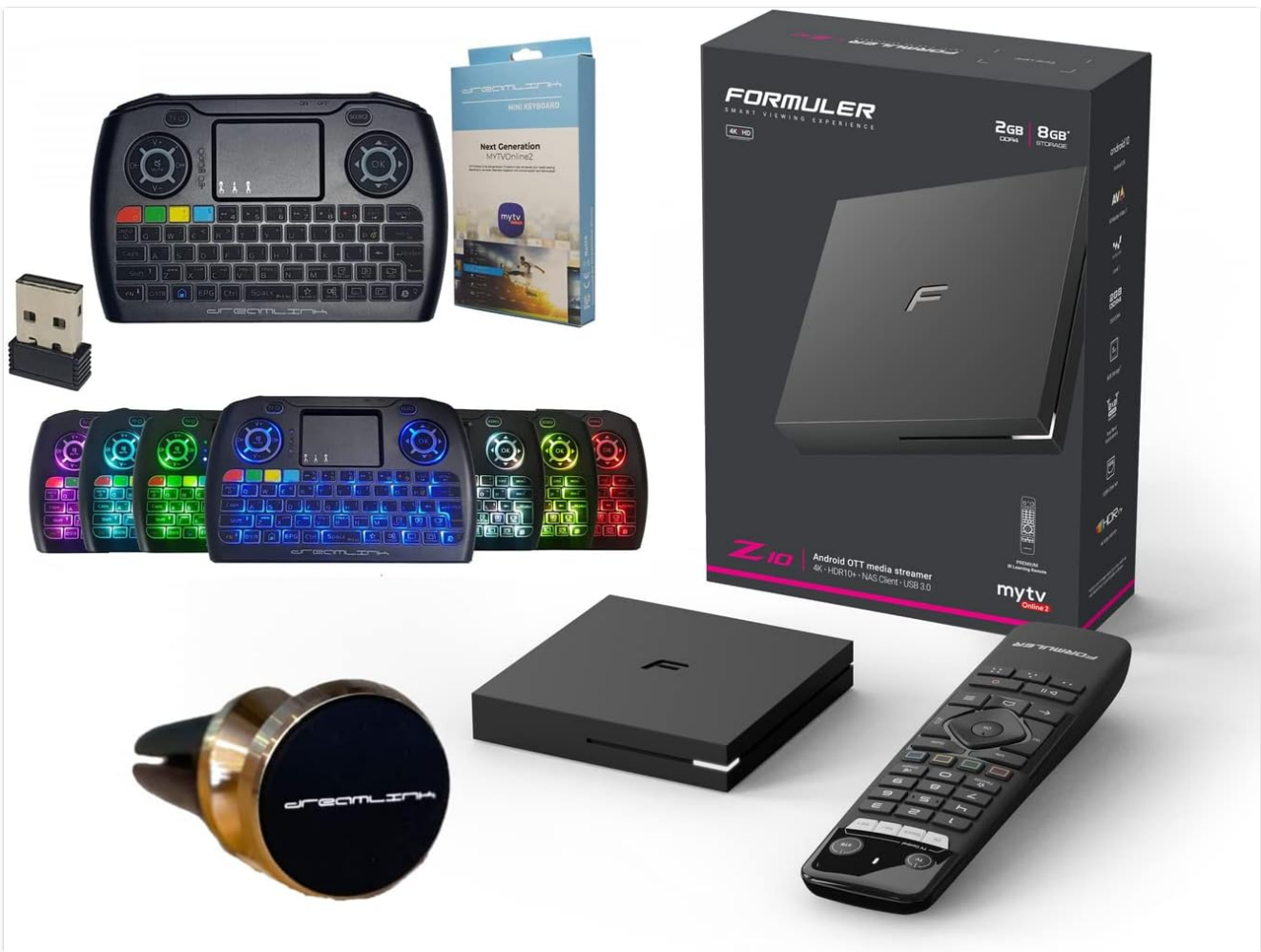
Figure 2.1: Overview of the Formuler Z10 package contents, including the main unit, remote, wireless keyboard, and magnetic car mount.