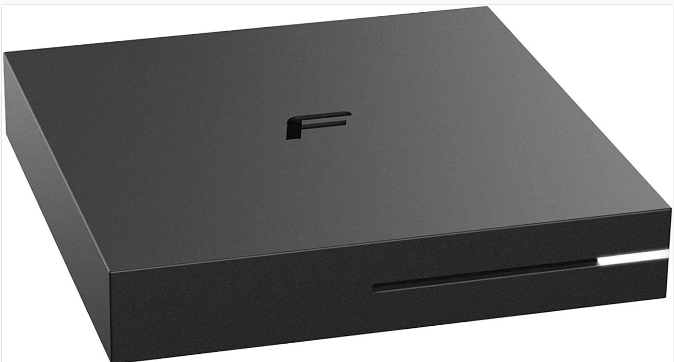
Figure 3.1: Front view of the Formuler Z10 streaming media player, showcasing its compact design.