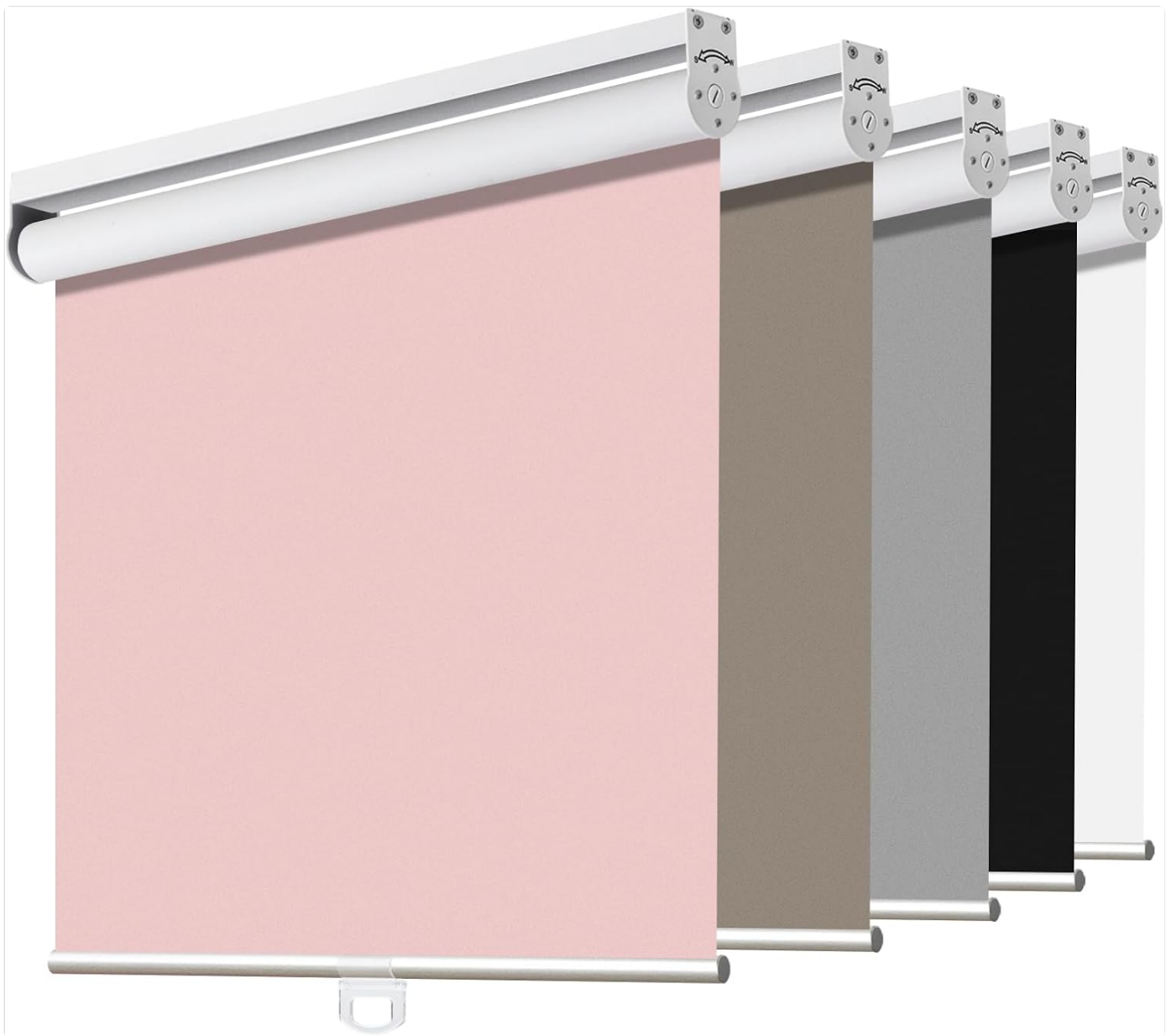
Image: Joydeco Cordless Blackout Roller Shades, showcasing multiple color options including pink, grey, coffee, black, and white.