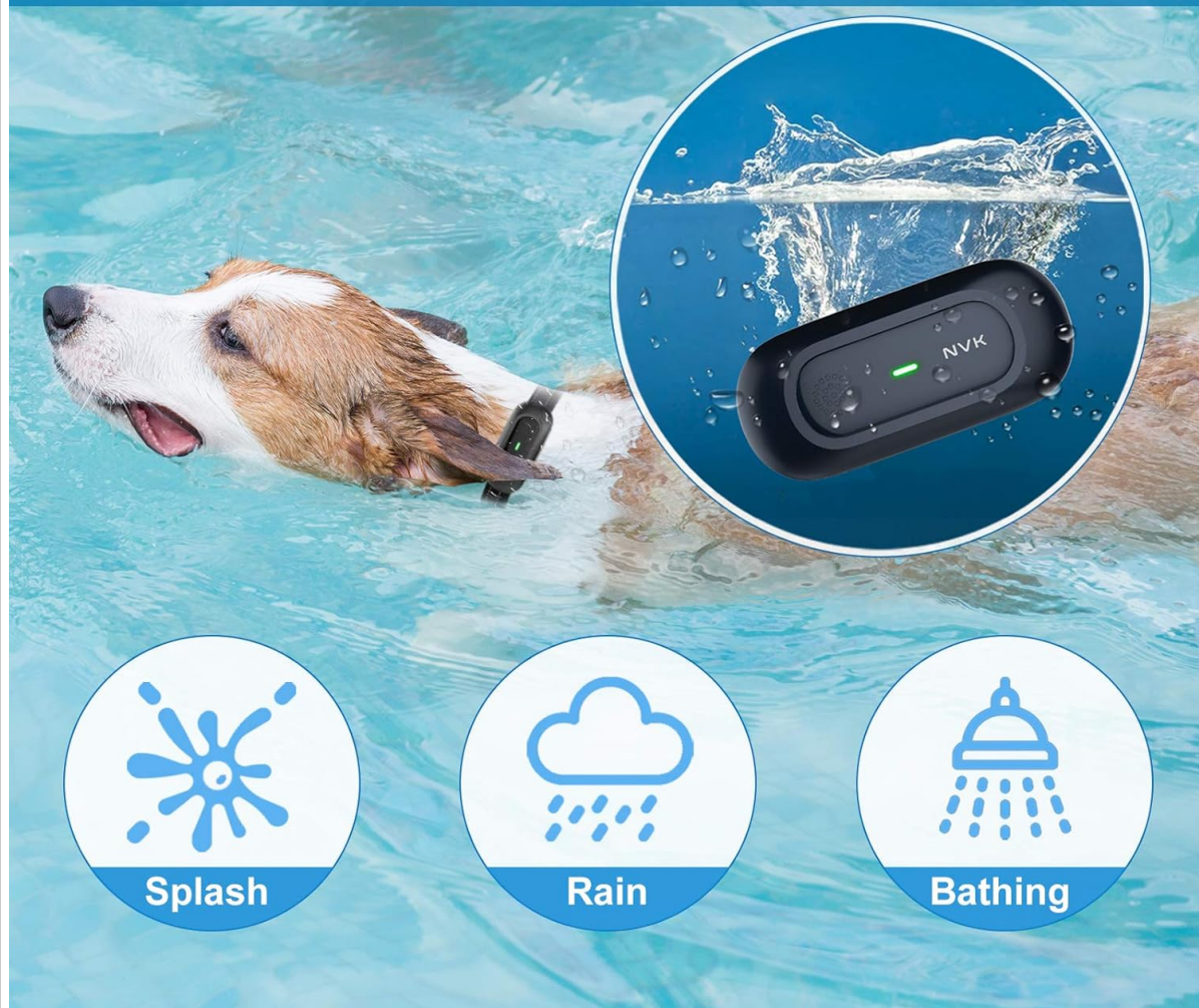
Image: A dog wearing the NVK training collar while swimming, demonstrating its IPX7 waterproof capability.