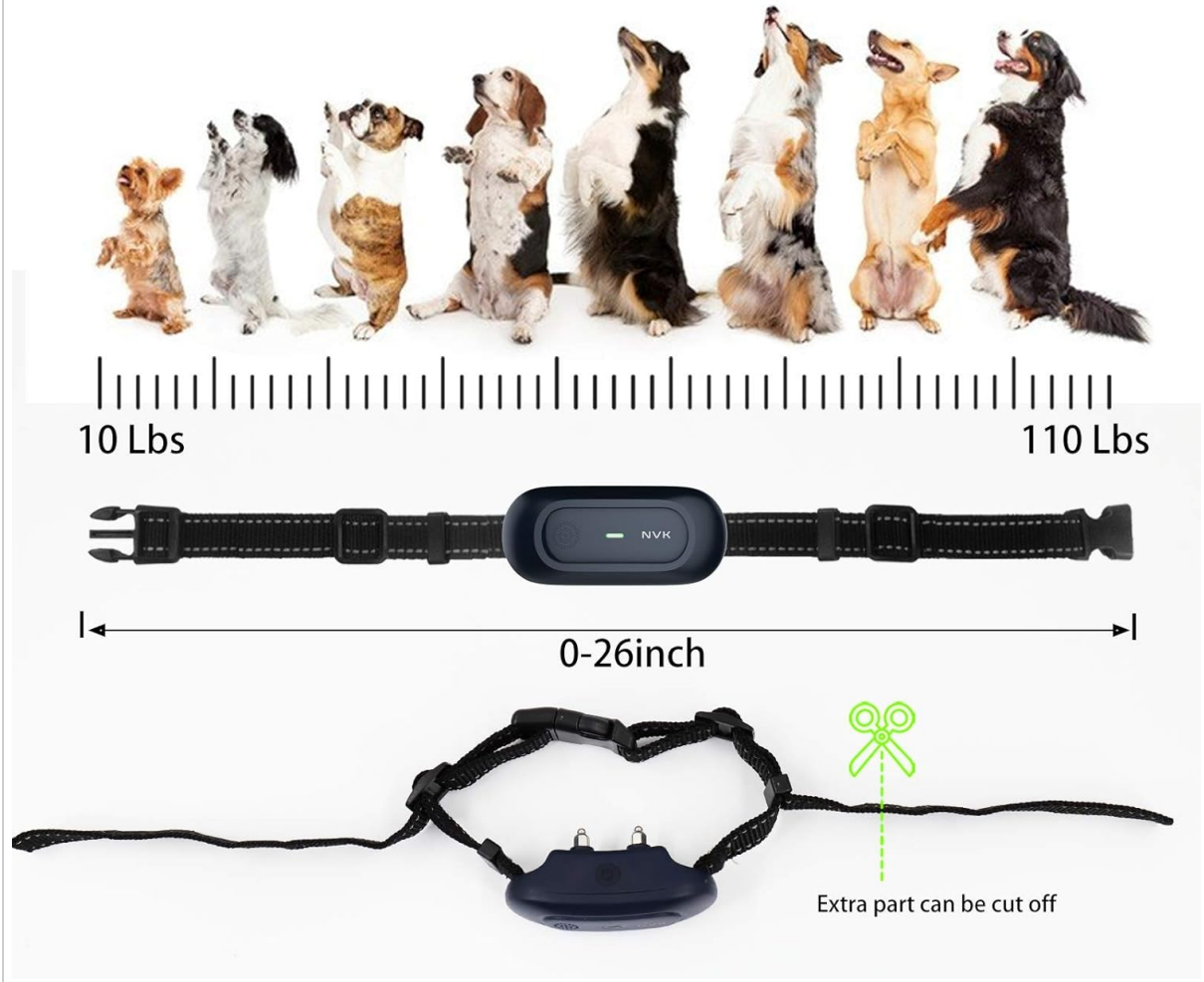
Image: A visual guide demonstrating the adjustable length of the collar strap, suitable for dogs weighing 10 lbs to 110 lbs.