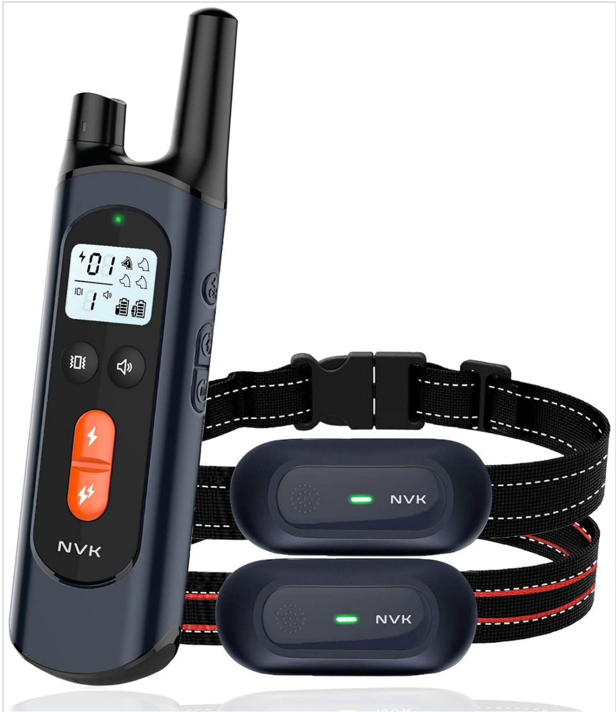
Image: The NVK remote transmitter and two receiver collars, illustrating the complete training system.

The remote features a digital display and intuitive buttons for controlling the training collar. It allows for mode selection, intensity adjustment, and channel switching for multiple dogs.