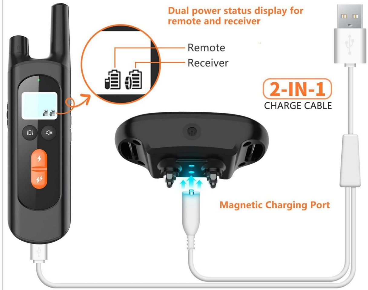
Image: The remote and receiver collar connected to the 2-in-1 magnetic charging cable, showing the charging process.