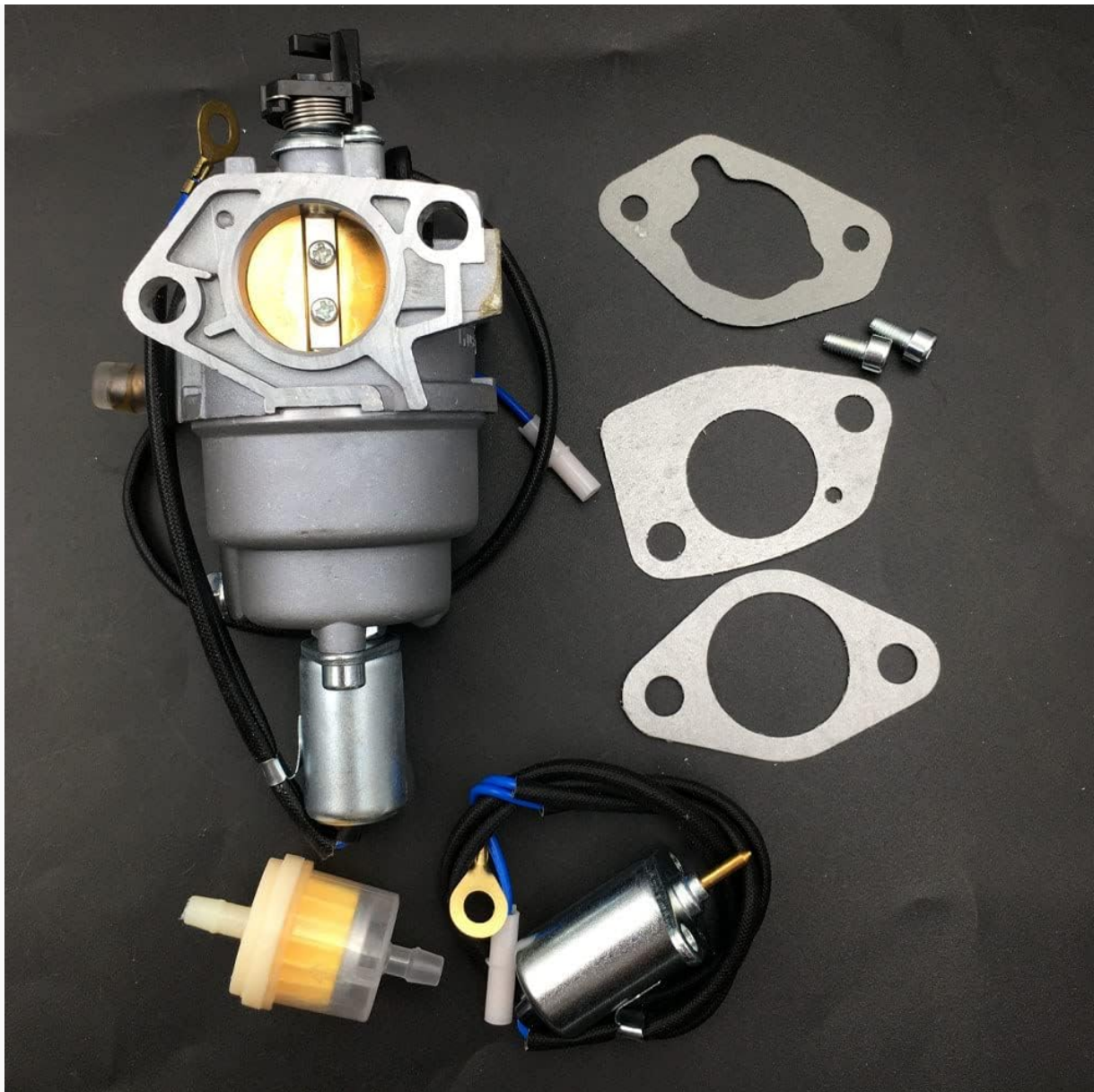
Image 2.1: Contents of the HUAYI T381 Carburetor package, including the carburetor, solenoid, fuel filter, screws, and gaskets.