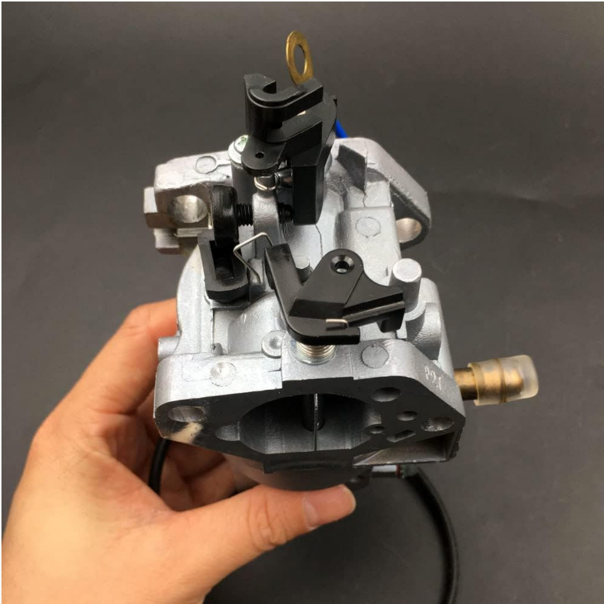
Image 4.1: Top view of the carburetor, highlighting the throttle and choke mechanism connections.

Your browser does not support the video tag.