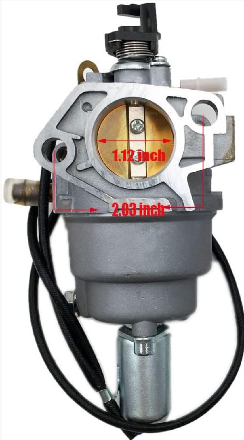
Image 3.1: Key dimensions of the carburetor for compatibility verification.