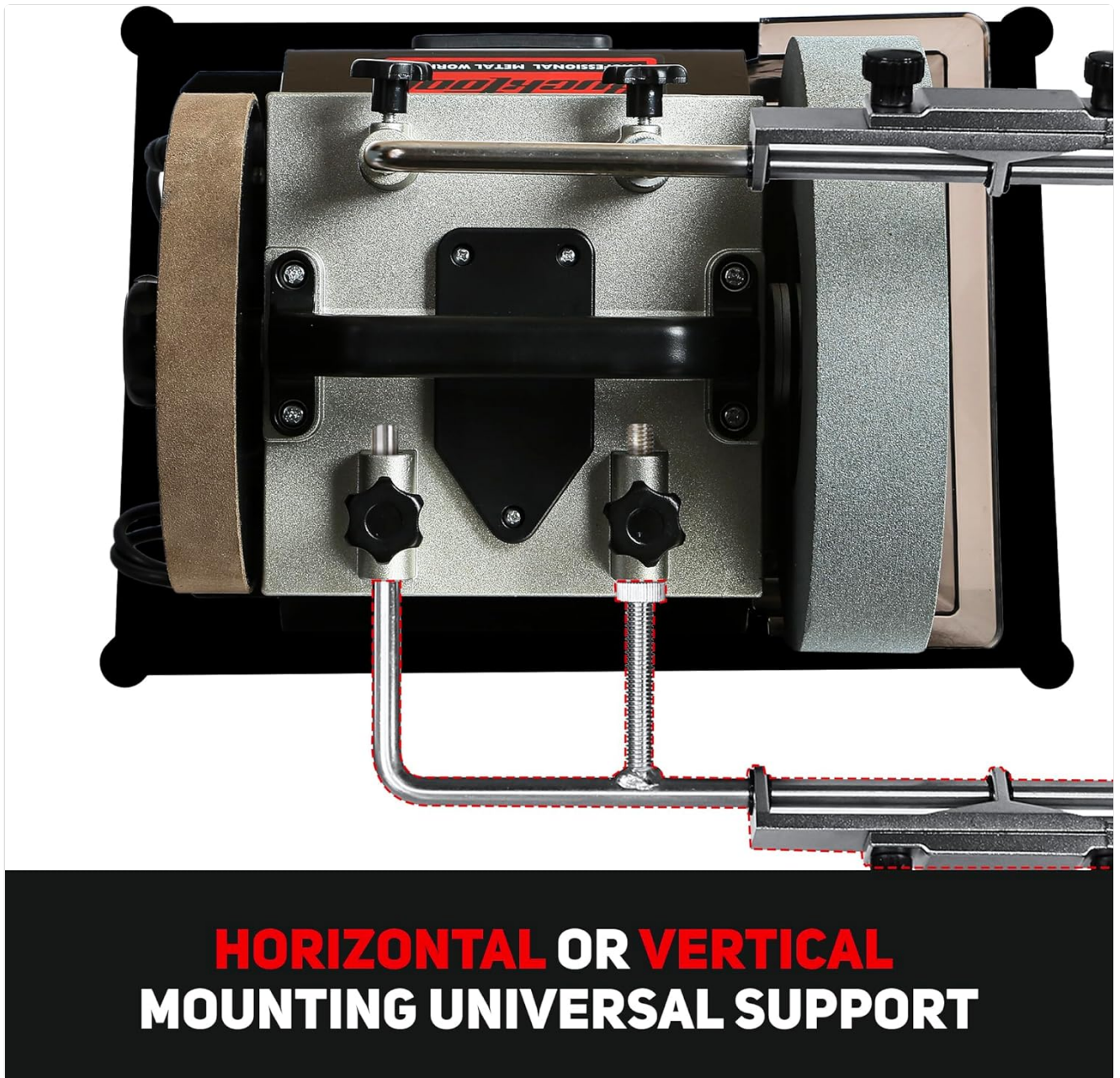
Image: Diagram showing the flexibility of the universal support for both horizontal and vertical mounting configurations.

6. Power Connection: Connect the power cord to a grounded 120V AC outlet.