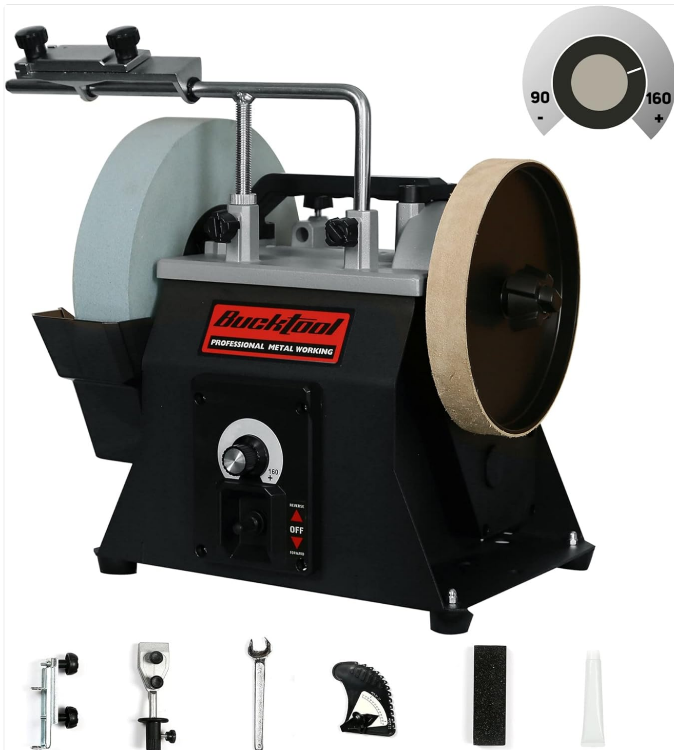
Image: The BUCKTOOL 10-Inch Variable Speed Wet Sharpening System, showcasing its main components including the sharpening wheel, stropping wheel, and control panel.