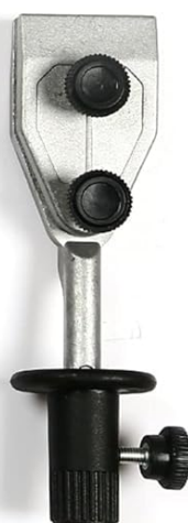
Short Knife Jig