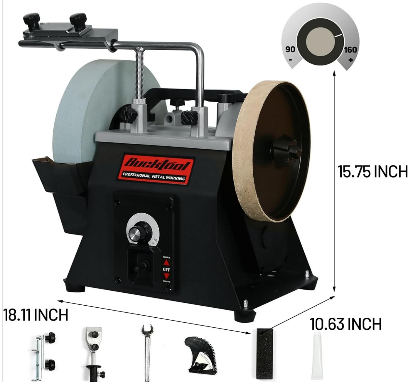
Image: A diagram illustrating the product dimensions: 18.11 inches (length), 10.63 inches (width), and 15.75 inches (height).