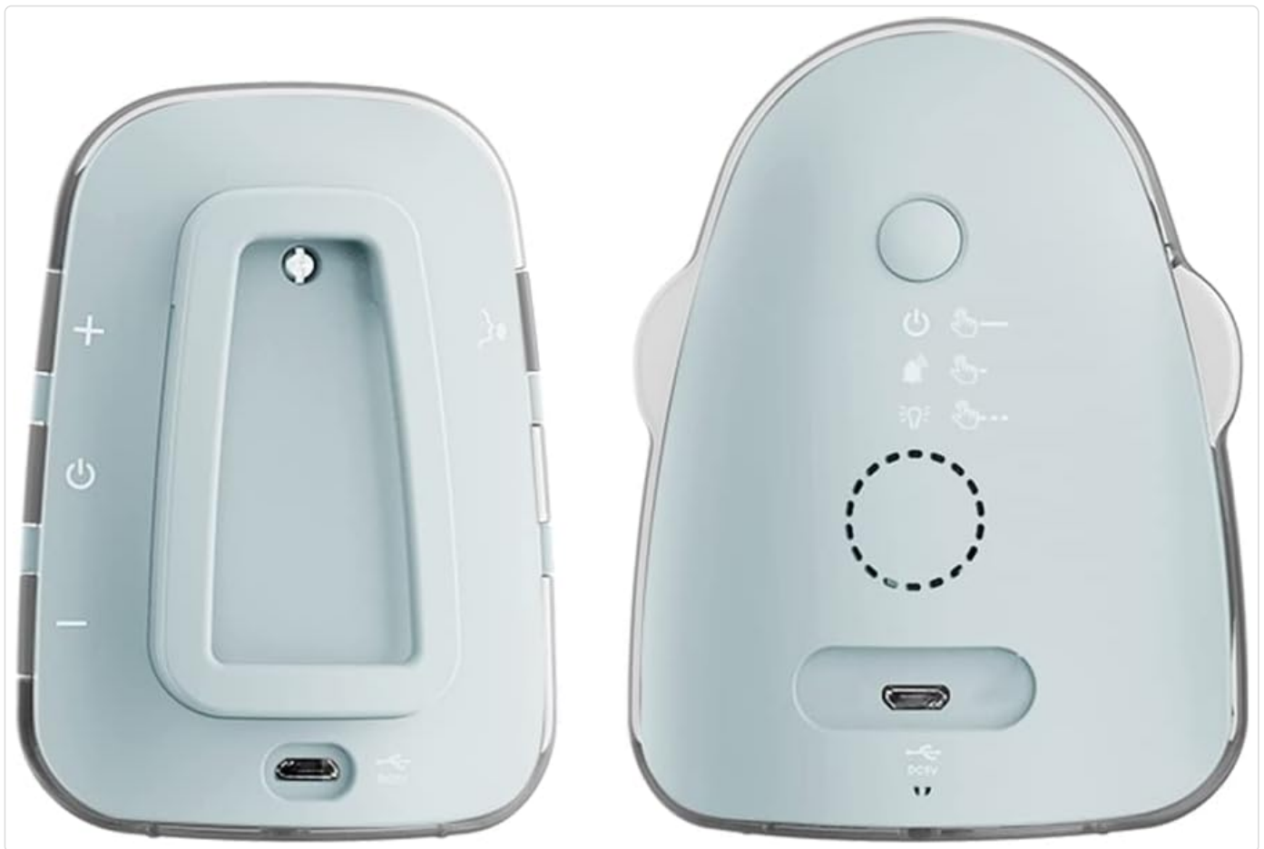
Figure 2: Back view of the TimeFllys Digital Audio Baby Monitor Camry units, highlighting the micro USB connection ports and the clip on the Parent Unit.