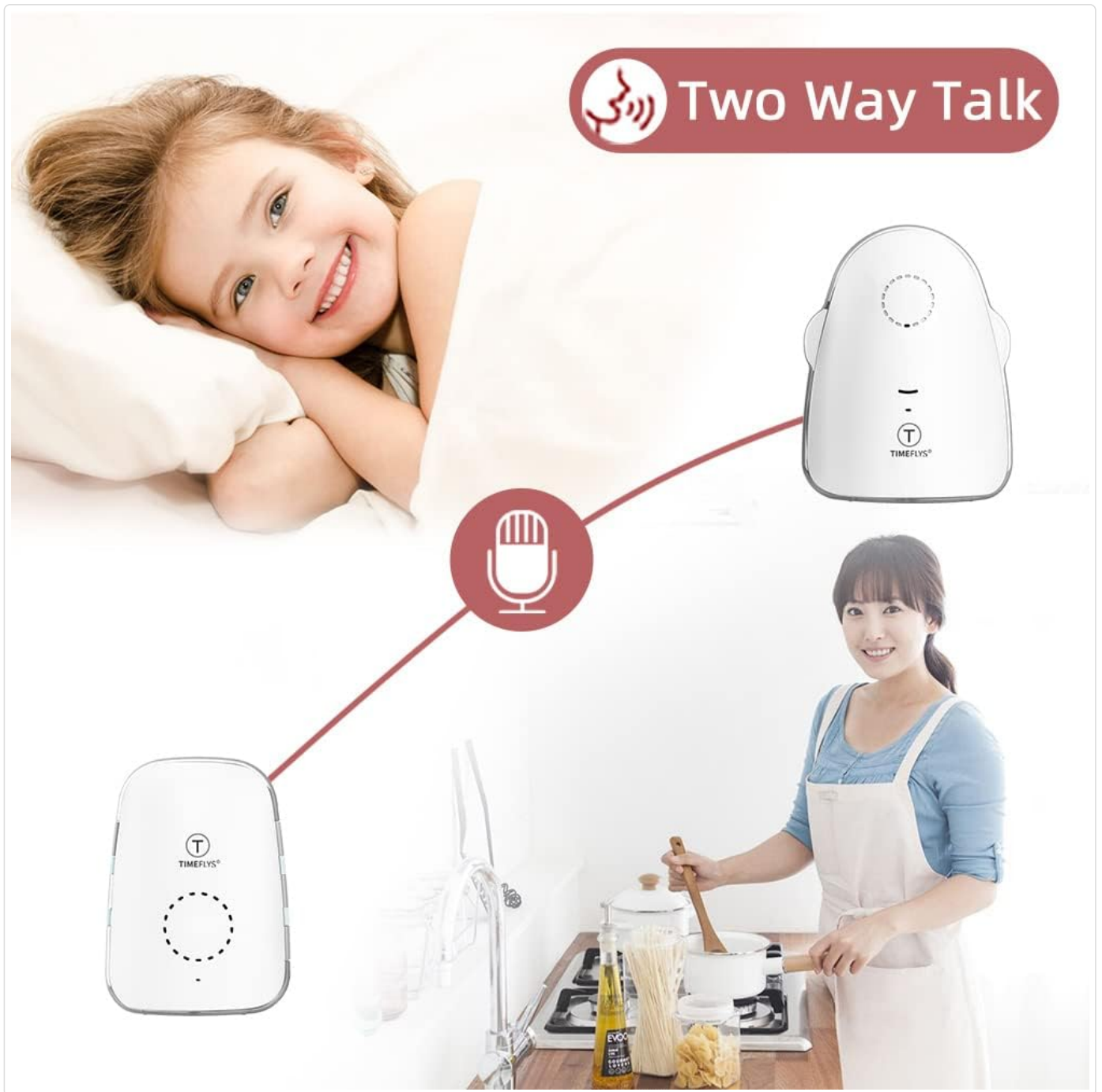
Figure 3: Visual representation of the two-way talk feature, showing communication flow between the Parent Unit and the Baby Unit.