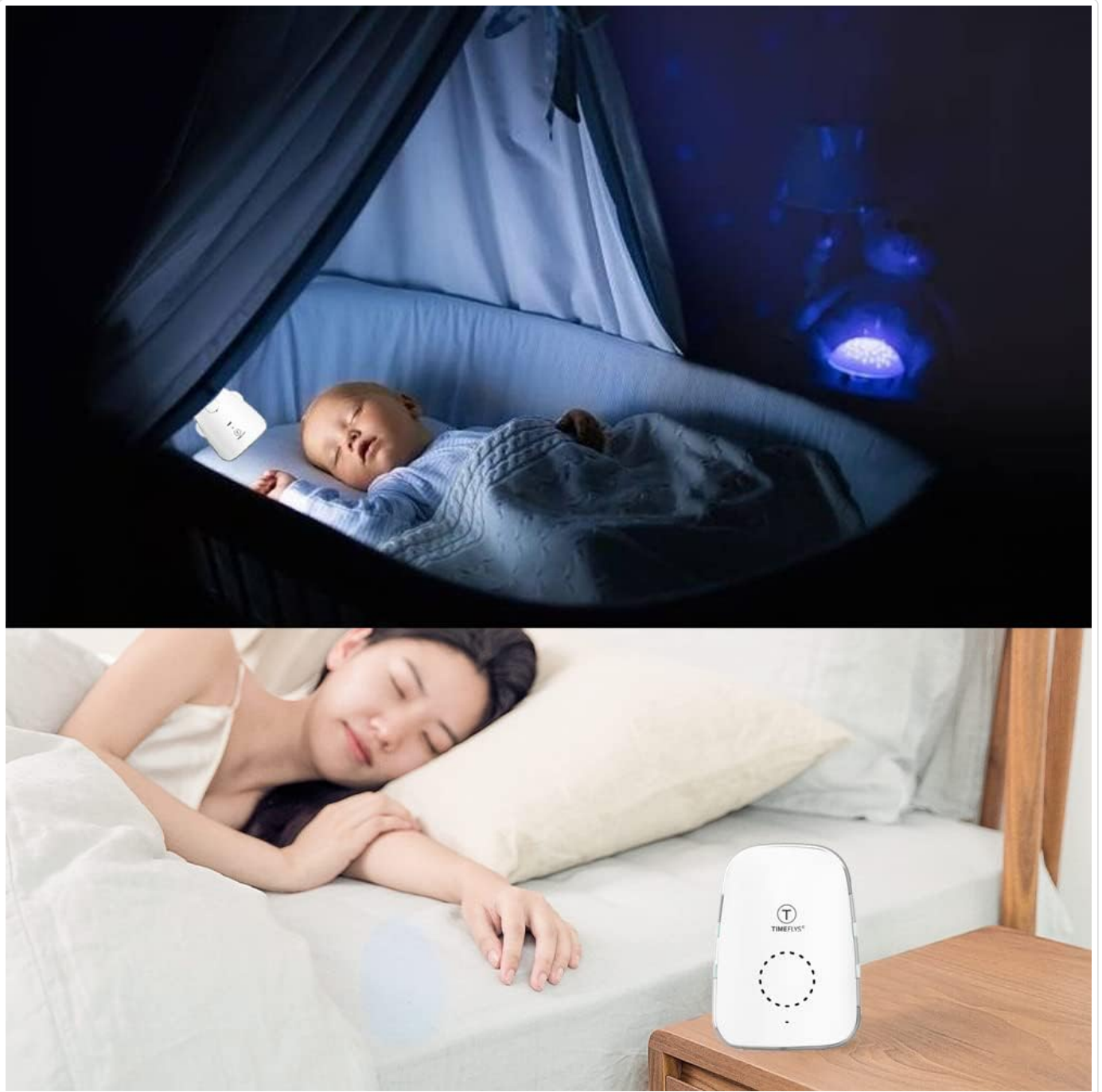
Figure 4: The Baby Unit's night light providing illumination in a baby's crib, and the Parent Unit positioned near a sleeping parent.