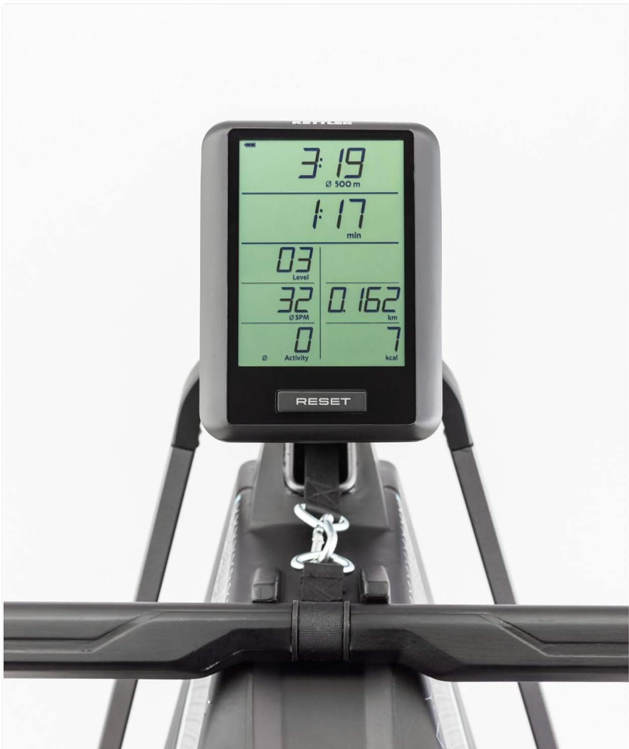
Image: The LCD training computer displaying workout metrics.