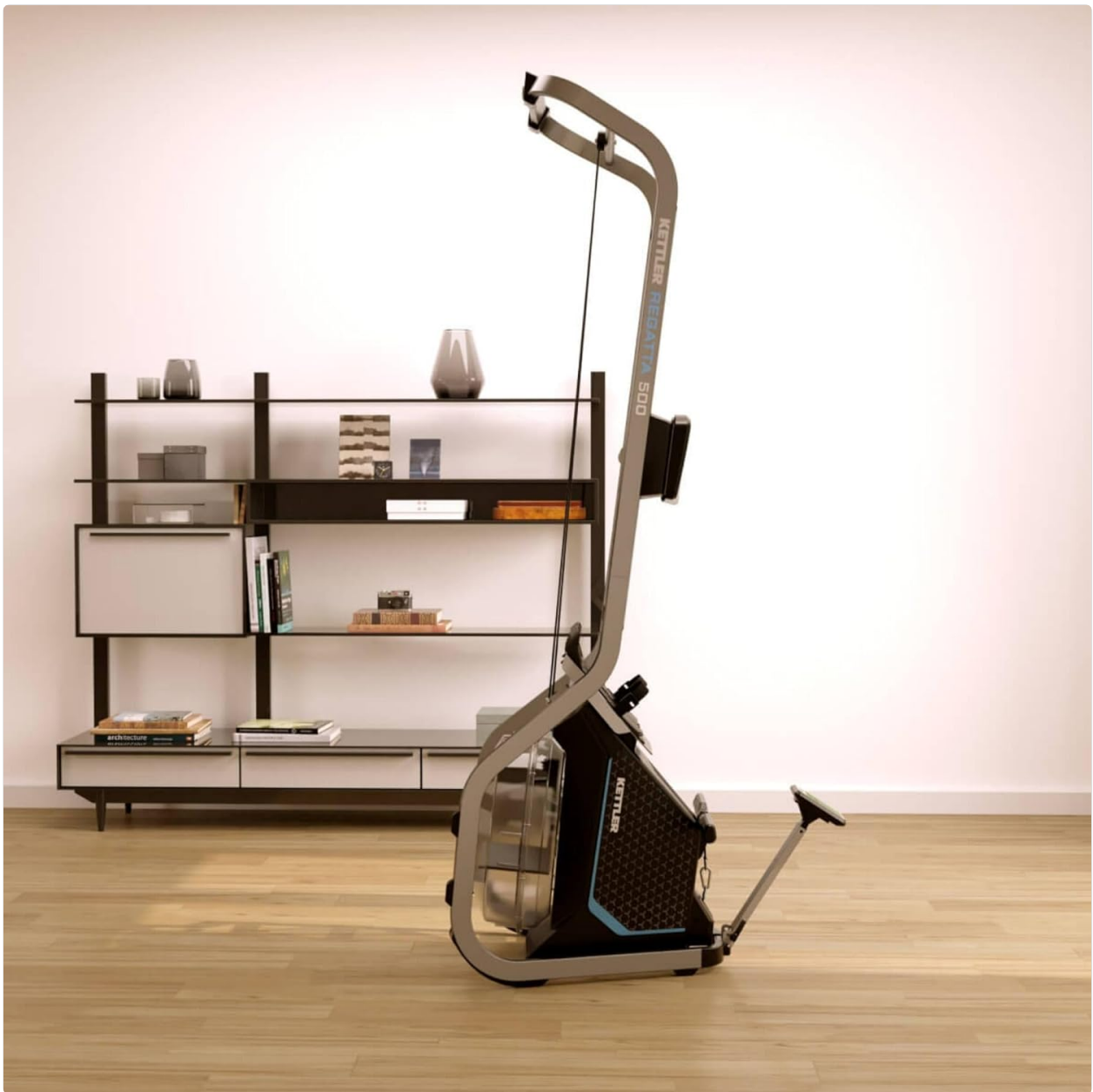
Image: The rowing machine stored in an upright, space-saving position.