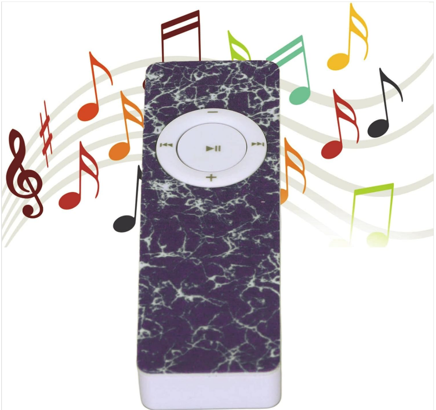
Image 5.1: The GOWENIC Mini MP3 Player in use, surrounded by musical notes, illustrating its primary function.