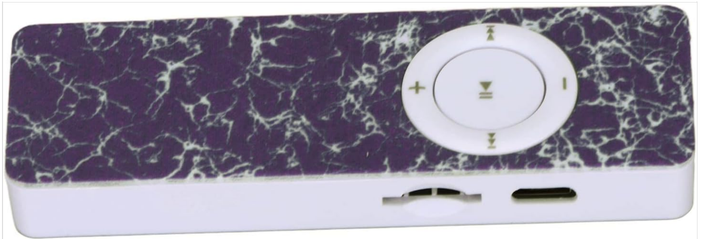
Image 3.3: Bottom view of the GOWENIC Mini MP3 Player, showing the microSD card slot and the micro USB port.