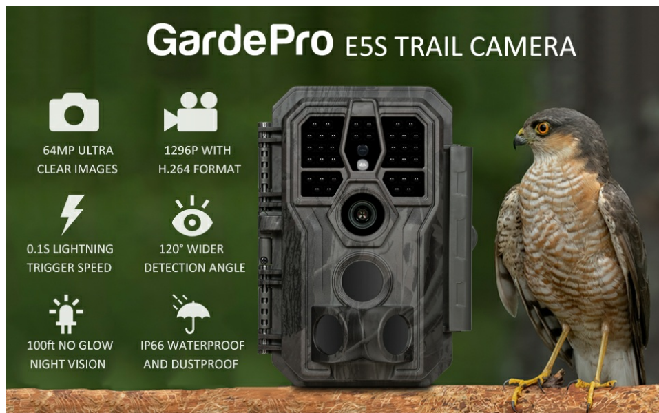
Figure 7: Image clarity features of the camera.