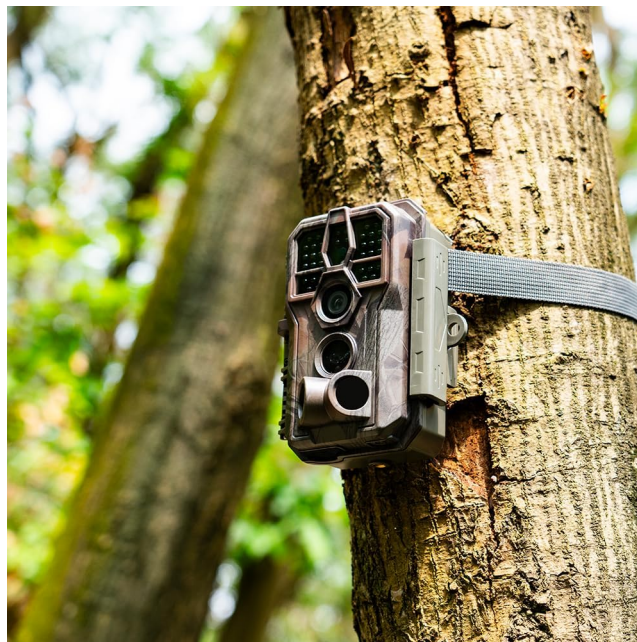
Figure 4: Camera mounted on a tree using the strap.

The camera can be mounted using the included mounting strap or a tripod. For strap mounting, feed the strap through the loops on the back of the camera and secure it around a tree or post. For tripod mounting, use the 1/4-20 threaded insert at the bottom of the camera.