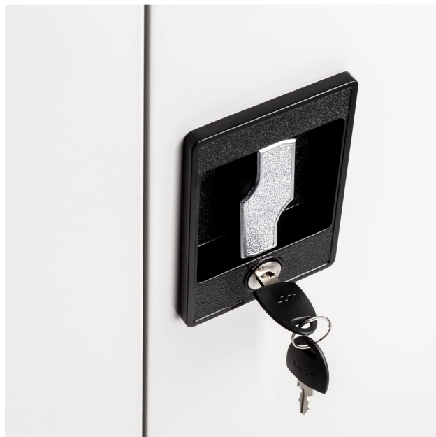
A detailed view of the central key lock, which provides security for the cabinet's contents.