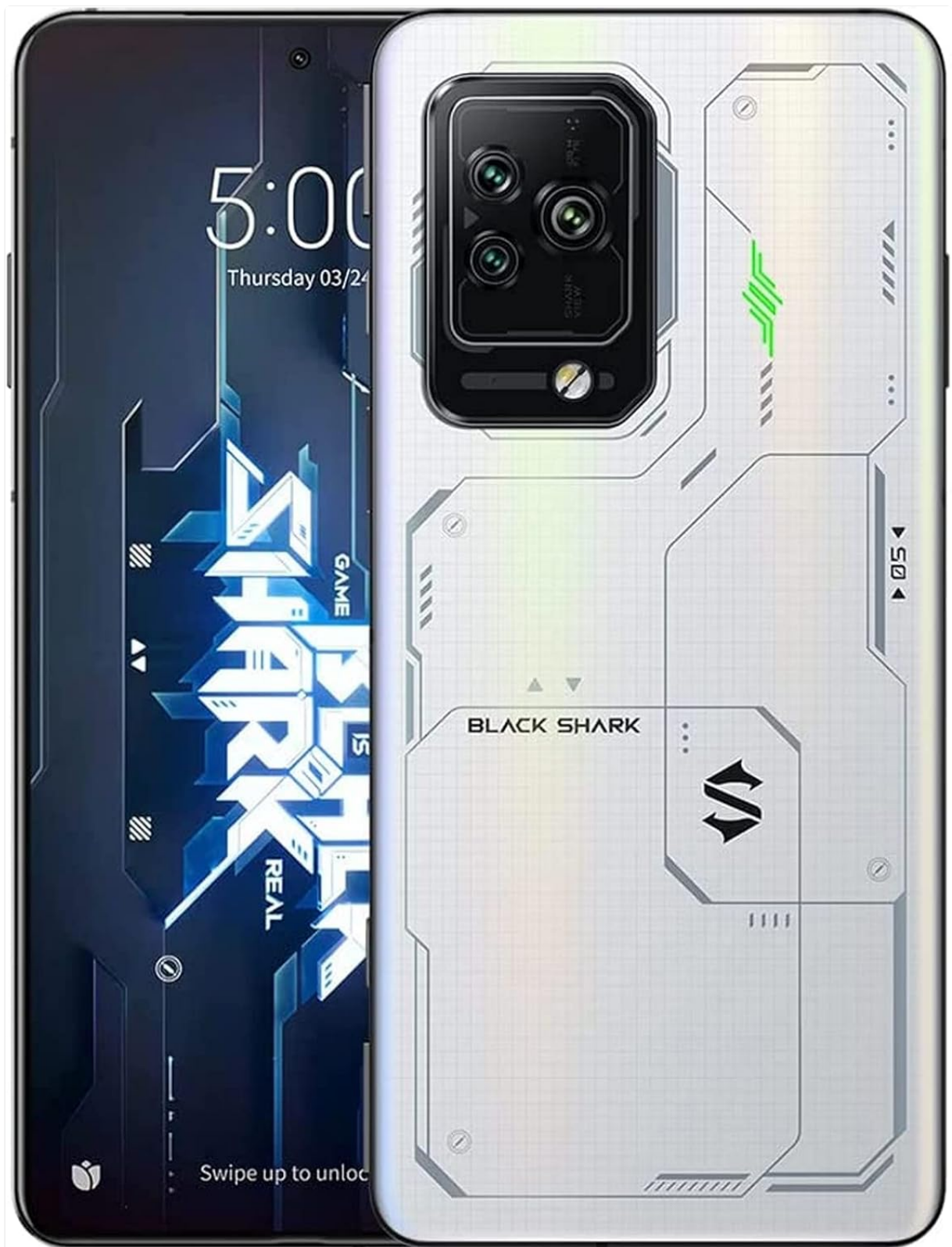
Figure 2.1: Black Shark 5 Pro Front and Rear View. This image displays the smartphone from both the front, highlighting its display, and the back, showcasing the camera array and the distinctive white design.