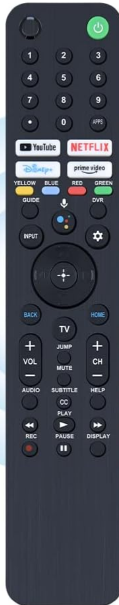
Image: The RETROSUN RMF-TX520U MG3-TX520U remote control displayed with examples of compatible Sony Bravia TV models.