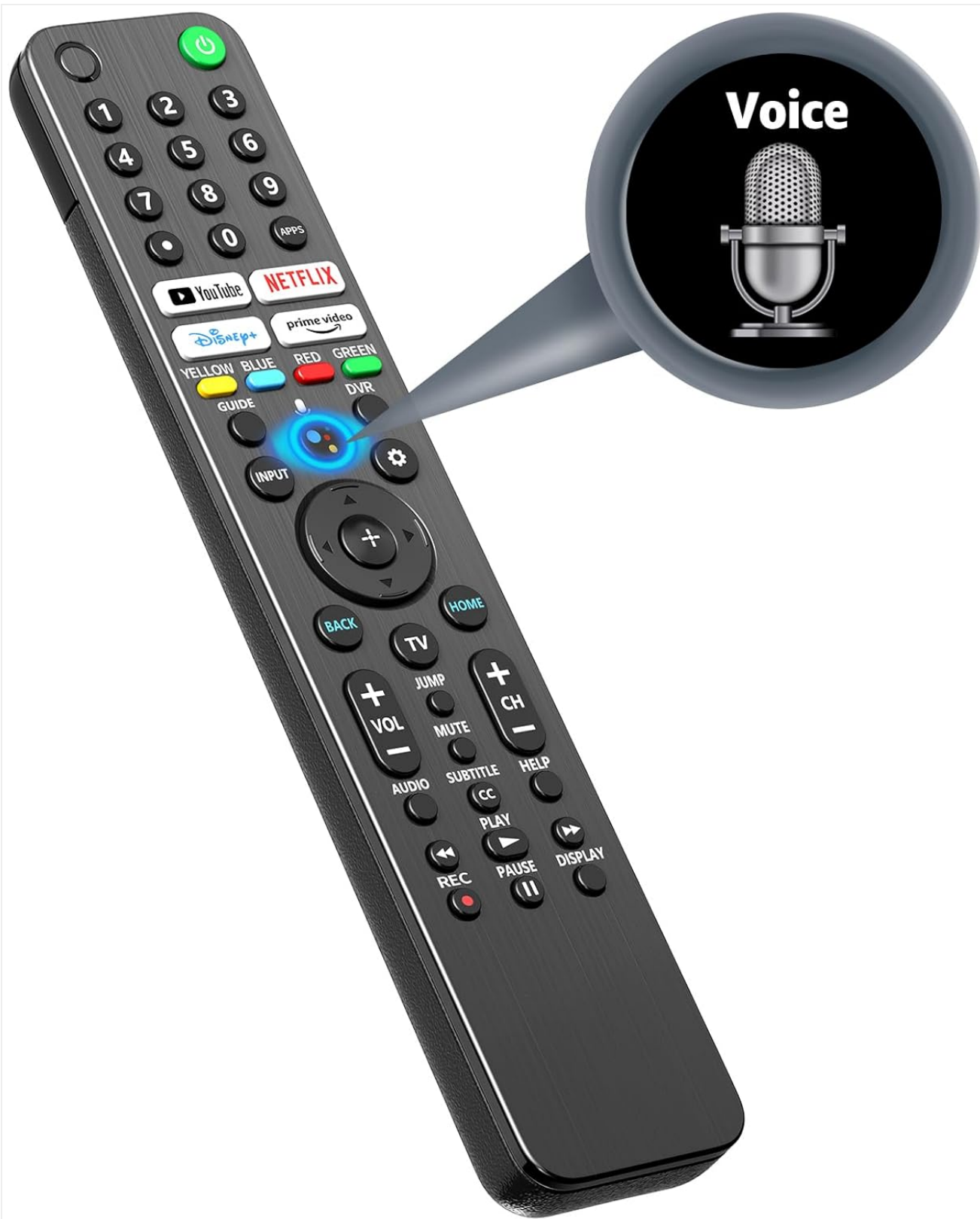
Image: The voice control button on the remote control.