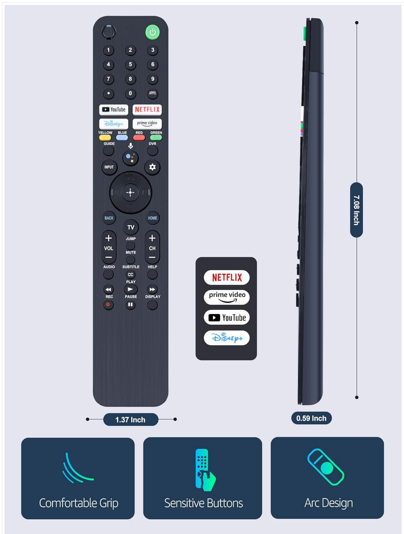
Image: Dimensions and design features of the remote control, emphasizing comfort and usability.