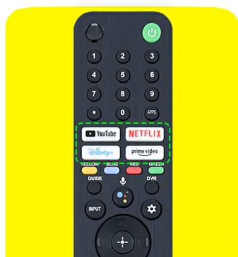
Image: The remote features multiple shortcut buttons for popular streaming services.