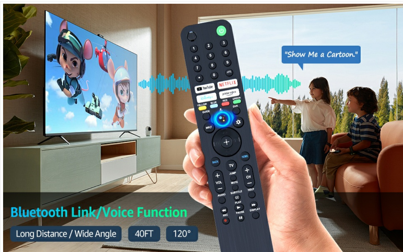
Image: The remote's Bluetooth link and voice function enable control from a distance and at various angles.