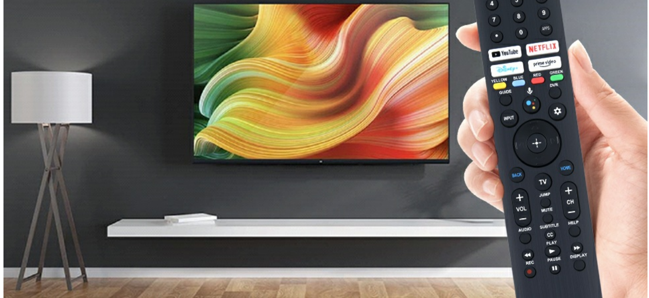
Image: The RMF-TX520U Voice Remote Control positioned in front of a Sony Bravia Google TV, illustrating its intended use with the specified series.