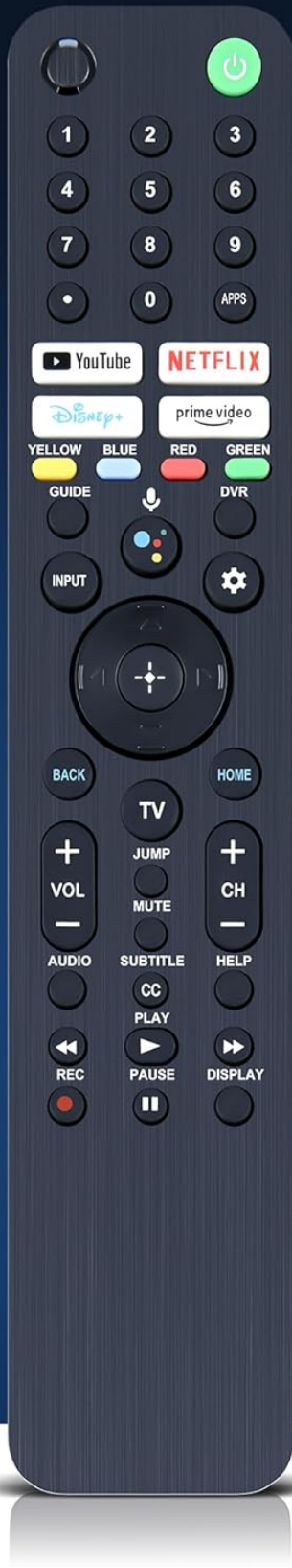
Image: Visual guide for pairing the remote control with your television.