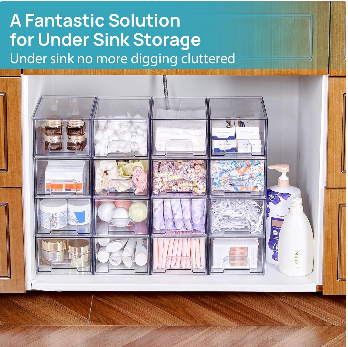
Image: Several Vtopmart clear stackable storage drawers neatly arranged under a sink, providing an organized solution for various household items.