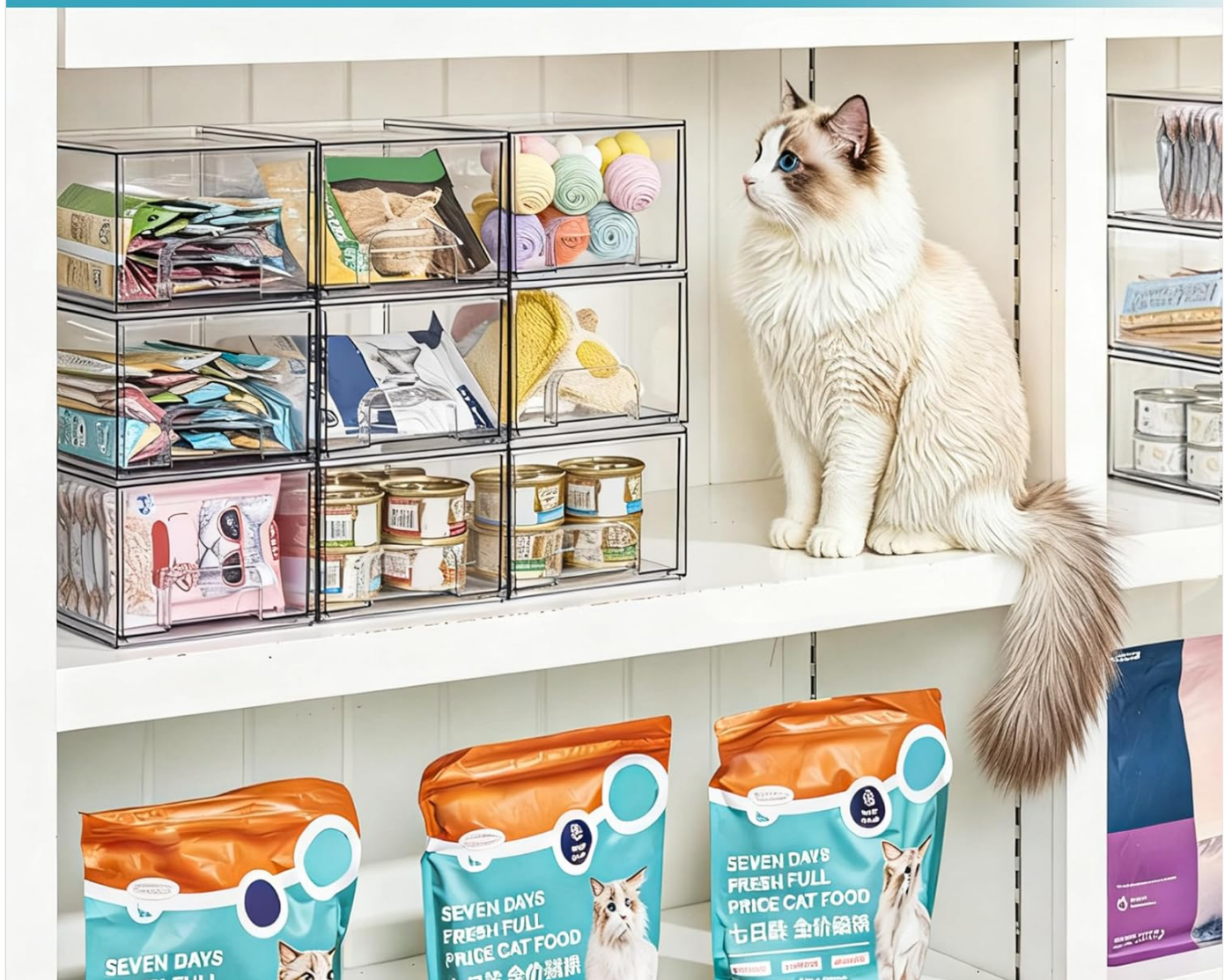
Image: Clear stackable storage drawers used to organize cat food cans, treat strips, and small toys, demonstrating their utility in a pet food station.