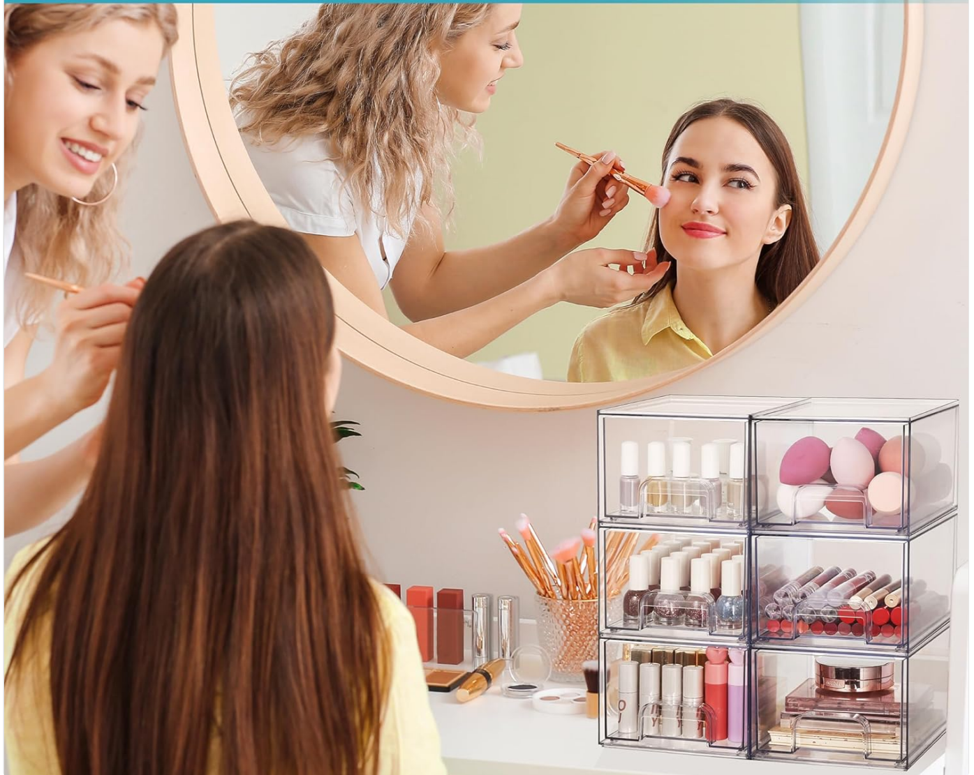
Image: A vertical stack of Vtopmart clear storage drawers on a vanity, showcasing their use for organizing cosmetics and beauty products.