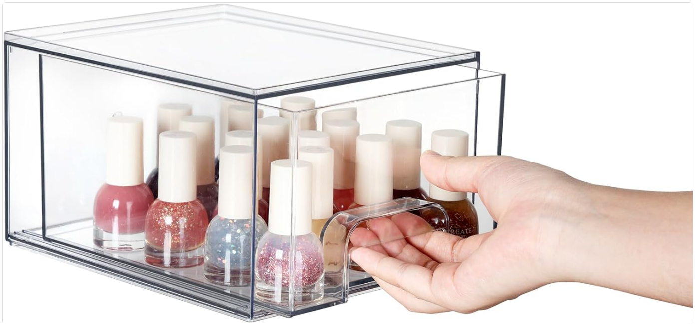
Image: A hand demonstrates pulling out a clear storage drawer, revealing neatly organized nail polish bottles inside.