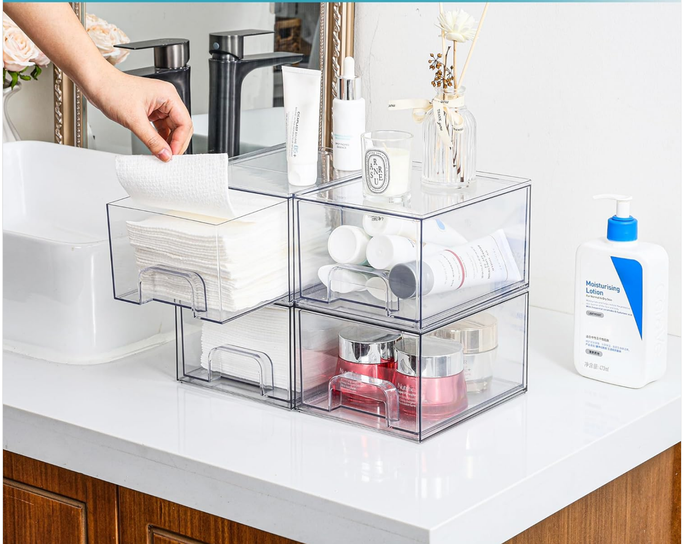
Image: Clear stackable storage drawers neatly arranged on a bathroom counter, holding facial cleansing accessories, skin creams, and hair accessories for easy access and organization.

Ideal for organizing facial cleansing accessories, skin creams, hair accessories, etc.