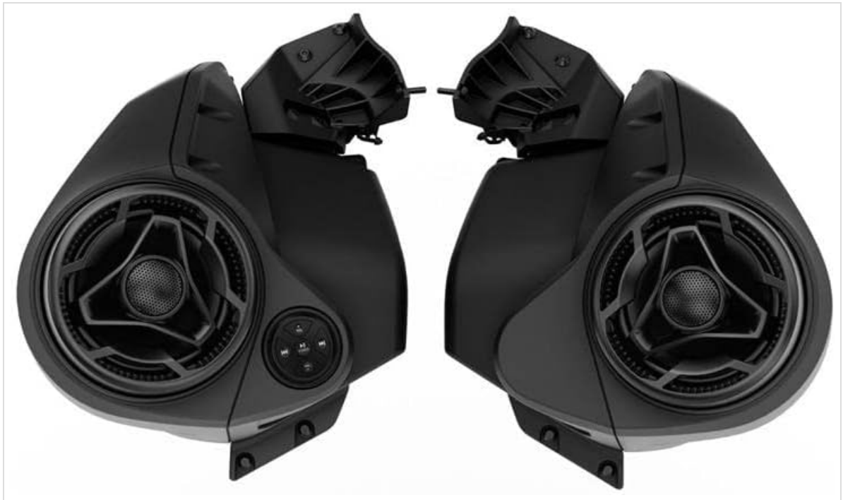
Image: The Sea-Doo BRP Audio-Premium System, showing the two marine-grade speakers. The left speaker features an integrated remote control pad for easy access to audio functions.