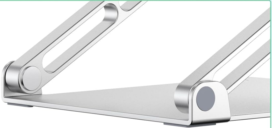
Premium aluminum and sturdy parallel risers

Considerate details provide devices more security