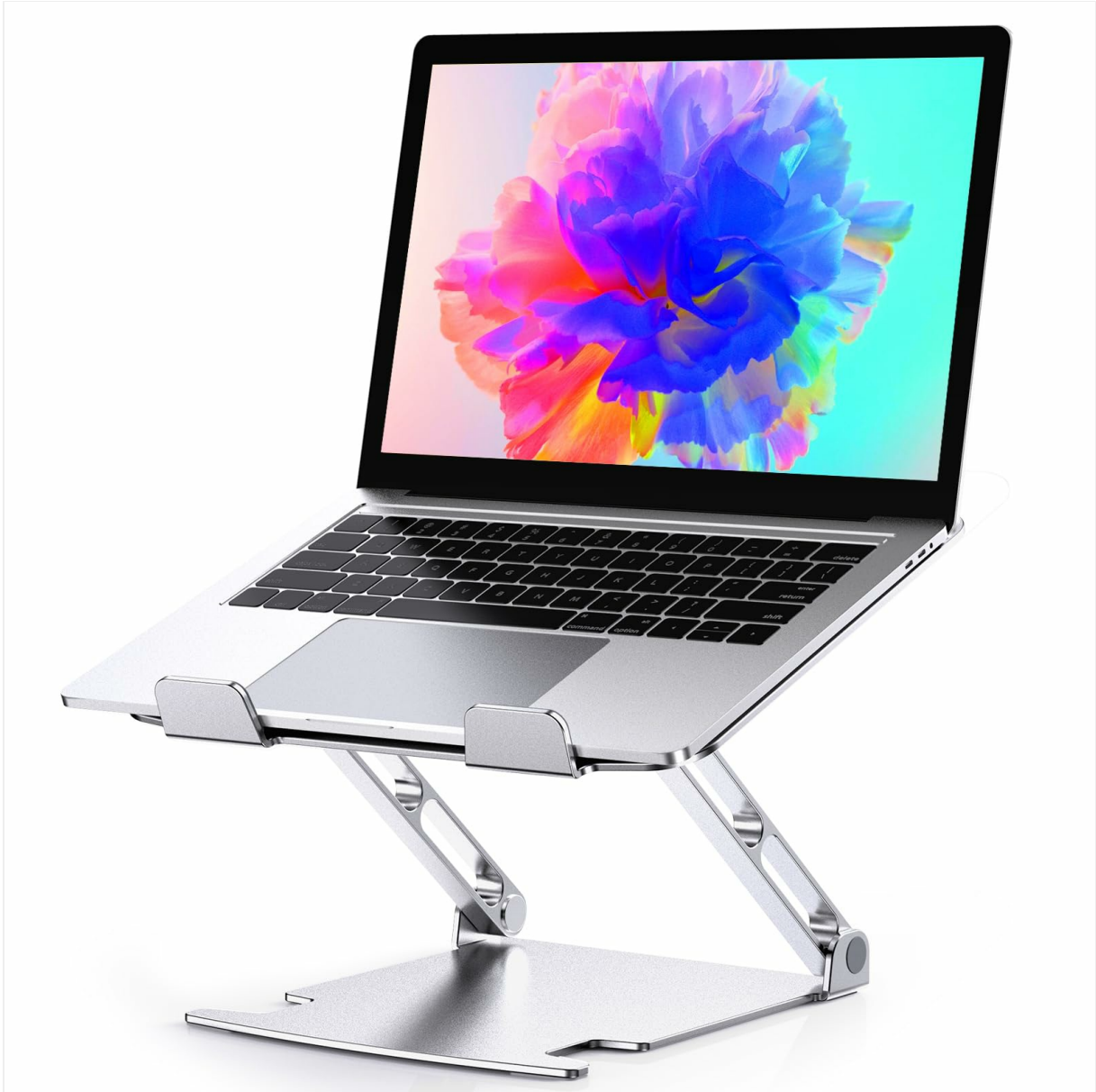
Image 1: The Glangeh B15 laptop stand in use with a laptop, showcasing its multi-angle and height adjustment capabilities. The stand can be adjusted up to a maximum angle of 55 degrees and a maximum height of 21 cm, promoting an ergonomic working posture.