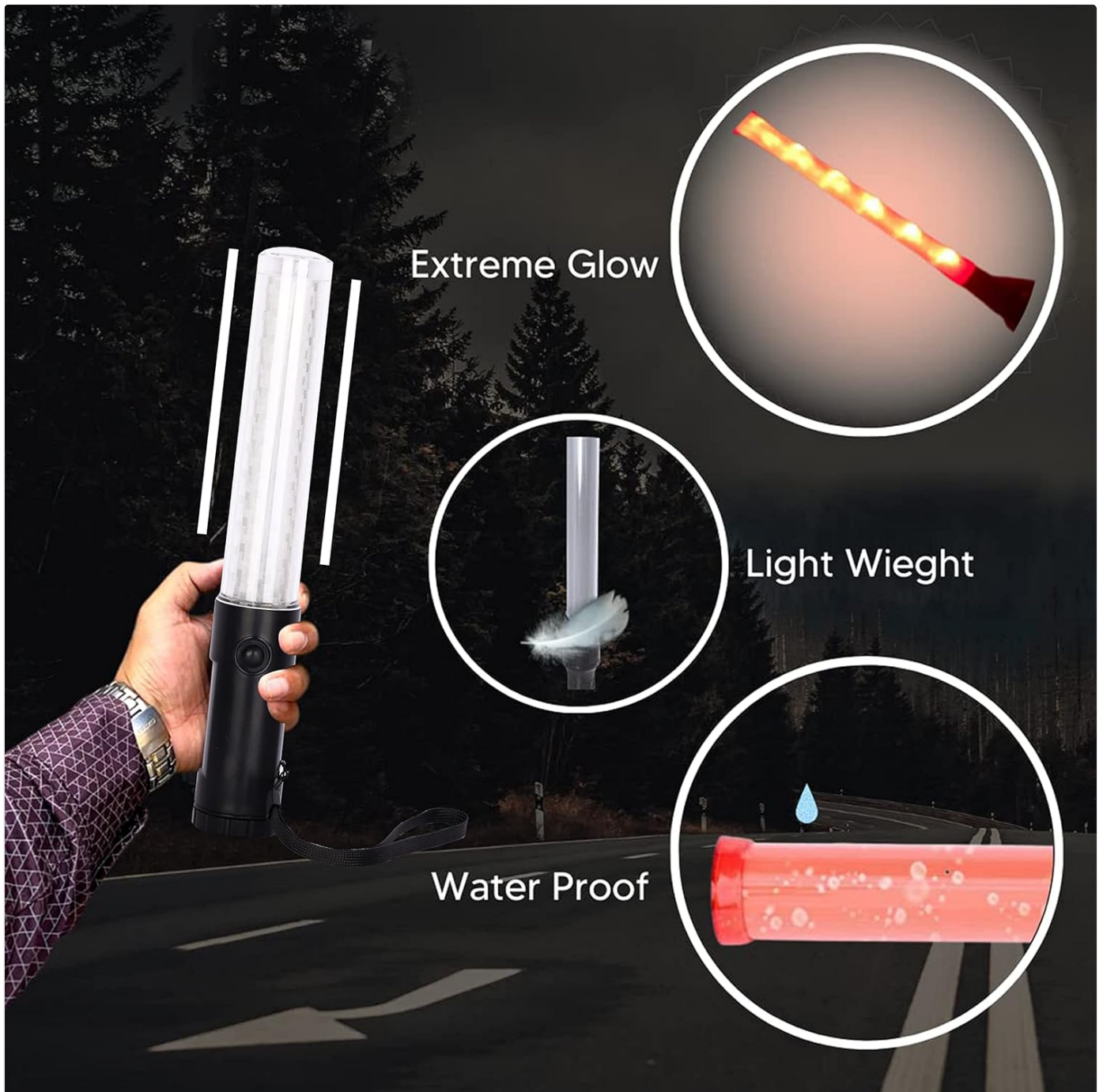
Figure 8: The light stick in an operational setting, highlighting its extreme glow, lightweight design, and water-resistant properties (suitable for light rain).