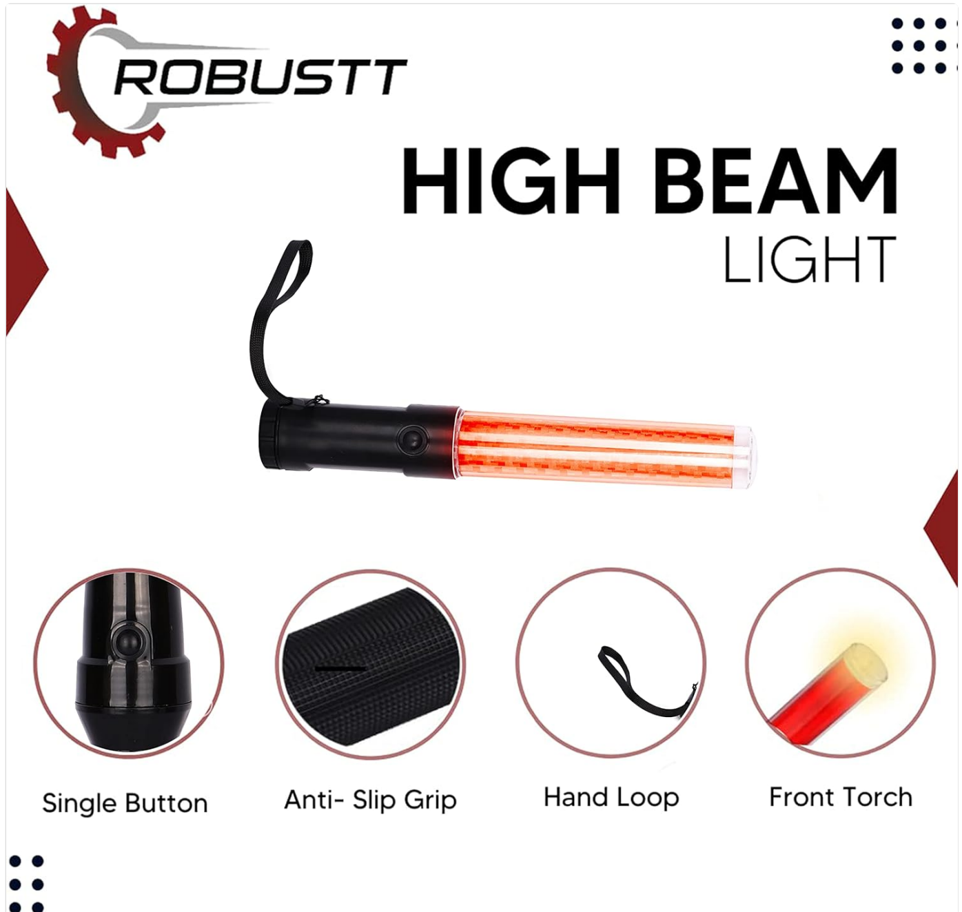
Figure 4: Close-up of the light stick handle, highlighting the single control button and the integrated hand loop for secure handling.