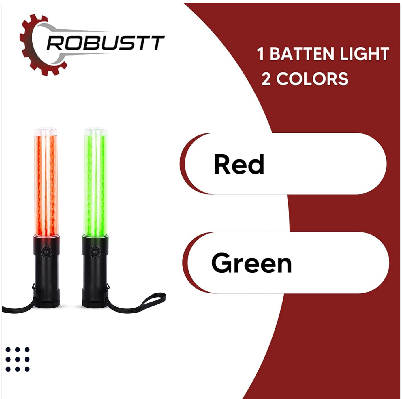
Figure 5: Depiction of the light stick displaying both red and green illumination options, demonstrating its dual-color capability.