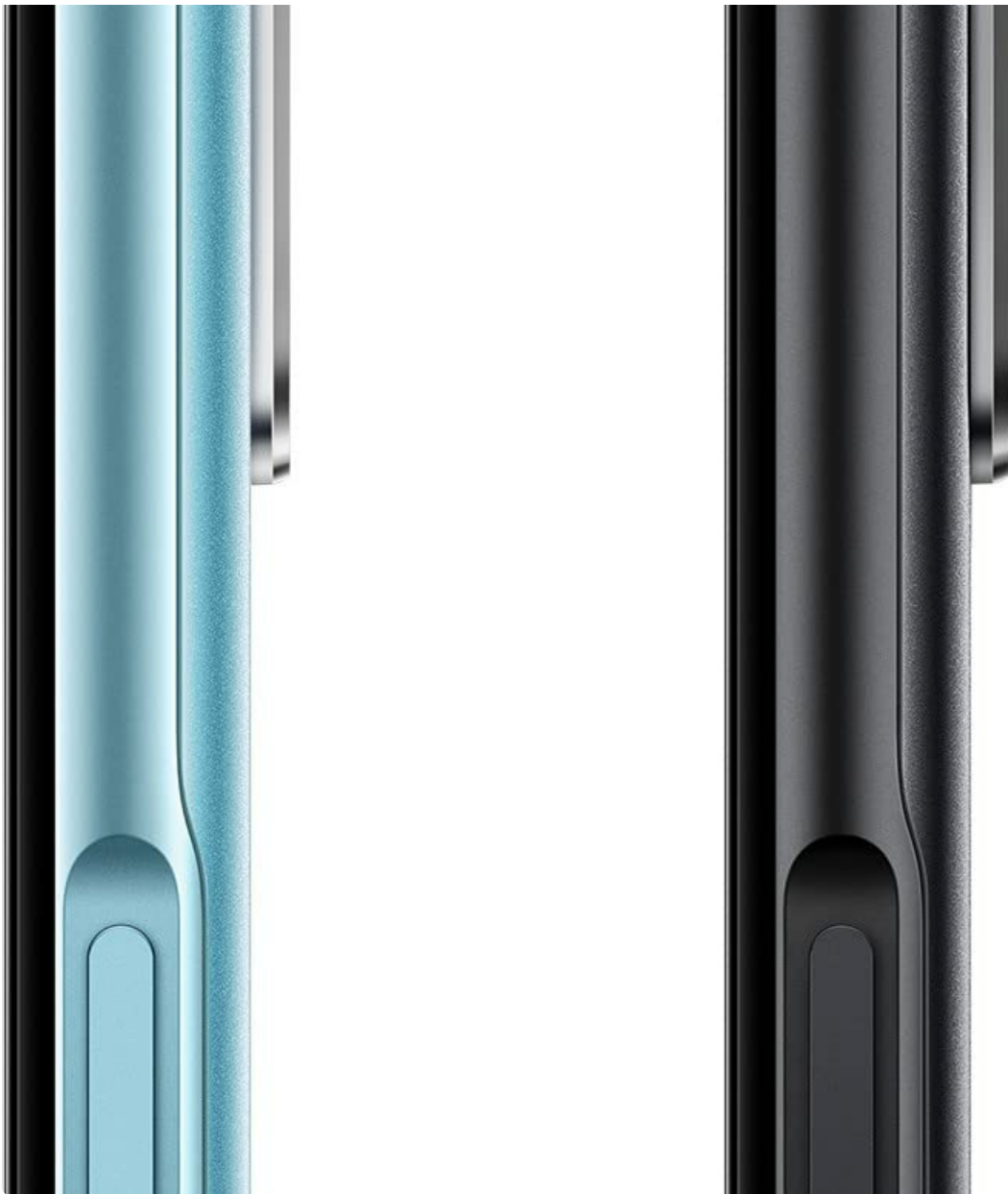
Figure 3: OPPO K10 Side View with Buttons