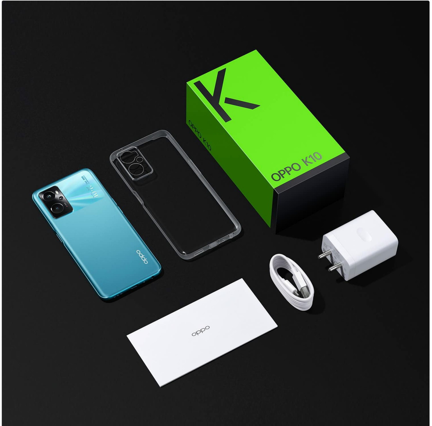
Figure 2: OPPO K10 Box Contents