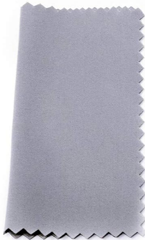
Microfiber Cleaning Cloth