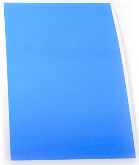
Dust Removing Sticker

Image: A visual representation of the screen protector's high definition clarity, showing a clear overlay on a vibrant field of yellow flowers.