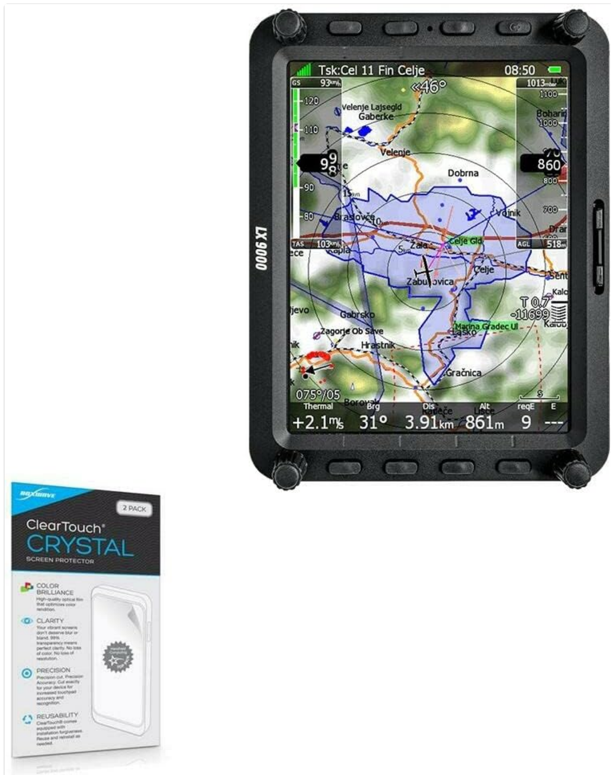
Image: The LXNAV LX9000 device shown alongside the BoxWave ClearTouch Crystal screen protector packaging, illustrating the product's intended use.