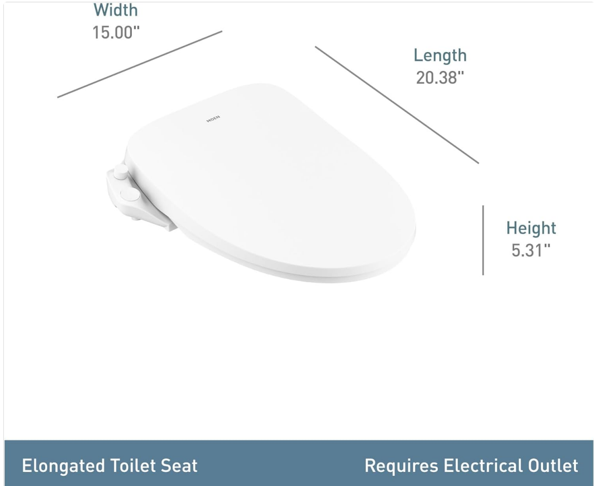
Figure 2: Product Dimensions. This image illustrates the width, length, and height of the elongated bidet seat.