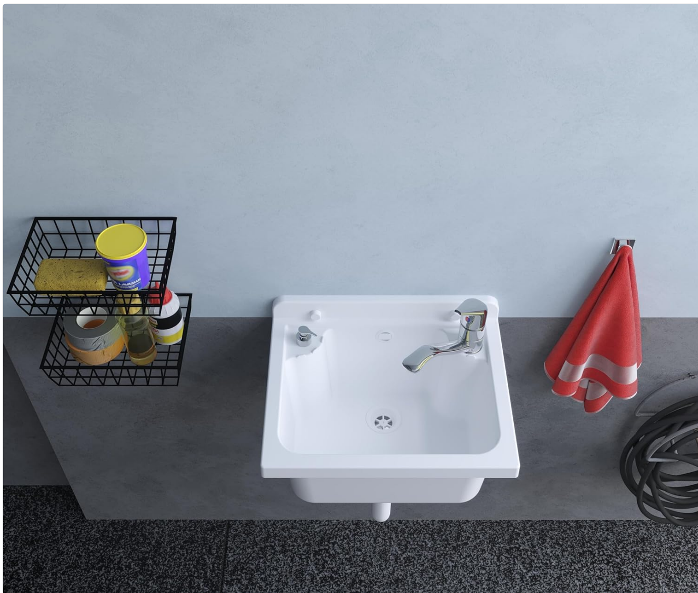
Image: Side view of the installed Negrari utility sink, highlighting its compact design.