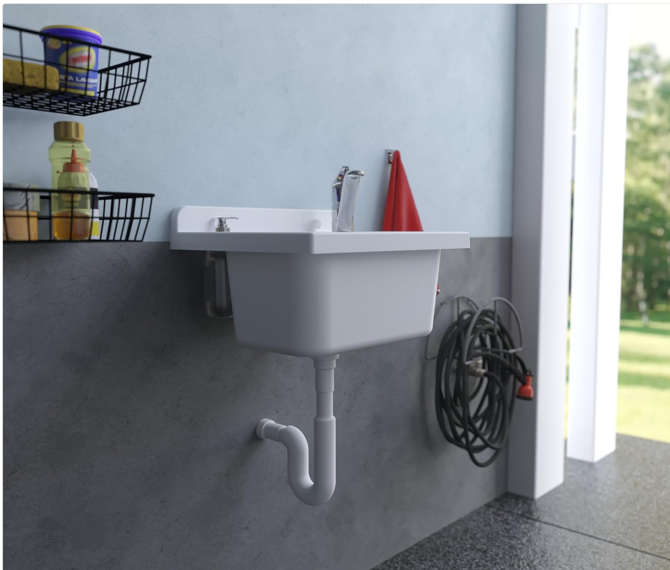
Image: Front view of the installed Negrari utility sink.