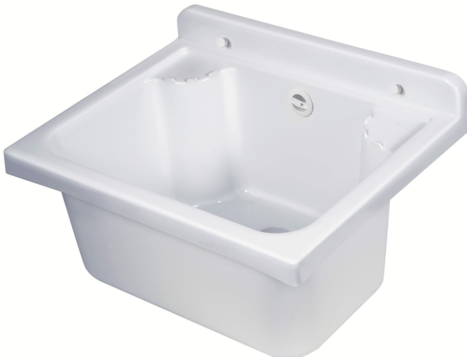
Image: General view of the Negrari 2051DAM wall-mounted utility sink.

Thank you for choosing the Negrari 2051DAM Wall-Mounted Resin Utility Sink. This product is designed for durability and versatility, suitable for various indoor and outdoor applications such as laundry rooms, gardens, terraces, garages, and verandas. Manufactured from virgin polypropylene resin, it offers excellent resistance to common acids and atmospheric agents. This manual provides essential information for safe installation, proper use, and effective maintenance of your new utility sink.