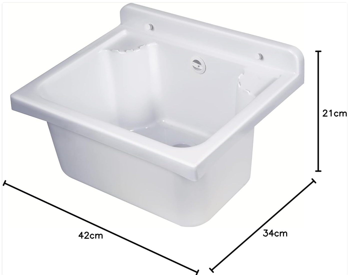
Image: Product dimensions diagram. The sink measures 42cm in width, 34cm in depth, and 21cm in height.