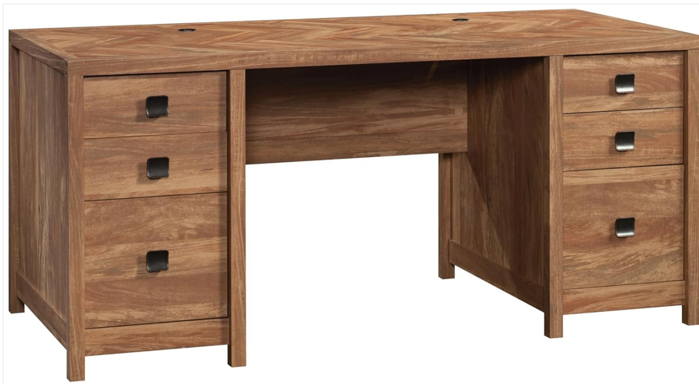
Figure 1: Front view of the Sauder Cannery Bridge Executive Desk.

The Sauder Cannery Bridge Executive Desk is designed to enhance your home office or workspace with its functional features and stylish Sindoori Mango finish. It offers a spacious work surface with a distinctive herringbone pattern and ample storage, including six drawers with full extension slides, two of which are designed for letter or legal-size hanging files. The desk also incorporates a cord management system to maintain a tidy workspace. Its finished-on-all-sides design ensures a polished appearance from any angle.