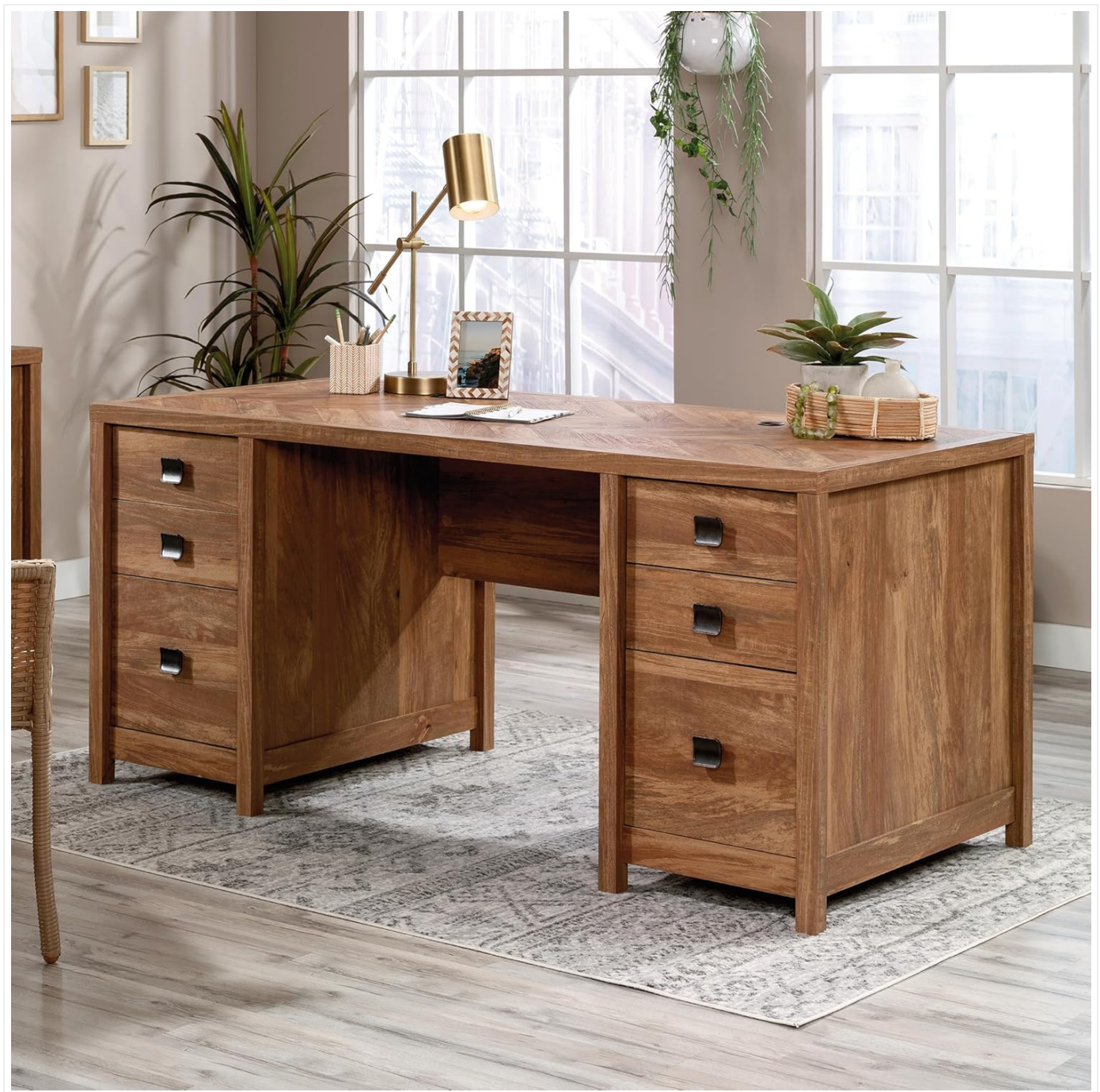
Figure 2: The desk features a spacious design suitable for various room settings.