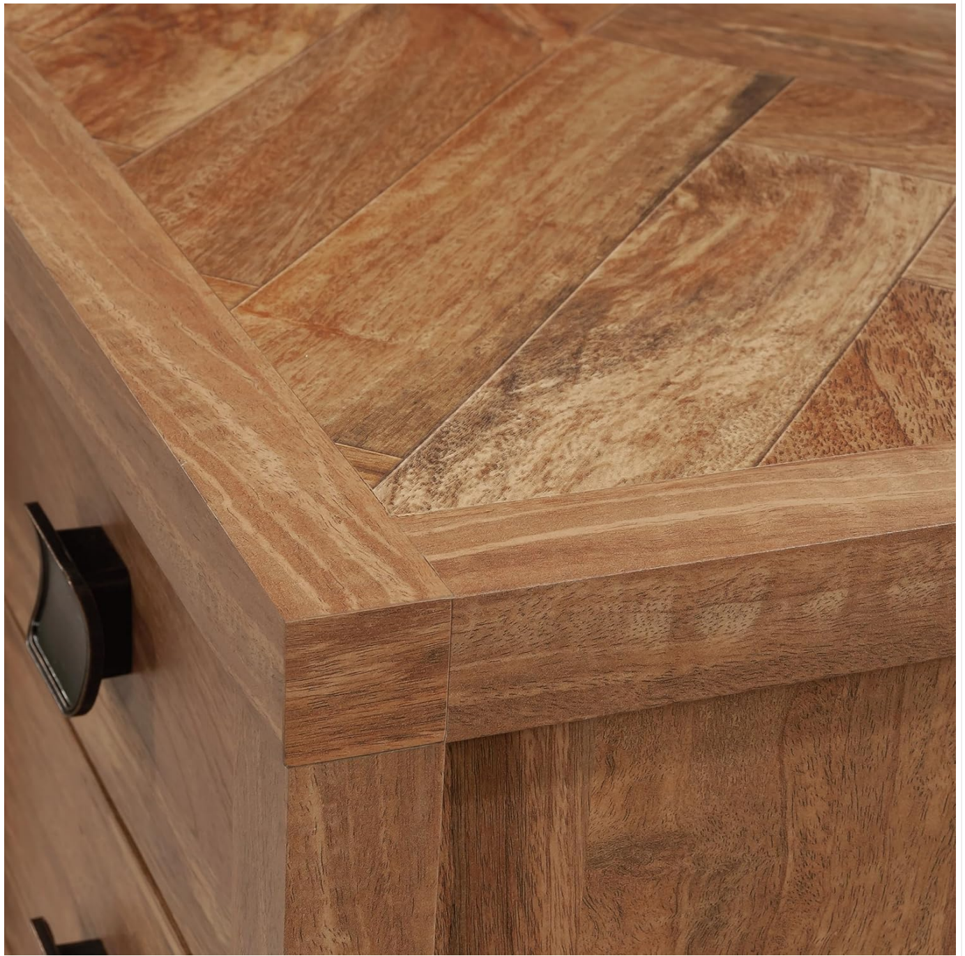
Figure 4: The Sindoori Mango finish and herringbone pattern require gentle care.