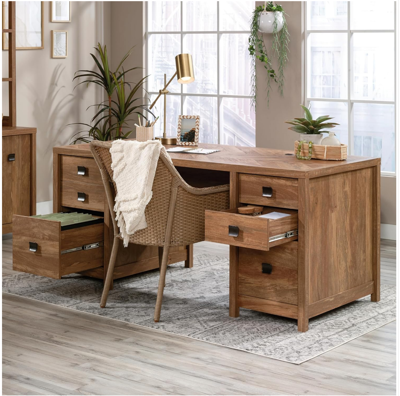
Figure 3: Drawers provide ample storage, including file organization.