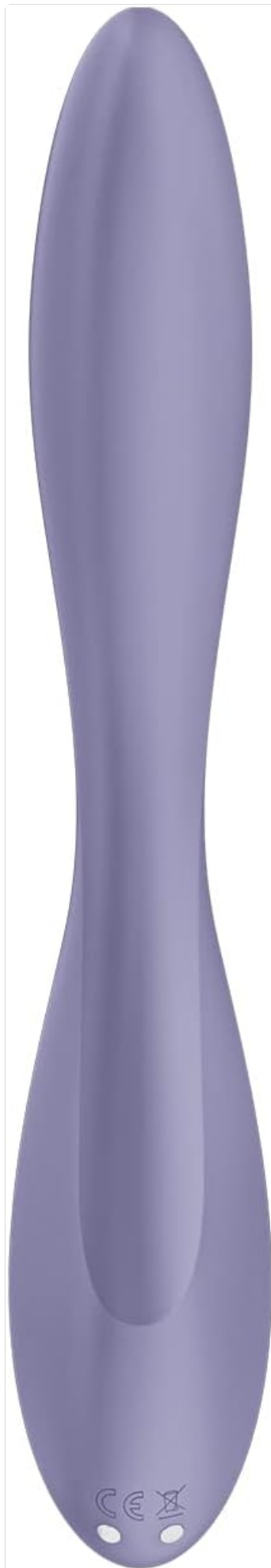
Image: The base of the Satisfyer G-Spot Flex 2, showing the magnetic charging contact points.