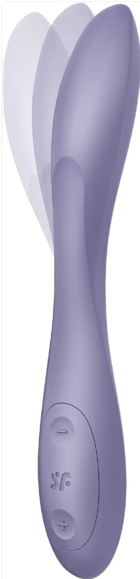
Image: The Satisfyer G-Spot Flex 2 vibrator demonstrating its bendable and flexible design, allowing for customized angles of use.