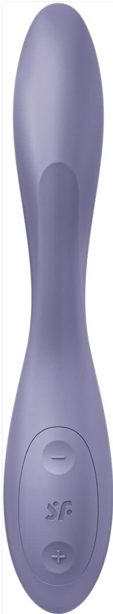
Image: Close-up of the control panel on the Satisfyer G-Spot Flex 2, showing the power button and '+' and '-' buttons for adjusting vibration settings.