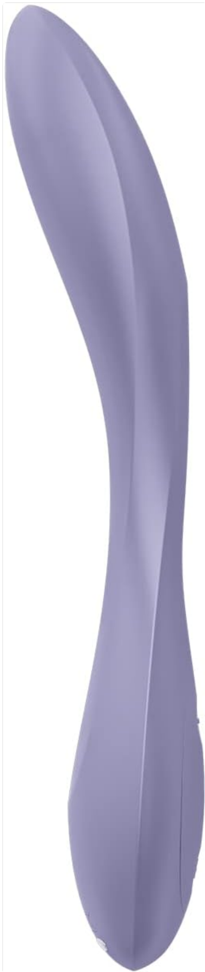
Image: The Satisfyer G-Spot Flex 2 vibrator bent into a curved position, highlighting its adaptable form for varied use.