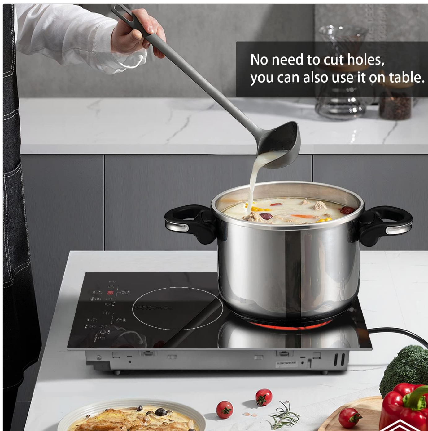
Figure 4.2: The cooktop is designed for easy countertop placement, requiring no modifications to your existing surfaces.

For countertop use, simply place the cooktop on a stable, flat, heat-resistant surface. Ensure adequate ventilation around the unit. The cooktop comes with pre-installed bottom brackets for stability.