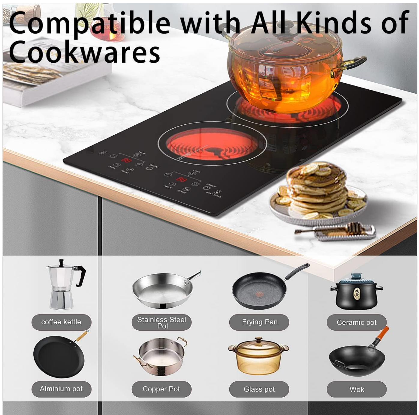
Figure 5.2: The cooktop supports a wide range of cookware materials, including coffee kettles, stainless steel pots, frying pans, ceramic pots, aluminum pots, copper pots, glass pots, and woks.

Your browser does not support the video tag.