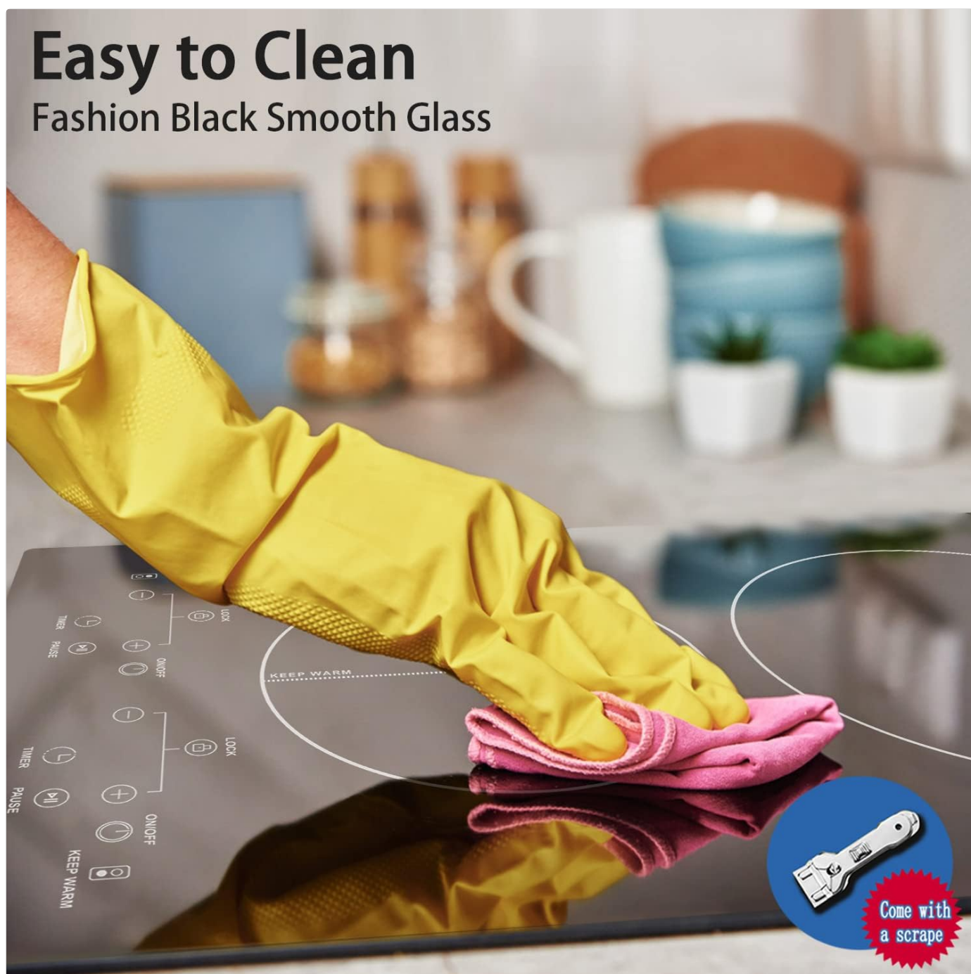
Figure 6.1: The smooth black ceramic glass surface is designed for easy cleaning, and a scraper is included for tougher residues.