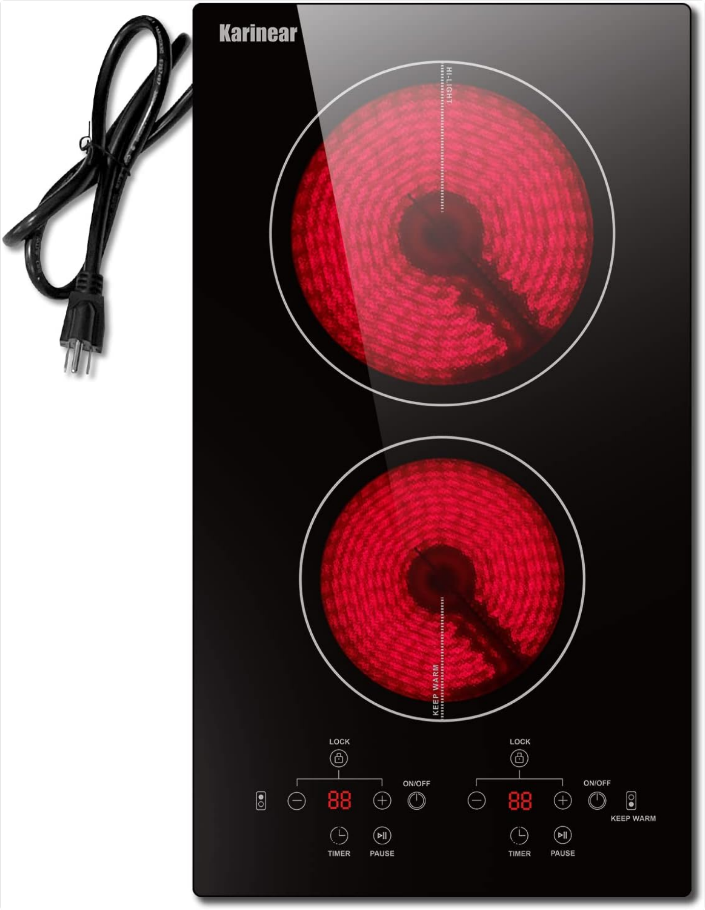
Figure 3.1: Top view of the Karinear 2 Burners Electric Cooktop, showing the two heating zones and the control panel. The power cord is visible on the left.

The Karinear 2 Burners Electric Cooktop features two radiant heating elements and intuitive sensor touch controls for precise cooking.