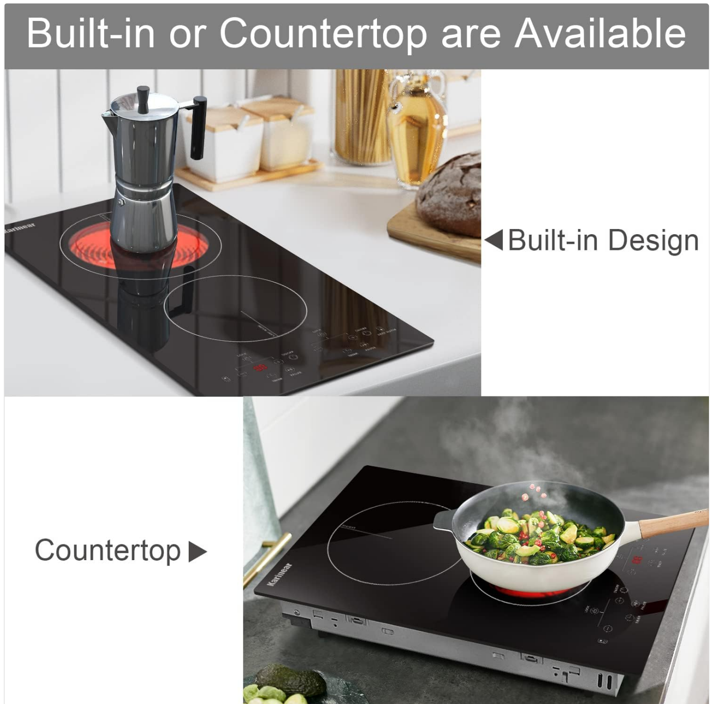
Figure 4.1: The cooktop can be used as a built-in unit, flush with the countertop, or as a portable countertop appliance using its integrated feet.

Your Karinear Electric Cooktop offers flexible installation options: built-in or countertop use.