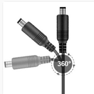
Illustrations of the power cord's flexible cable and rotating connector, designed for durability and ease of use.