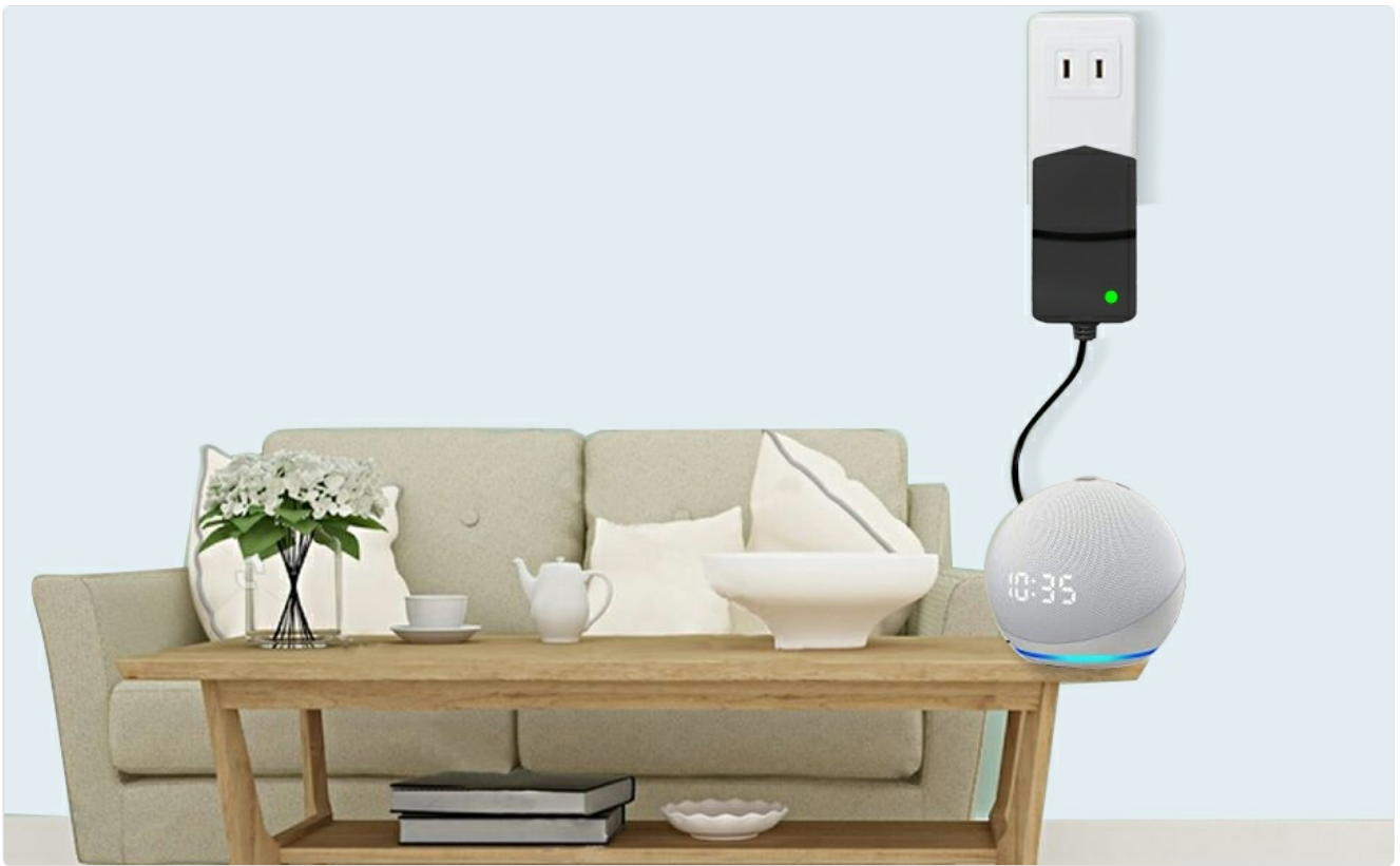
An Amazon Echo Dot with Clock powered by the YANZHI adapter, ready for operation.