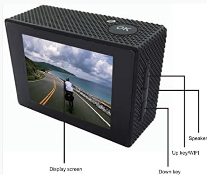
Figure 4.2: Back view of the CamGo 4K Action Camera. This image highlights the display screen, the 'OK' button, and labels for the 'Up key/WiFi' and 'Down key' on the side, along with the speaker, providing a clear guide to the camera's rear controls and display.