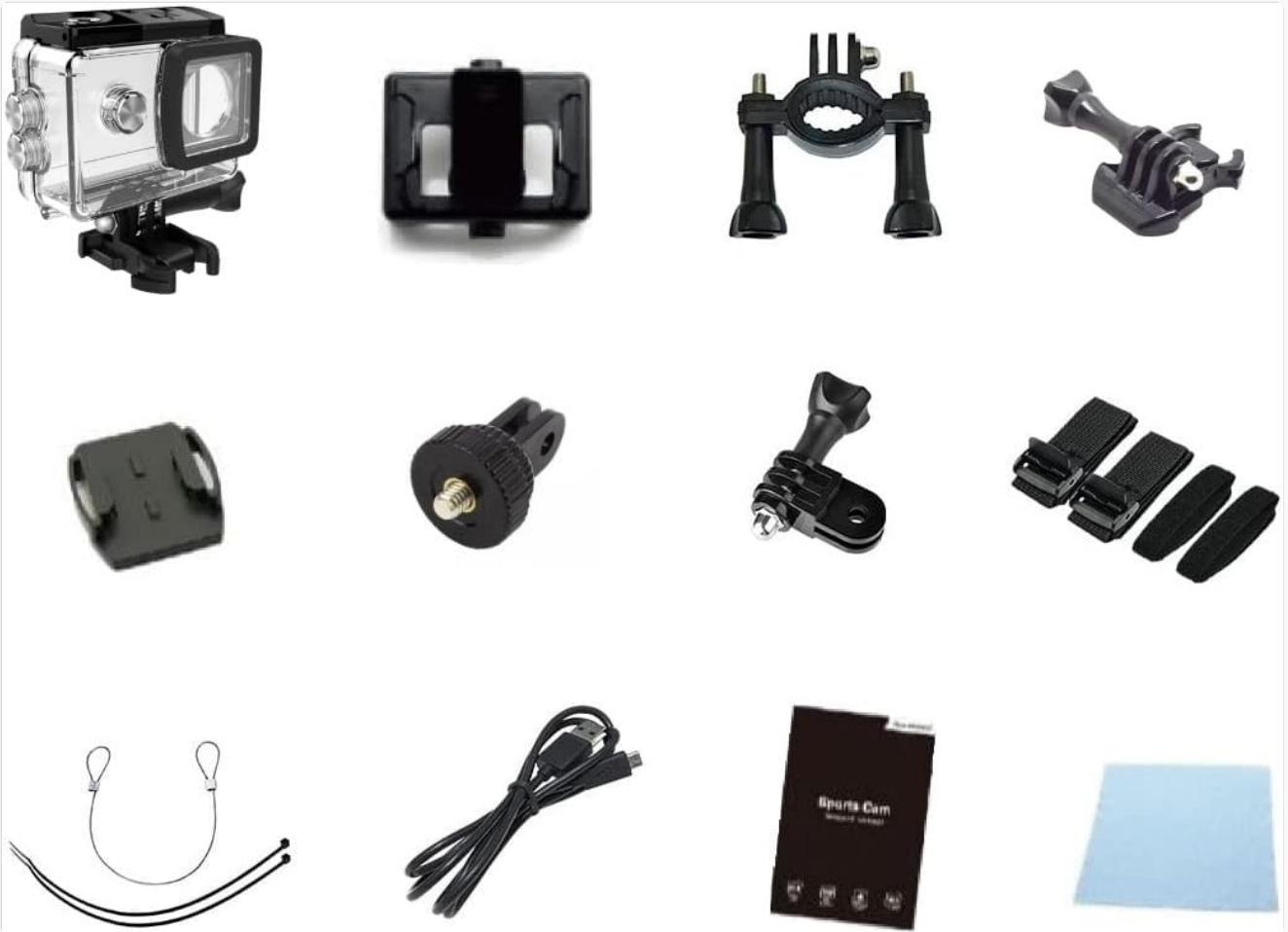
Figure 3.1: Included accessories for the CamGo 4K Action Camera. This image displays the camera's waterproof housing, various mounting brackets, straps, a USB charging cable, and a cleaning cloth, illustrating the comprehensive set of tools provided for diverse usage scenarios.