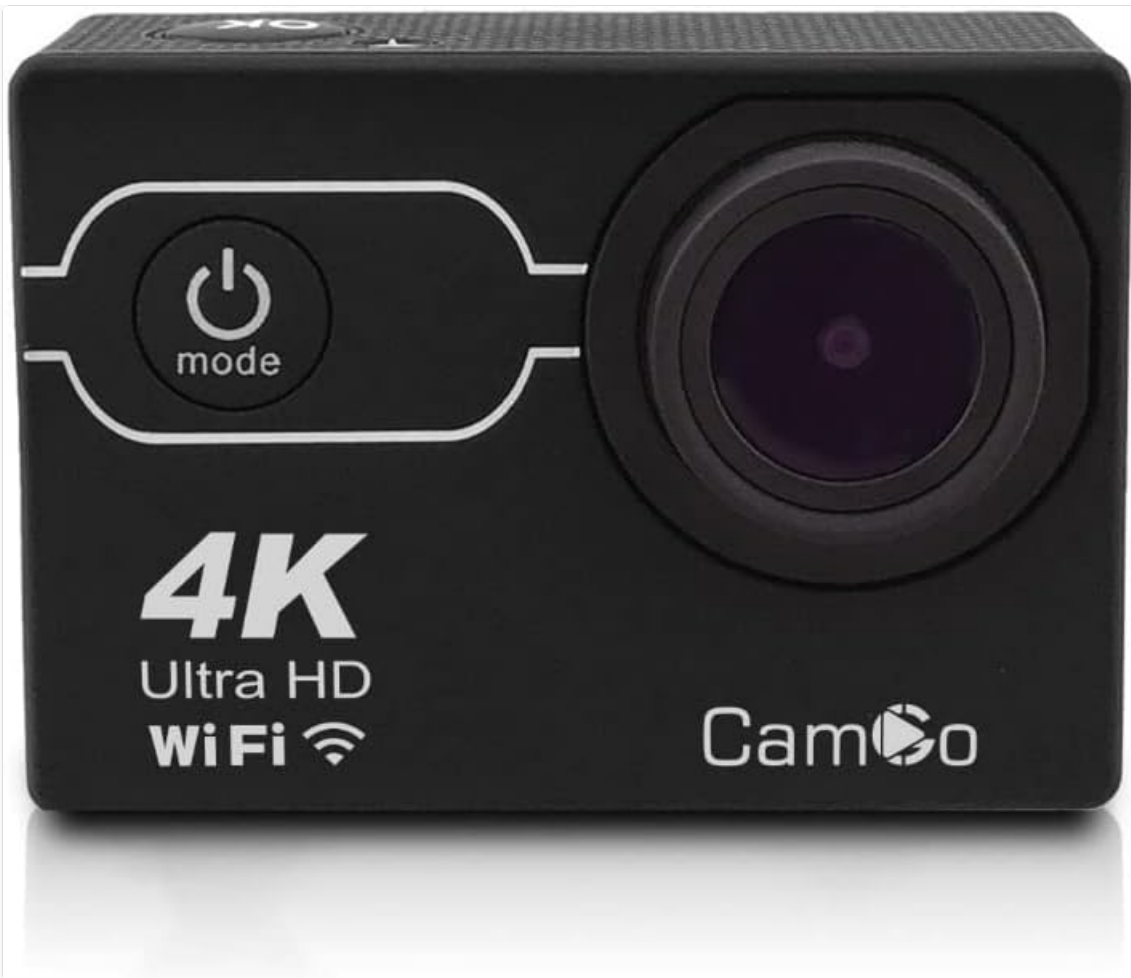
Figure 4.1: Front view of the CamGo 4K Action Camera. This image shows the camera's lens, power/mode button, and the '4K Ultra HD WiFi' branding on the front panel, indicating its core features.