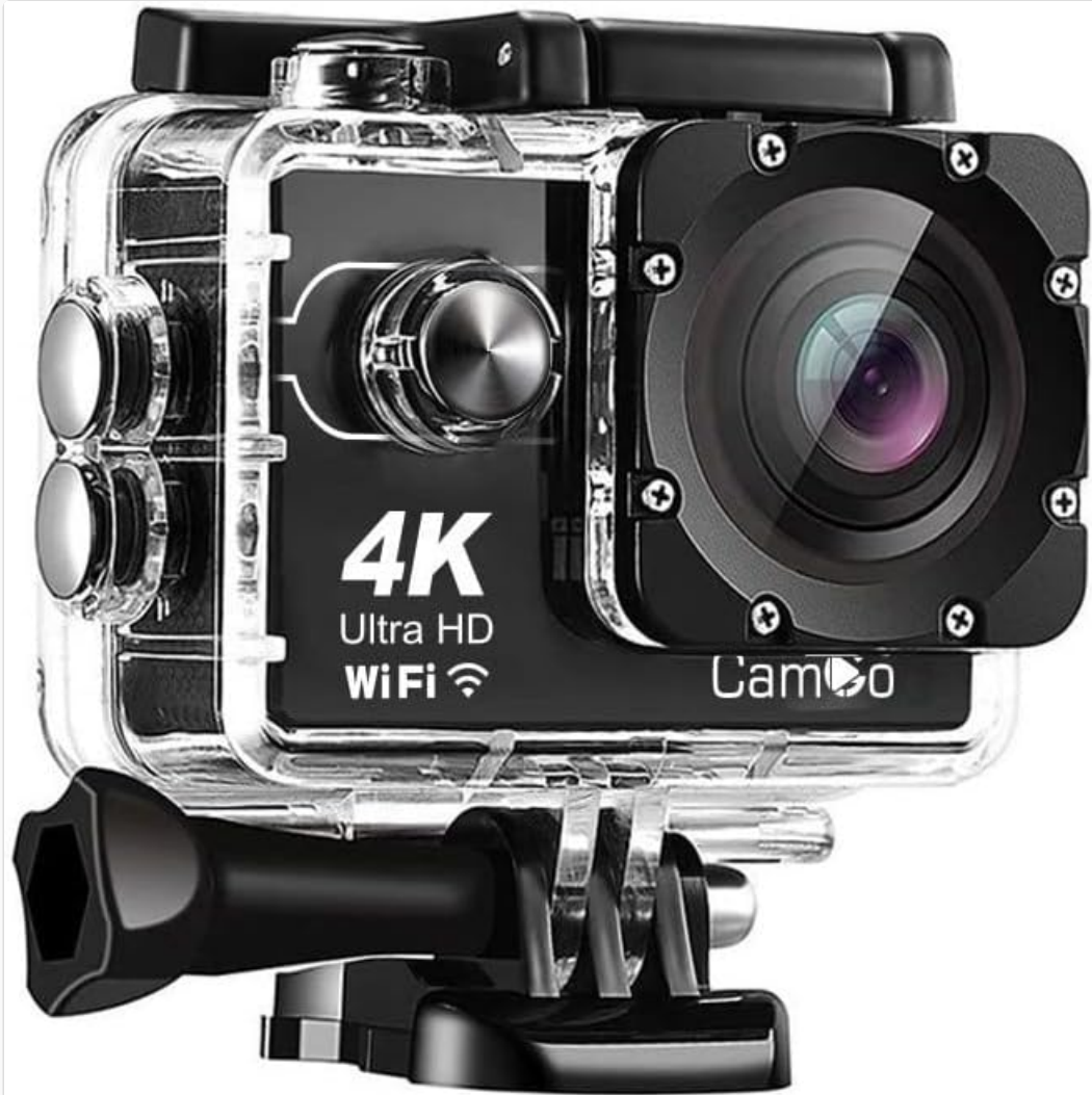
Figure 5.1: CamGo 4K Action Camera in its waterproof case. This image displays the camera securely housed within its transparent waterproof casing, ready for underwater use, highlighting the protective design.