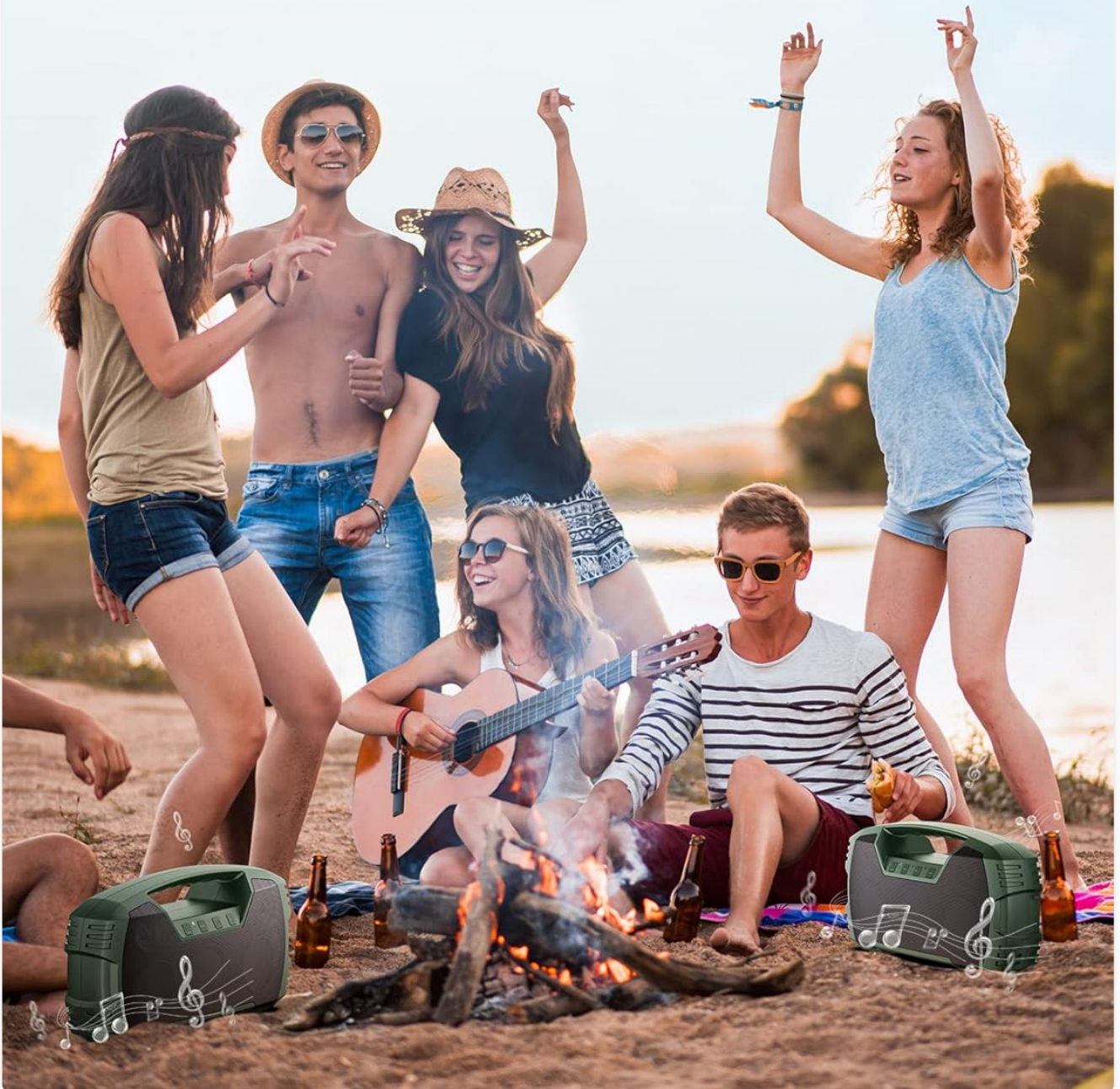
Image 5.2: Two speakers paired for True Wireless Stereo experience.

Double up, bring 80W of super loud stereo sound